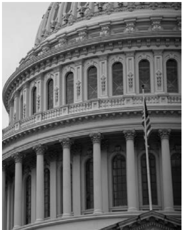
The Capitol Building, D.C.

assault and harrasment training, but... people don’t take it in.” Although it’s unclear what the future of unionization will be, it’s becoming a topic that is increasingly spoken about in Congress. Moreover, although the topic of unionization holds weight for current staffers, it also holds weight for political science students at the University of New Haven, many of whom are either planning to study in Washington, or are currently studying in Washington in the Washington Institute Internship (WII). A number of students are currently interning in D.C. as a part of WII, and many university alumni are also actively working in D.C. Improving working conditions on Capitol Hill, and creating a more transparent working environment has positive ramifications for all future and current employees in Washington. The Dear White staffers Instagram page did not respond to a request to comment.