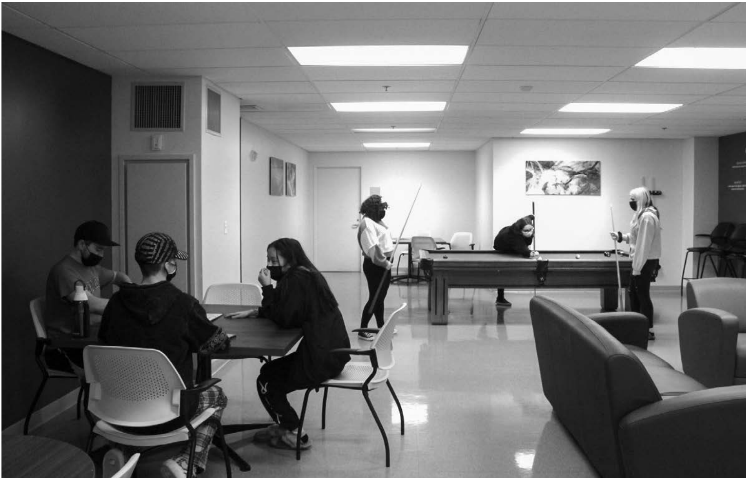
Students hang out while wearing masks inside of Bergami Hall., West Haven