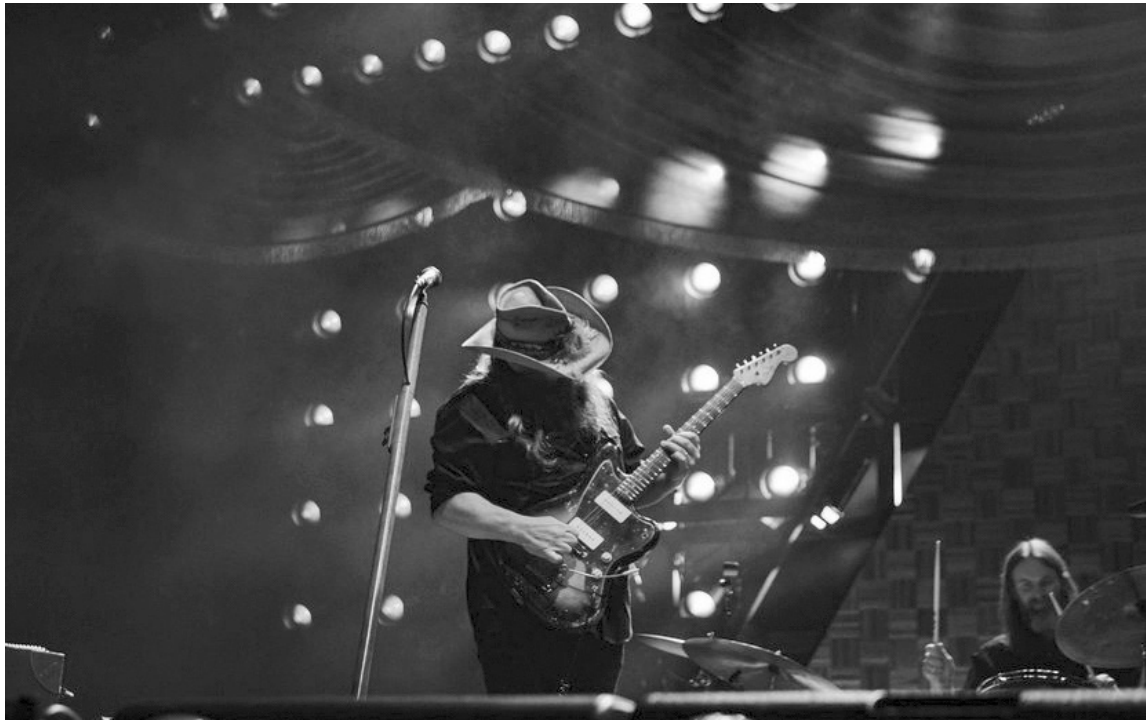
Chris Stapleton performing on stage, Knoxville, Tenn, Dec. 12, 2022.

An absolute juggernaut singer-songwriter, HARDY stands apart from other artists particularly because of his usage of