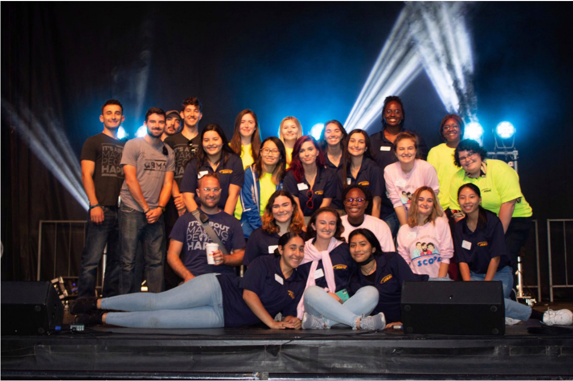
Members of SCOPE on stage during Homecoming, West Haven.