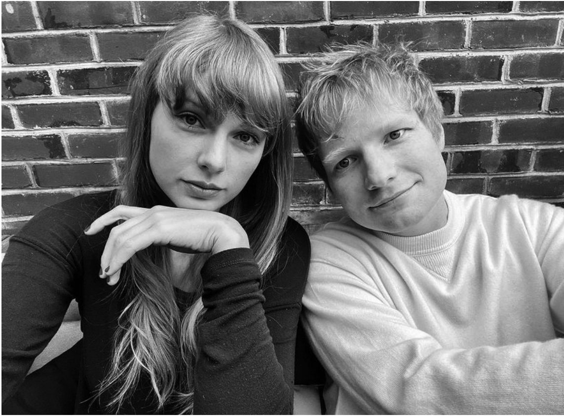
Taylor Swift and Ed Sheeran. real exchange between the singers originally shared on Swift’s