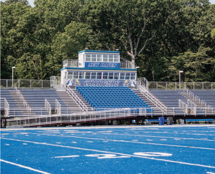
Outside the Ralph F. DellaCamera Stadium, West Haven, 2021.

The culture surrounding NASCAR may always confuse me. NASCAR is uniquely poised with the opportunity to once again rebel against the norms and welcome anyone and everyone with a need for speed, but doesn’t succeed.