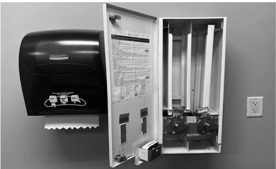
An empty tampon dispenser inside of Bartels Hall, West Haven, Feb. 22, 2022.

rence—sometimes without much support. In one recent trip around campus, five of the 26 women’s bathrooms in academic buildings at the University of New Haven, a metal box with a sticker asks for 25 cents for a pad or tampon. But all of these were empty, and the other 19 were simply nonexistent. And, even assuming they’re not empty or broken, 25 cents isn’t fair. To put 25 cents into perspective, a 40 pack of Always UltraThin maxi pads from Target costs $5.79. The price of each pad would come out to roughly 14 cents. In a digitized vending machine in Kaplan Hall, you can get three Kotex tampons for $2.99. A pack of these at Walmart is priced at $9.27, meaning each individual product costs 20 cents. There is only one bathroom that offers free pads and tampons in any academic building, and it is presumably made by a student: a small basket of things with a note that says “FREE” written next to it on a piece of paper.