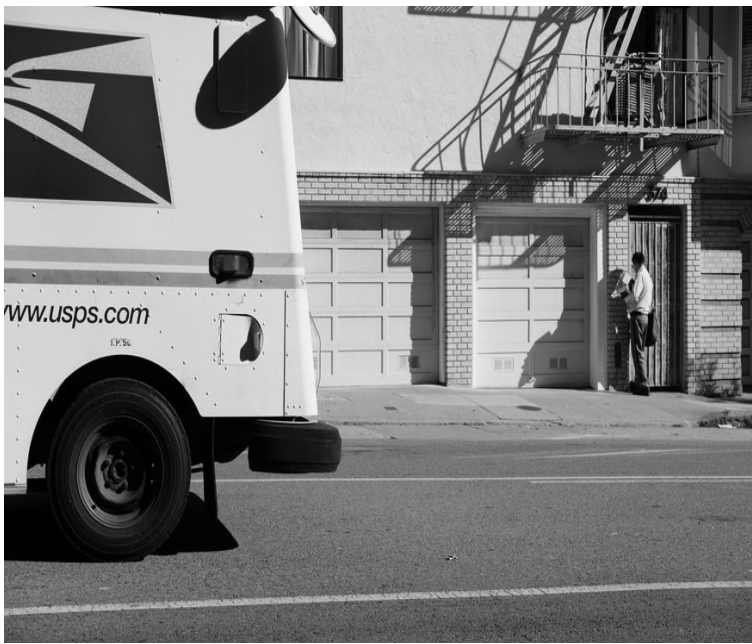
USPS van parked on a street, San Francisco, Dec. 28, 2021.