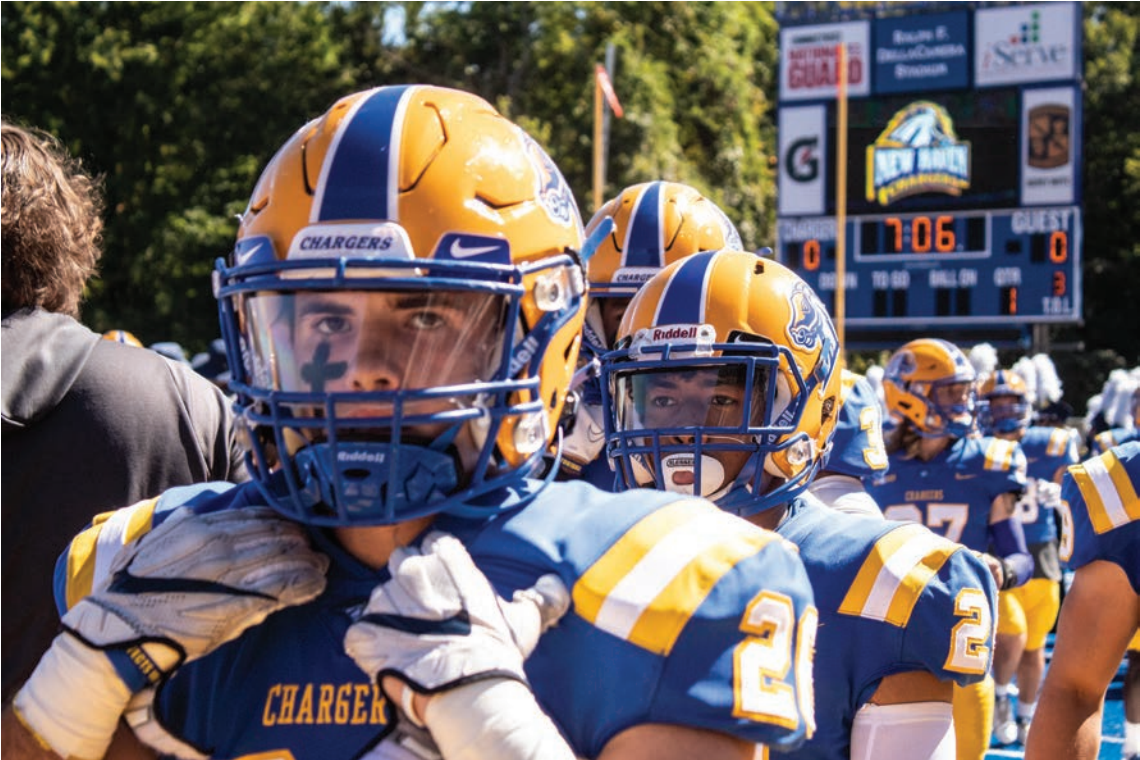
Football players stand on the sideline at the game, West Haven, Sept. 26, 2021.

The Chargers return to action on Tuesday when they travel to New York to face off against the College of Saint Rose with kickoff coming at 4 p.m.