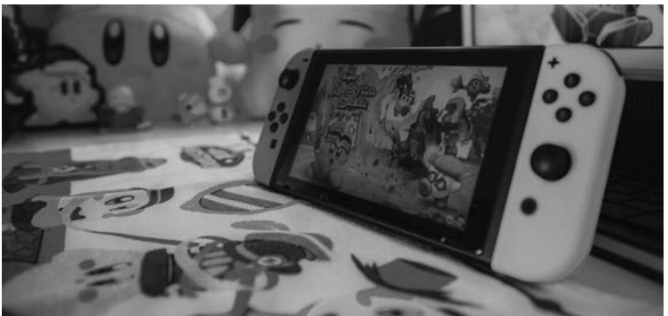
Super Kirby Clash being played on a Nintendo Switch