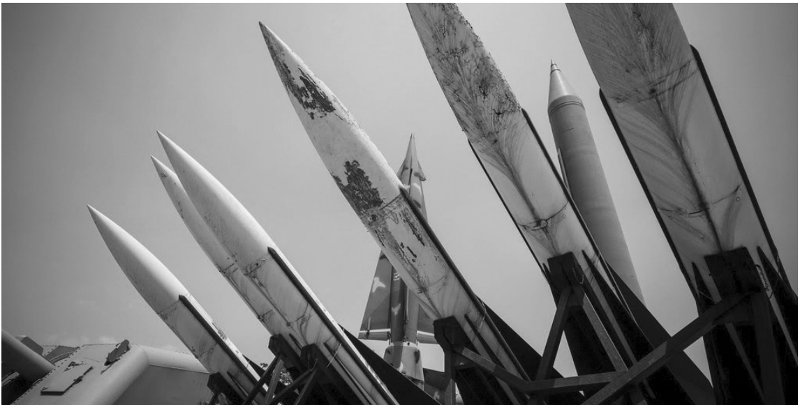
Korean Nuclear Missiles

North Korean Supreme Leader Kim Jong Un has announced his