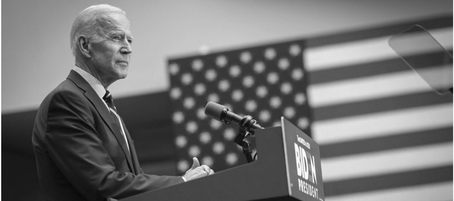
President Joseph Biden giving the CUNY Foreign Policy Speech in 2019

Specifically, some of the most defining foreign policy decisions that Biden has had to make are the withdrawal of U.S. troops in Afghanistan, navigating tense relations with China and Russia and dealing with the potential for