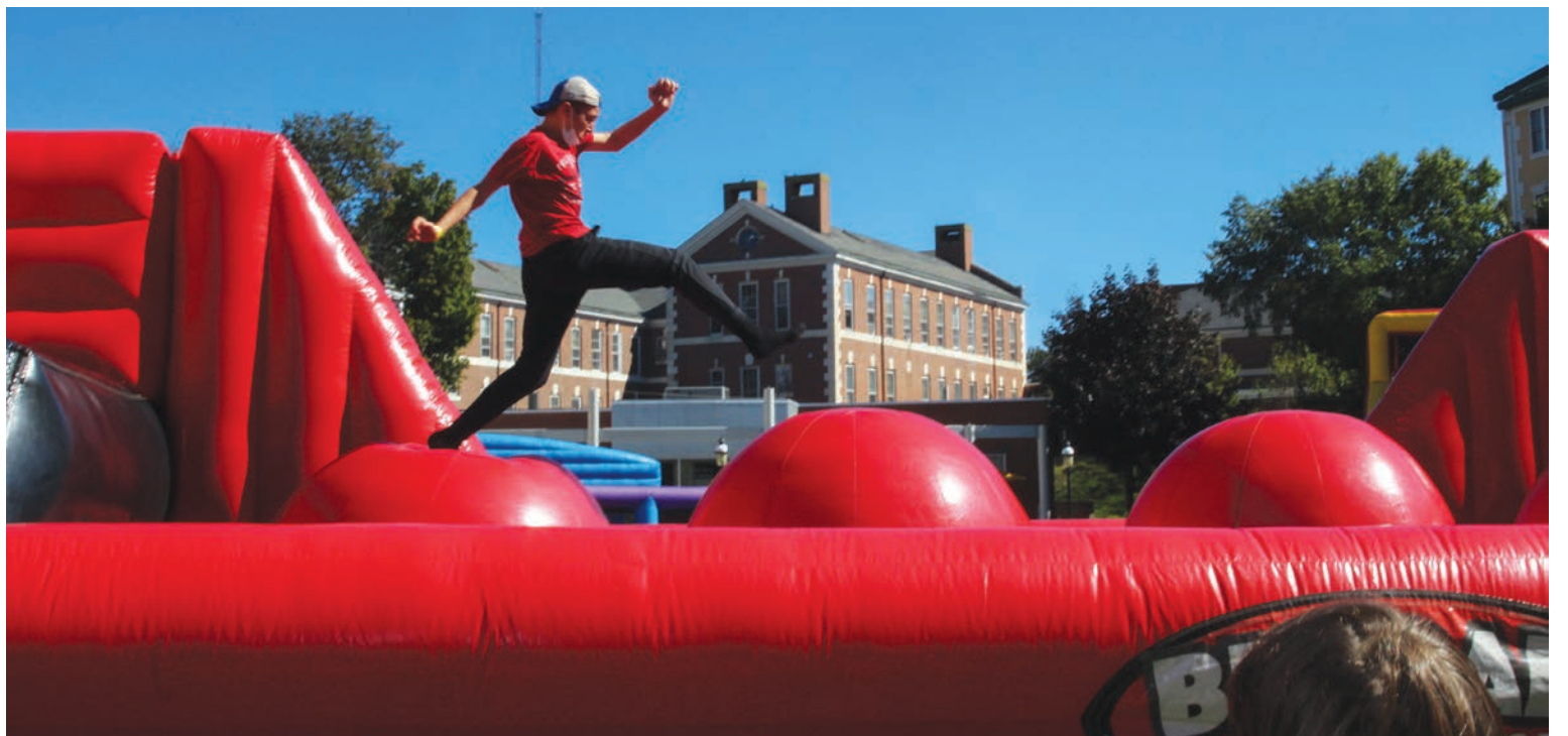
A student runs across an inflatable s at at Family Day, West Haven, Sept. 25, 2021

The Student Committee of Programming Events (SCOPE) engulfed the Bixler/Gerber Quad with inflatables. Guests of any age bounced around and competed in the Inflation Fun Fest obstacle courses and slides. Here, visitors could sit with a cari-