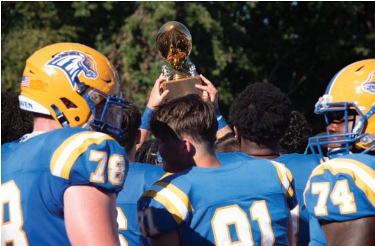
Football players celebrate with the Elm City Trophy, West Haven, Sept. 26, 2021.

The Chargers will hit the road for the first time next Saturday in a matchup against Pace University at 1 p.m. Live stats and a broadcast for the game can be found at NewHavenChargers.com .