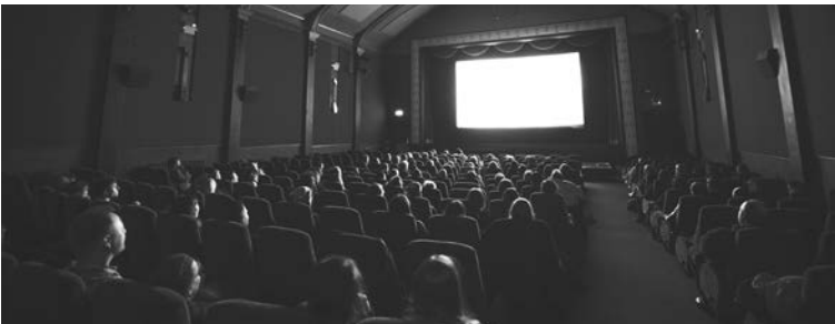
Inside a crowded movie theater.

lan ended his 19-year partnership with Warner Bros. According to Indiewire, industry watchers expected Nolan to leave Warner Bros. after his interview with ET Online in late 2020. The interview occurred after Warner Bros. announced that they would push their 2021 film slate to a hybrid release model, meaning titles would premier simultaneously in theaters and on the company’s streaming service, HBO Max, for 31 days.