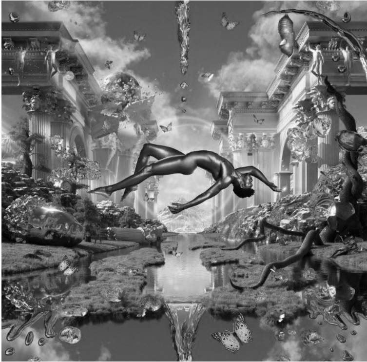
Lil Nas X debut album, MONTERO, album art.