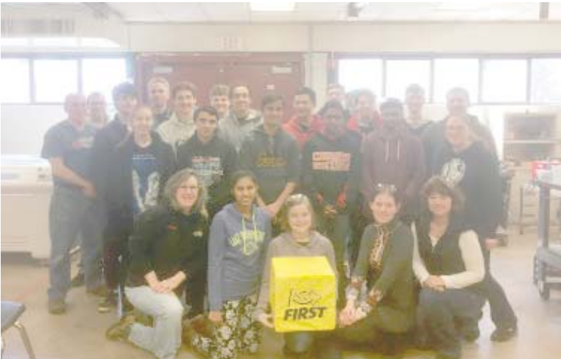
Picture of Team 999, MechaRAMS

Team 999's place is strong and we are preparing for our competition in the Hartford Event on April 7 and 8. To further support us and be up to date on our events and happenings, follow us on our website: frcteam999.com; Facebook: FIRST Team 999 - Cheshire MechaRams and Instagram: