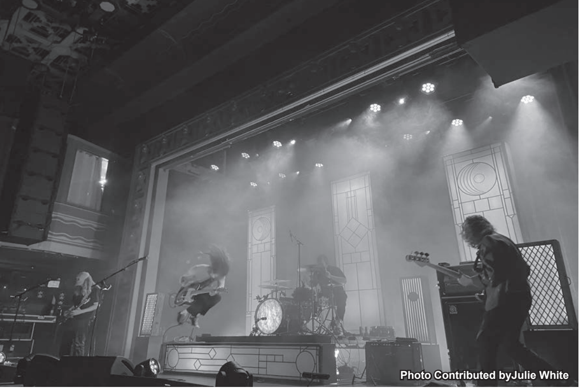
The Backseat Lovers perform a lively show in Wesbter Hall.

I would definitely recommend their music and going to one of their concerts if and when they tour again, if you like their songs!