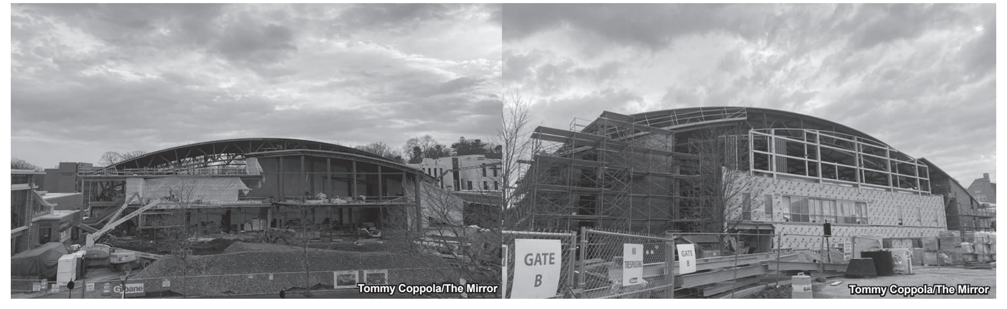
Pictured left is a photo from the top of the Kelley Center parking garage, where one can see the front of the new arena. On the right is a view from the back of the arena near the Bannow Science Center.