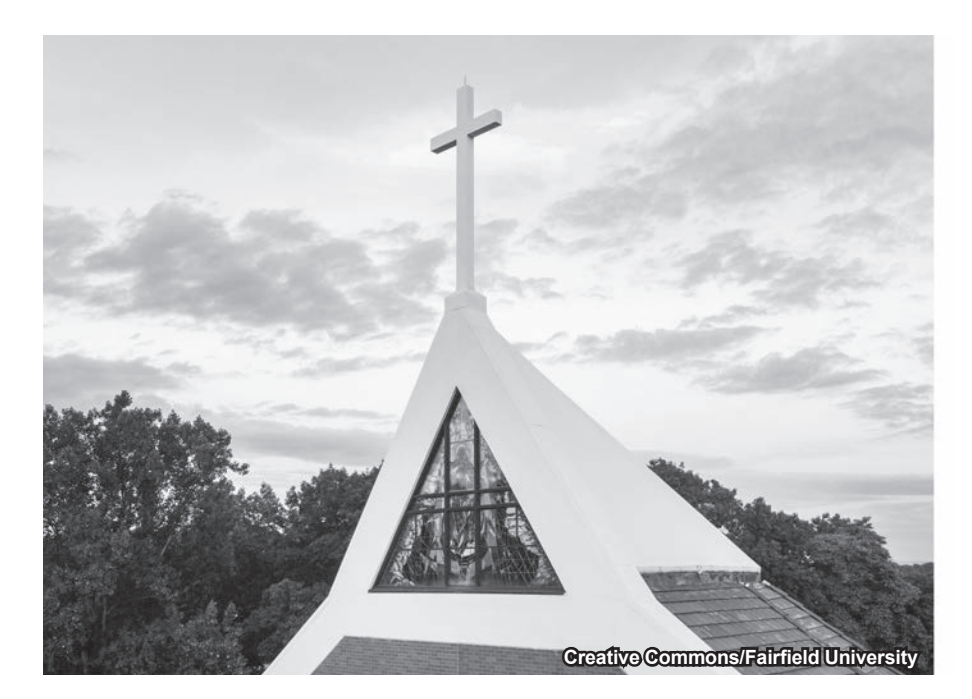
The Fairfield University Egan Chapel is a symbol of faith on campus. This represents the university's devotion to a continuance of the Jesuit mission.

Why, then, would President Nemec want to invoke institutional neutrality? What would be the value that would outweigh the honest recognition that a Catholic and Jesuit school should be working to change the world for the better, not just reflecting the values of an increasingly dysfunctional world? Recent events here at Fairfield seem to suggest that institutional neutrality is a cover for avoiding offending "certain people." But if you stand for anything, you will offend some people. Maybe even potential donors or powerful alums. But you will offend a whole lot more if you kowtow to the fear of offending the powerful few. That seems to be what has happened here in this past couple of weeks. In a Jesuit and Catholic school, even a "modern" one, institutional neutrality is distasteful and antithetical to the mission and identity of our academic home. It's time that senior leadership got in line.