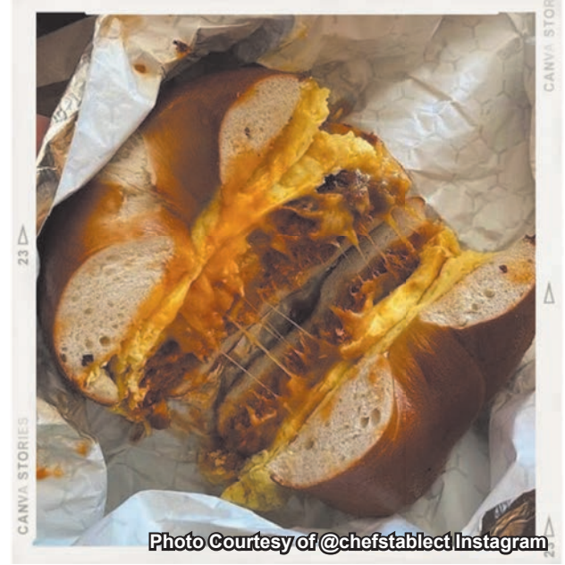
A bacon, egg and cheese sandwich is the way to go!

Hole in the Wall located on Post Road just be-