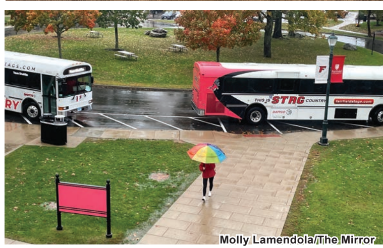
Tuesday, Oct. 26, a nor'easter hit Fairfield University's campus bringing excessive rain and powerful winds with some classes cancelled. (Top: Garbage bins placed below accessibility ramp in the Lower Level of the Barone Campus Center to collect leak, Bottom: Student walks with rainbow umbrella toward Barone Campus Center)