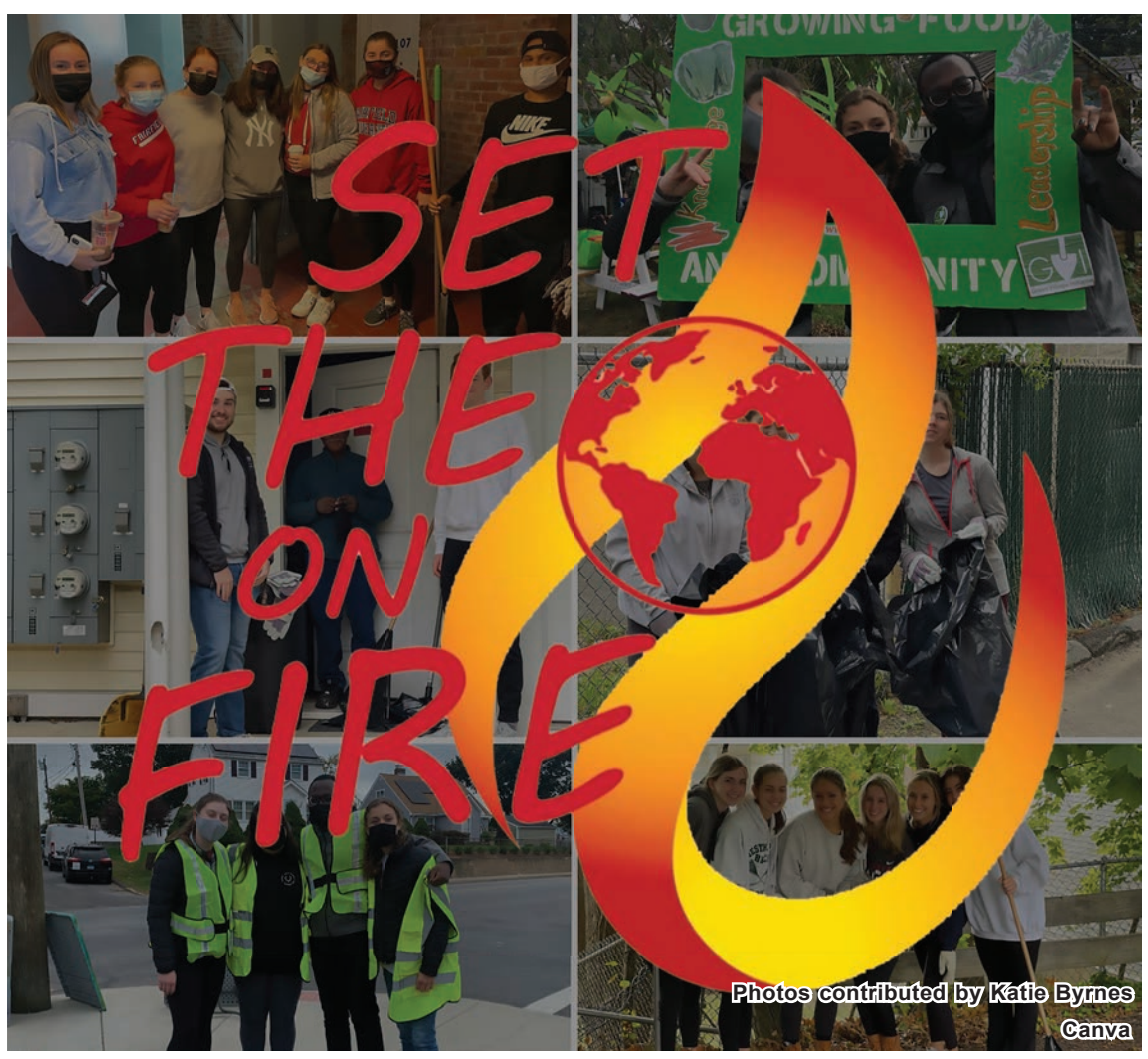
Pictured above is the logo for Campus Ministry's "Fairfield On Fire" Event that took place this past weekend on Saturday, Oct. 23. Students participated in service events in and around the Fairfield County area.