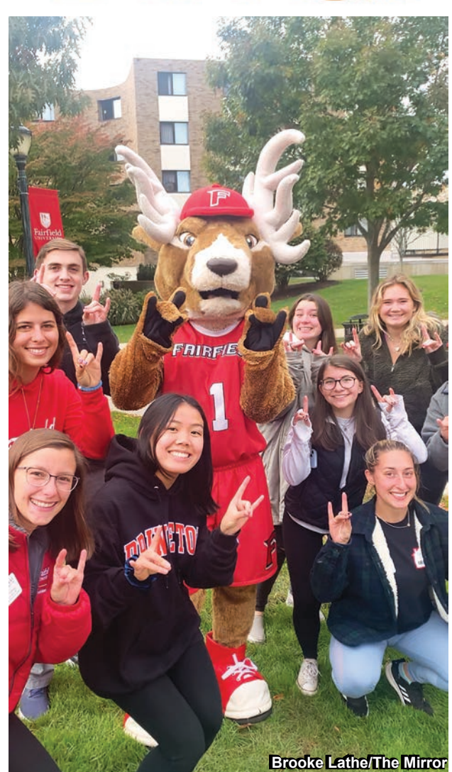
Students poses with Lucas the Stag at IRHA's annual New England Day event.

Surrounded by local fall weather, held in the mandala of campus, New England Day was a microcosm of the Fair-field experience that will hopefully serve as a precedent for the events to come, as it safely rebuilds the social environment on campus.