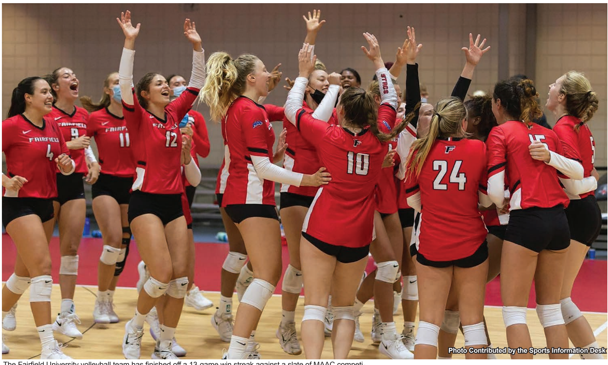
The Fairfield University volleyball team has finished off a 13-game win streak against a slate of MAAC competitors, finally falling to Canisius College in a hard-fought five set game on Oct. 24.