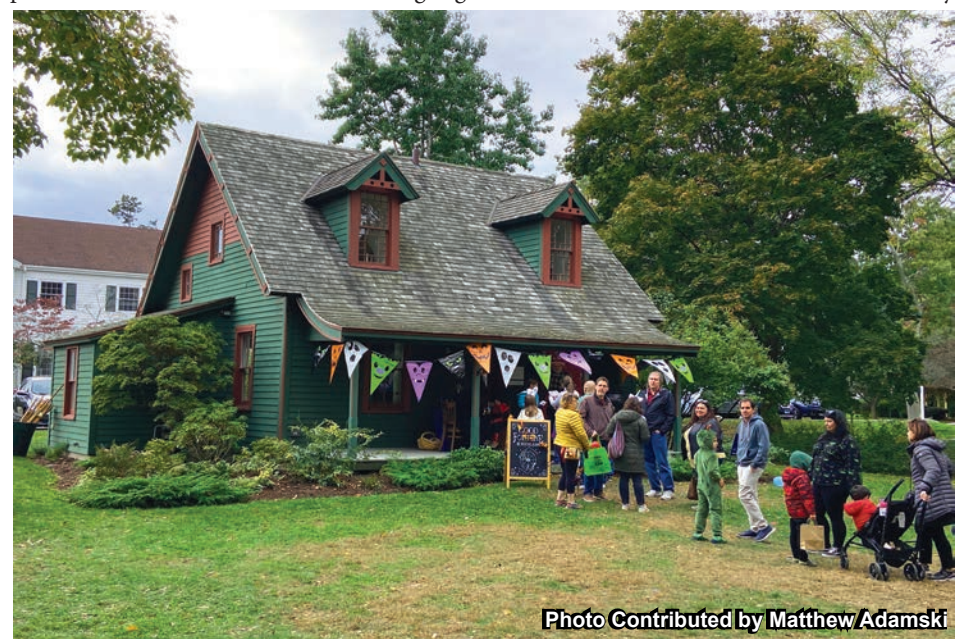
A line of children wait to grab Halloween candy at the fi fth annual Halloween on the

through the creaking house, and keeping with the Halloween theme, there was a display of the witch trials that were local to Fairfield, Conn. Infographics lined the wall that told the story of those condemned to death for witchcraft. One such case study