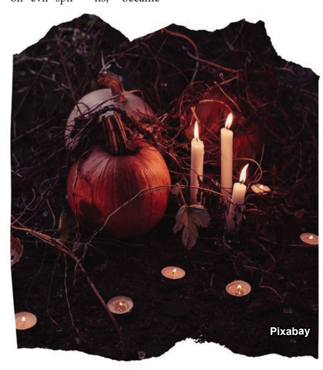
combined with practices from All Saints Day, falling on Nov. 1. Thus, All

the transition from the harvest Hallows Eve was born, evenperiod to the cold, darkness of tually evolving into the celwinter. This festival, involving ebration of Halloween that is practiced today.