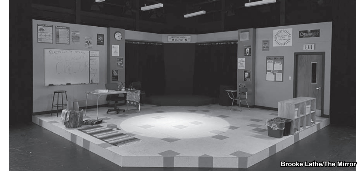
"The Thanksgiving Play" set was a present day high school classroom.

On Wed, Oct. 20-23 at 7:30 p.m. and Oct. 23 and 24 at 2:00 p.m, Theatre Fairfield performed its first live show since 2020: "The Thanksgiving Play" by Larissa FastHorse. This one-act satirical production is actually one of the ten most produced plays in the U.S. over the past four years.