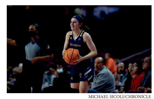
SPORTS P. 11: PLAYING THROUGH THE PAIN Quinnipiac women's basketball grits its teeth through physical injuries and mental fatigue during one-sided WNIT loss to Boston College