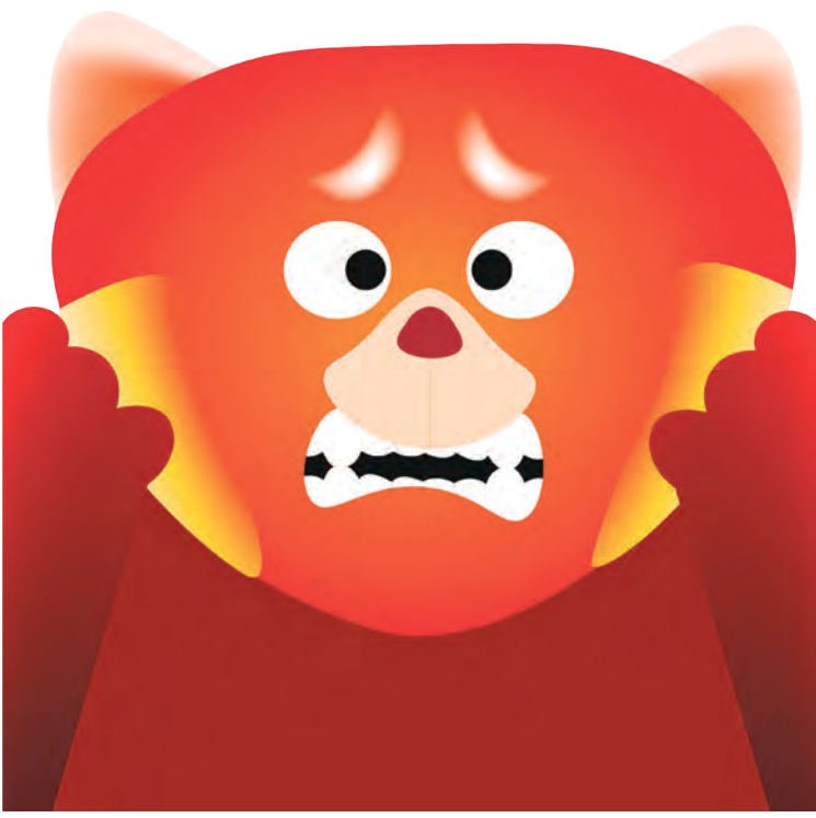
ILLUSTRATION BY SHAVONNE CHIN

children the opportunity to see themselves in media, especially a Disney or Pixar movie. I hope that Disney and Pixar continue to tell inclusive stories of characters in fun, memorable ways.