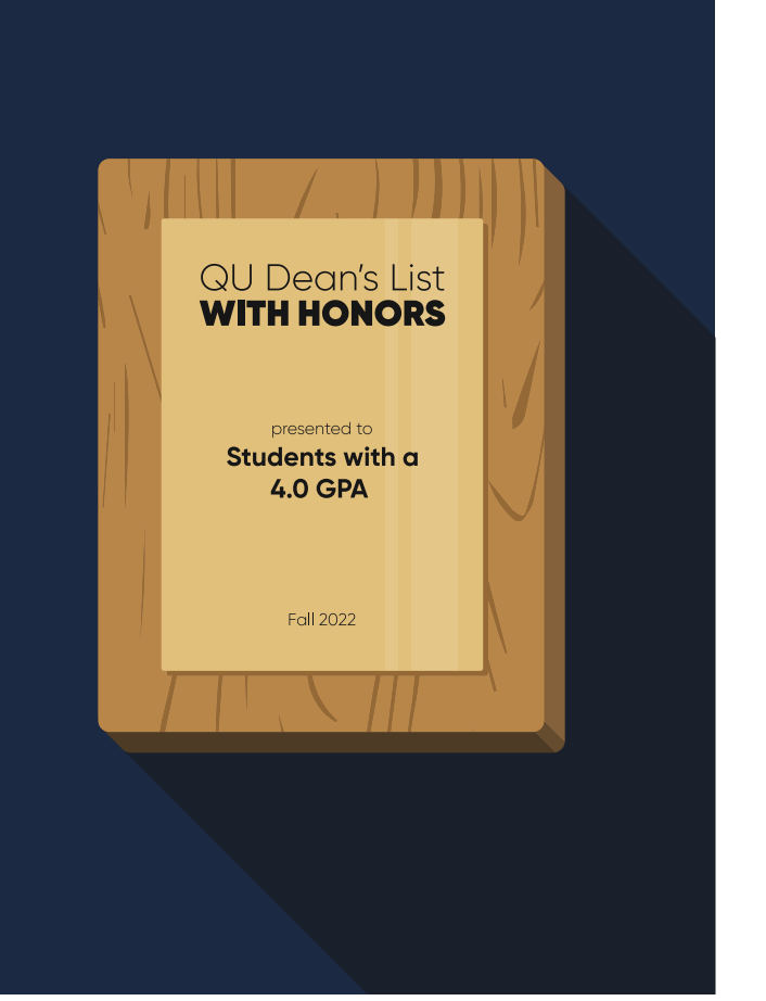
ILLUSTRATION BY PEYTON MCKENZIE