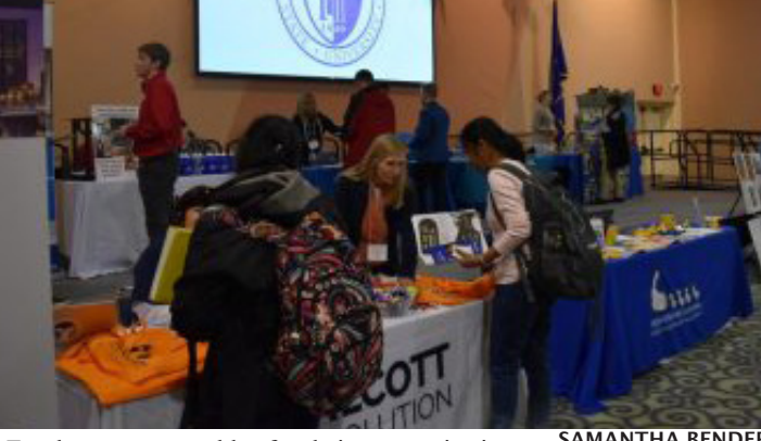
Employers set up tables for their companies in the CCSU Student Center Alumni Hall.

Upon entering the fair, students were given a floor plan of the event setup to help them best navigate their way through the different tables and employers. On top of being able to network