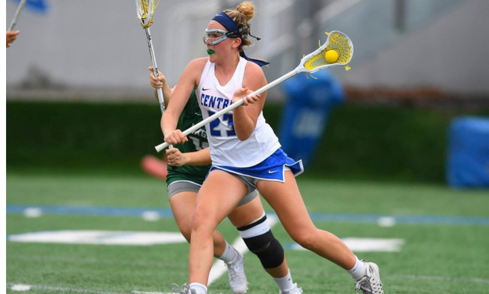
Lacrosse stats their 2020 campaign with two losses, one home and one away.