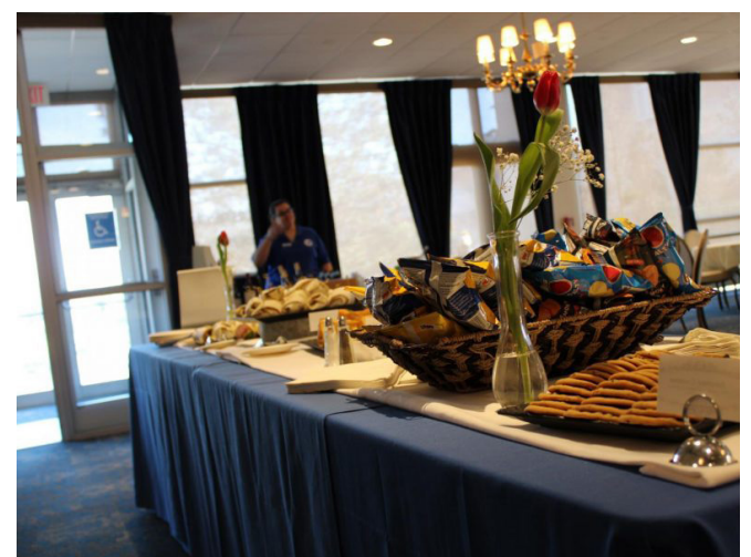
Sides were also available such as cookies, chips and pretzels.