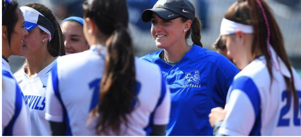
Softball is projected to finish seventh in the NEC according to the Preseason Coaches Poll.