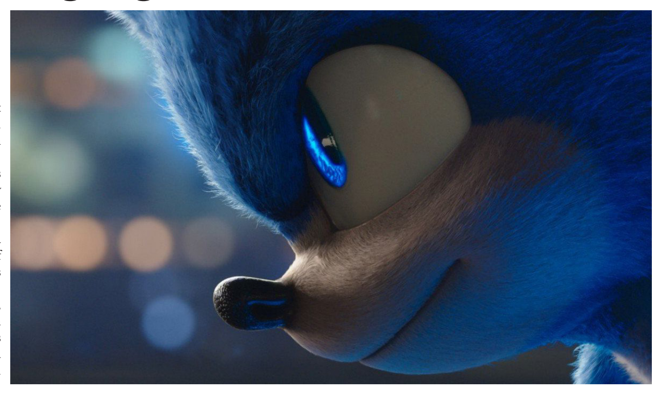
Sonic The Hedgehog is not your average children's film.

The viewer and Tom are coaxed further into despair by Sonic's silver tongue and running prowess. Tom finds himself in a bar fight, being beaten senseless while