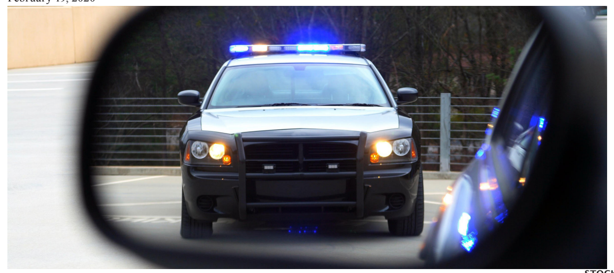
Faculty and staff have the opportunity to gain proper safety training during the semester