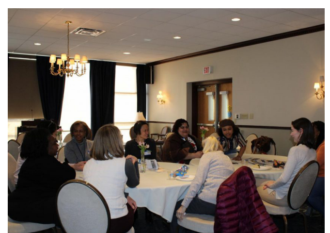
Women of CCSU gathered to socialize and