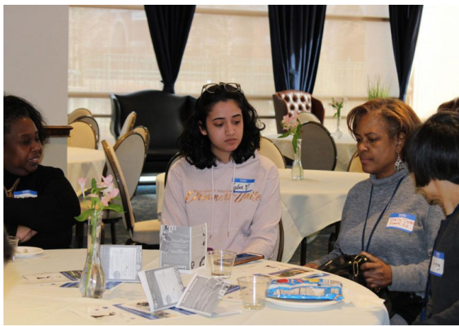
Women's Happy Hour was open to women who are senior students, faculty or staff.