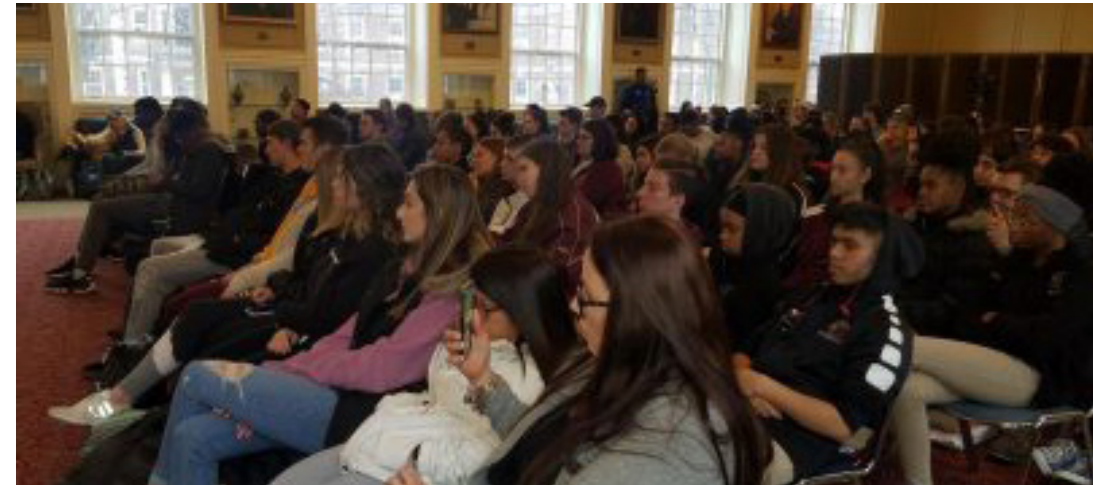
Guests included local high school students and members of the CCSU community