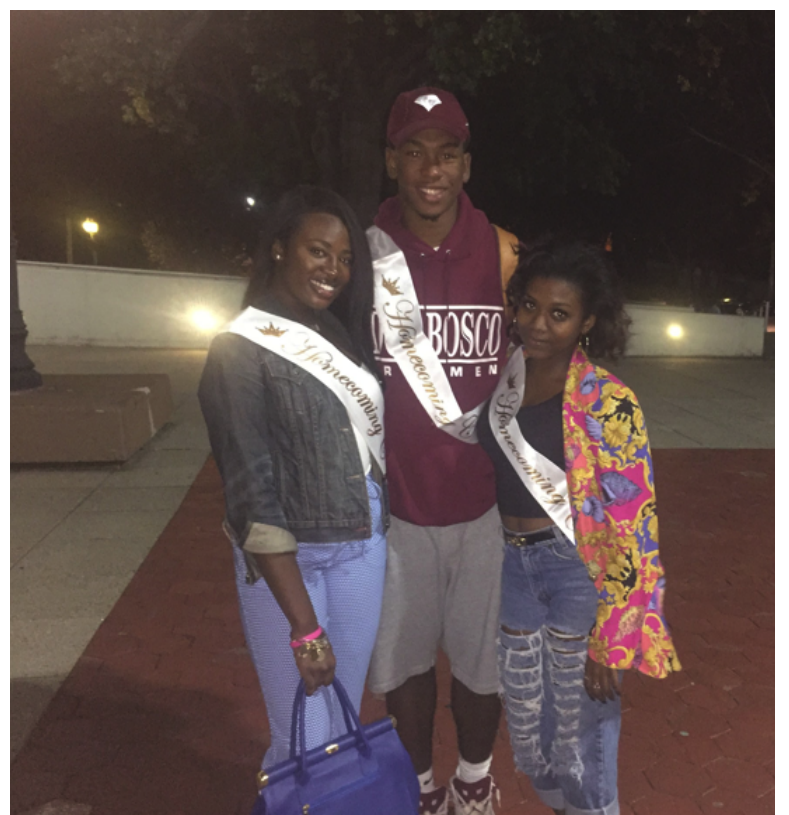
The 2016 Homecoming Court at Take Back the Night.