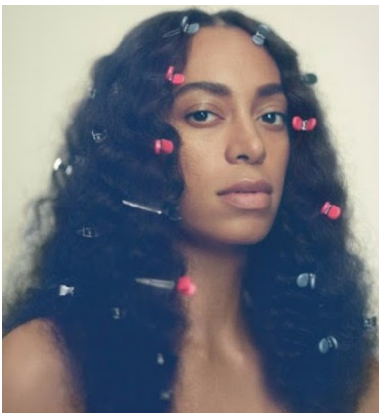
Album cover for Solange Knowles' "A seat at the Table"

Throughout the rest of the record, the unapologetic singer continues to give us complete honesty. In her song "Mad", she states: "I ran into this girl, I said I'm tired of explaining/man, this s***t is draining/and I'm not really allowed to be mad". These words prick us with the thorns of letting oneself be aware of the violent oppression their people have faced in the past, and still face today. Solange also grants us with the pro black anthem "F.U.B.U.", which