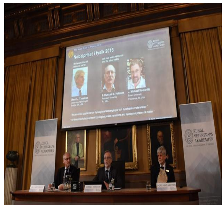
Three Nobel Peace Prize winners sit beside each other at ceremony.

Not one of these brilliant minds were born in the United States, but chose to adopt the American identity by choice, bringing their vast energy, innovative minds, and talents to the nation.