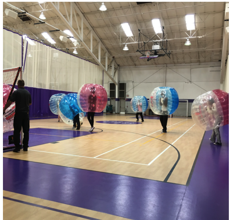
Students enjoying the madness of Bubble Soccer

Bubble soccer was a fun event to get students into the homecoming mood. It was at Wheeler Recreation Center on October 14. Plenty of people came out to play some soccer. However majority of those played found it more fun and enjoyable to just bump into each other. It was also funny to watch. It was an event held by the Student Programming Board also known as SPB. This was an event that provided a ton of laughter and memories to go with it. It was quite a sight to see. This was one of the many festivities that SPB held during the week such as a Pop Up Photo Booth, Dining Dollars Bingo, Meet the Candidates Mixer, Homecoming Banner and Live Band Karaoke. Overall it was a great event for people to come out to along with it being a different kind of that students were not used to seeing.