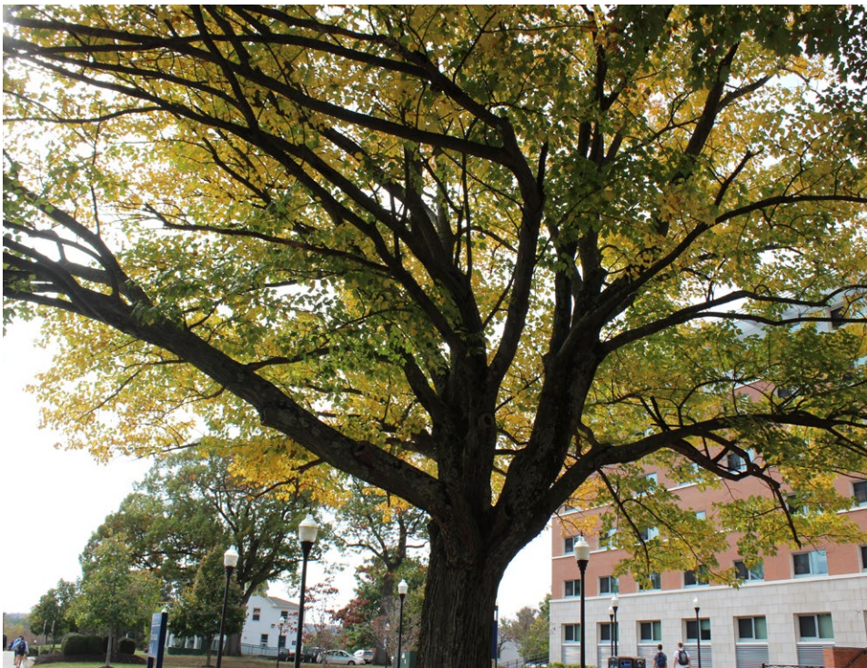
Tree changing color outside of Farnham dormitory Oct. 20.