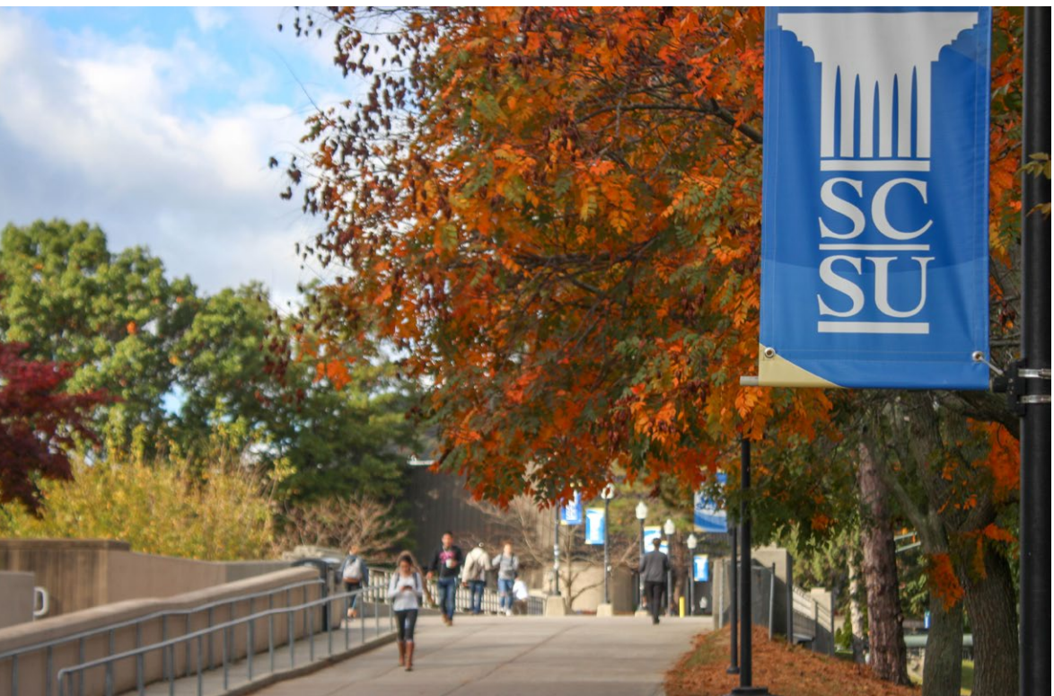
A look at the foliage over the campus foot bridge Oct. 23.