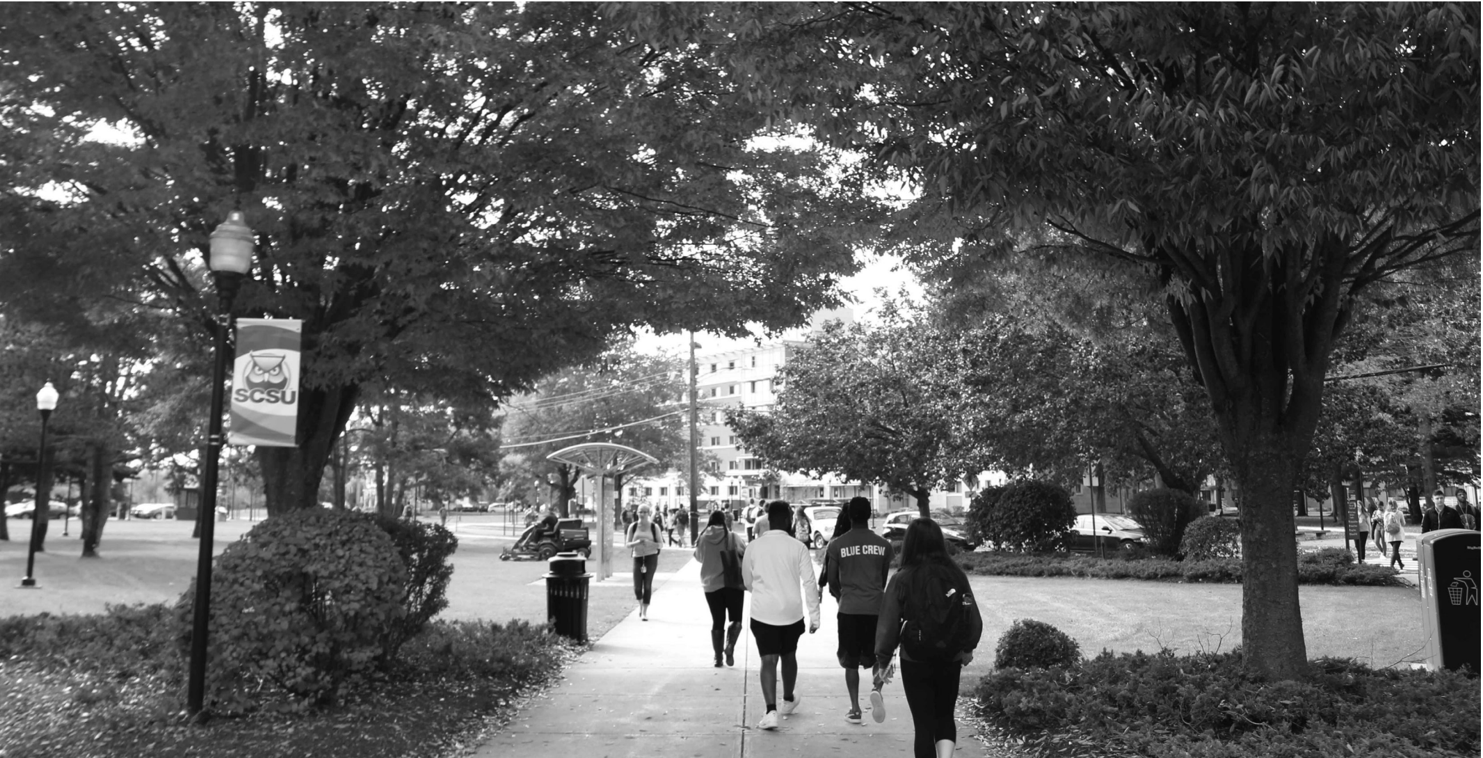
Photo of students walking through campus wearing mixed articles of clothing.