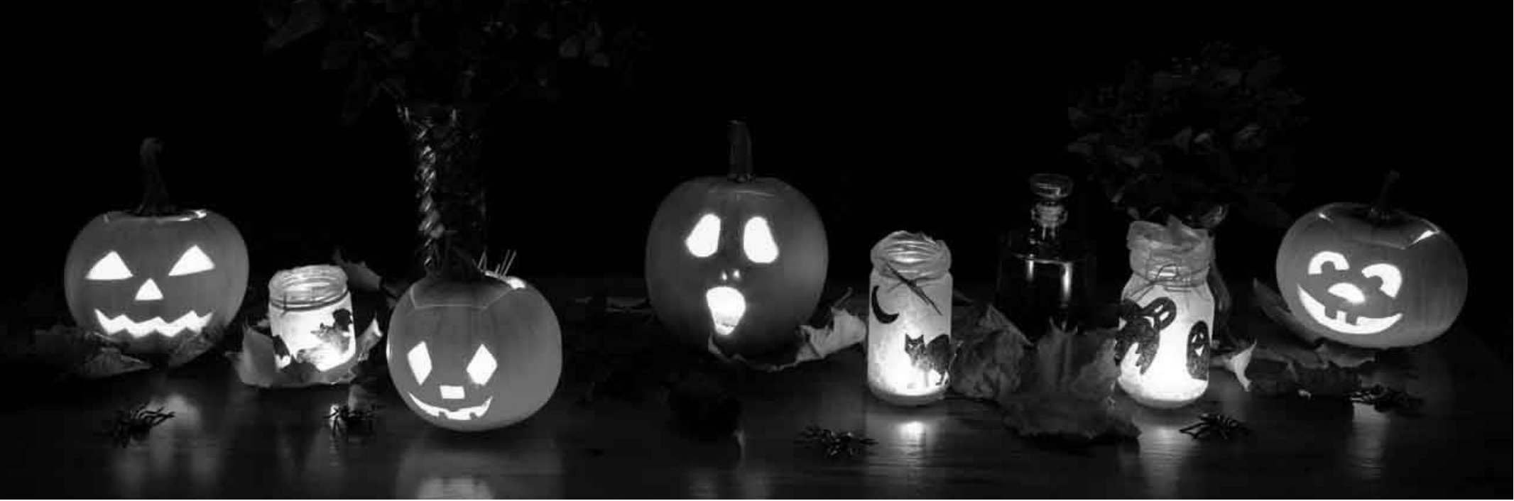
Creative Commons photo of carved pumpkins that serve as halloween decorations.