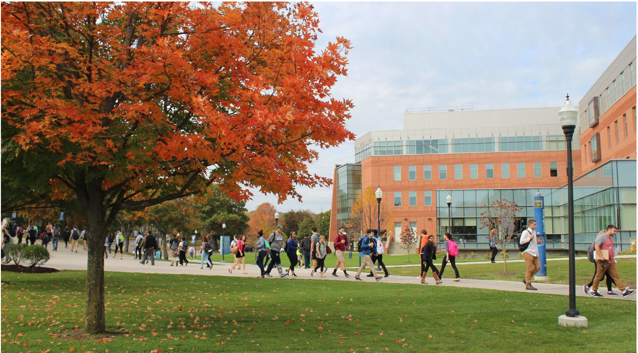
Students walking to and from class through the center of campus Oct. 20.