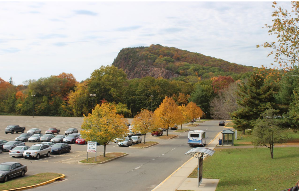
A view of West Rock looking over SCSU commuter parking lot A Oct. 20.