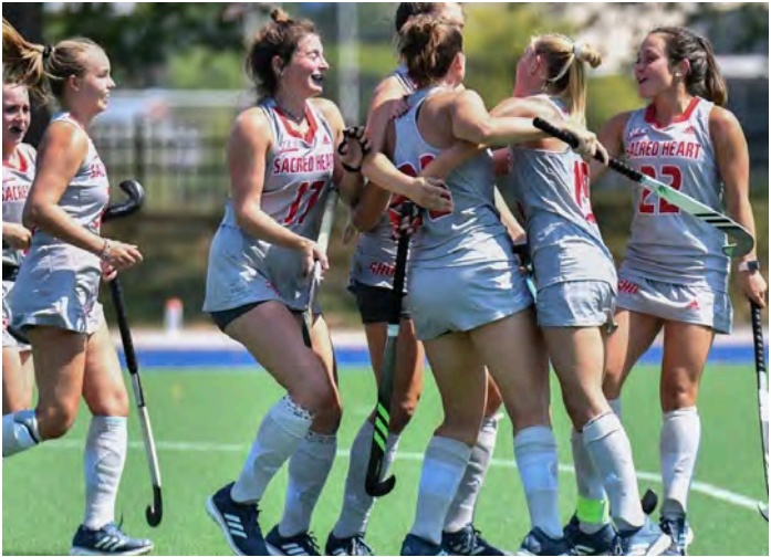
The Pioneers have rebounded after a rough start to the season, defeating Colgate University and Stonehill University in back to back match-ups.

The Sacred Heart University (SHU) field hockey team defeated Colgate University on Sunday, Oct. 16 by a score of 4-3. The win marked the first of the year for the Pioneers, who have struggled greatly throughout the 2022 season, falling short in each of their first 13 games. The much-needed victory placed them into the win column for the first time all season, a huge morale-boost for the program.