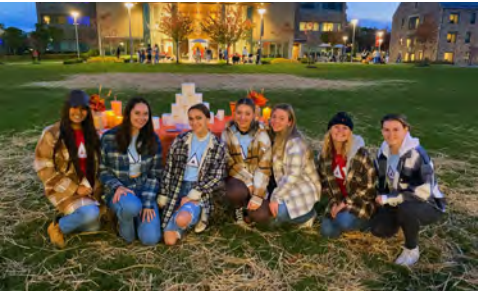
Members of Alpha Delta Pi pose in front of the mummy wrapping game at their philanthropy event.