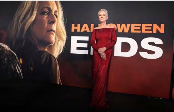
Jamie Lee Curtis pictured at the premiere of “Halloween Ends.”