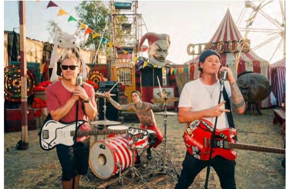
Instagram, @blink182 Blink-182’s came out with a music video for their new song “Edging.”