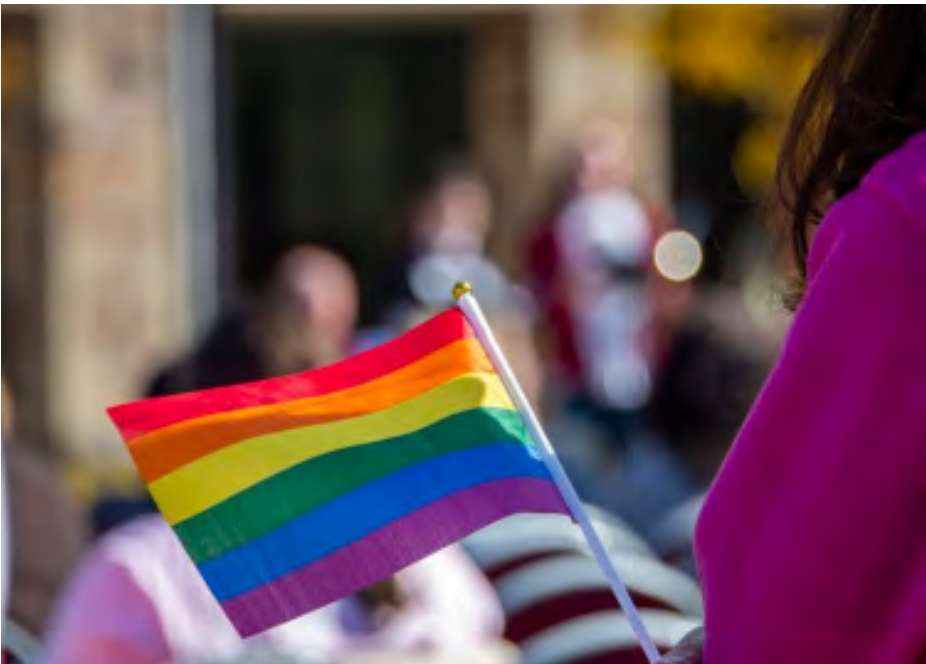
Pride flags were swaying in the wind during the Coming Out Day ceremony on the Upper Quad.