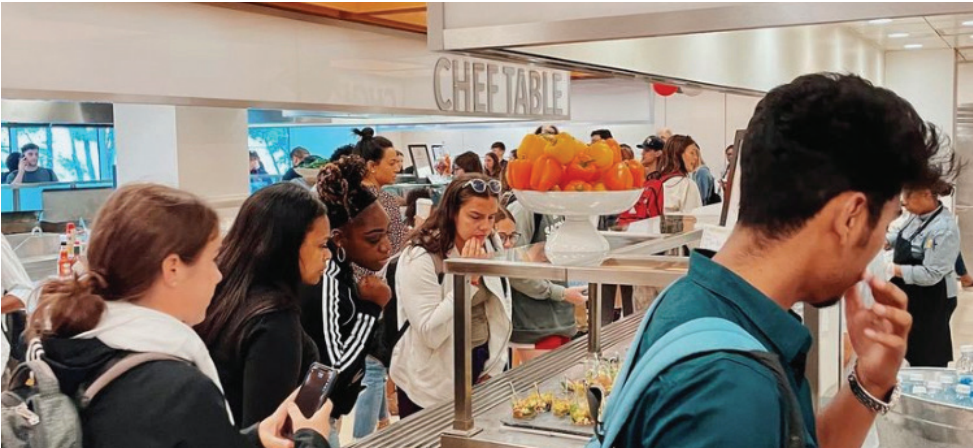
SHU student's visit West Campus to try out the new dining hall Pio's Kitchen.

For more information about dining hall hours or menus visit dineoncampus.com/SHU