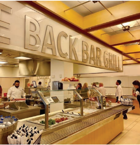
Pio's Kitchen offers convenience and a variety of choices to students on West Campus.