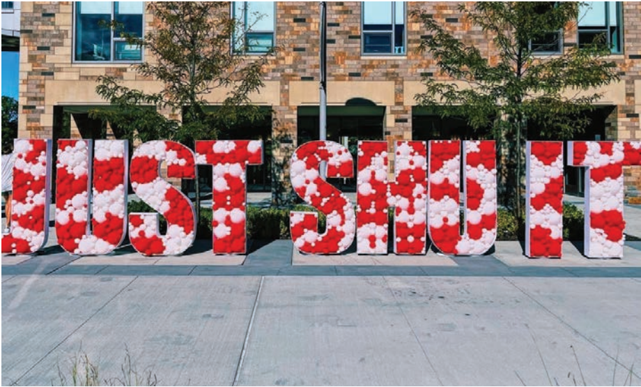
The Just SHU It fair provides students with an opportunity to join a diverse group of clubs and organizations on campus.

For those in the SHU community who were unable to attend the fair but are still interested in getting involved on campus, visit SHU Engage at shuengage.sacredheart.edu .