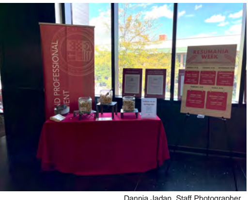
A Reseumania Week promotional table serving

"It is imperative that our students not only perfect their resume to reflect their accomplishments, strengths and past contributions, but also take the time to tailor the resume each time