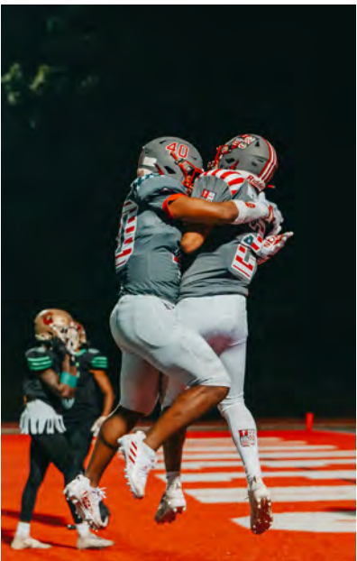
SHU Club football team celebrating together after scoring a crucial touchdown.