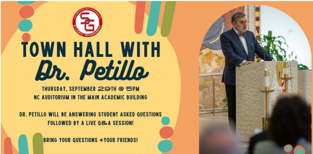
Sacred Heart University