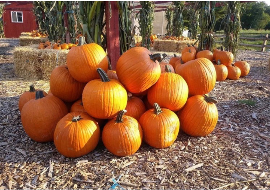
Pumpkins stacked in Silverman’s Farm pumpkin patch.

Harvest Week is Oct. 17-21 with most activities taking place on 63’s lawn, while Fall Fest will take place Oct. 22 from 1 p.m. to 5 p.m. also on 63’s lawn.