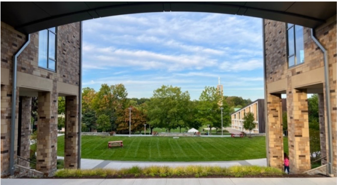
A fall scene captured under the bridge between Weisel and Frassati Halls.

Despite the changes in temperature, many students said they enjoy the fall foliage, especially on campus. However, the scenery isn’t the only thing students are excited