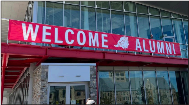
A Welcome banner hangs from the Bobby Valentine’s Health & Recreation Center.