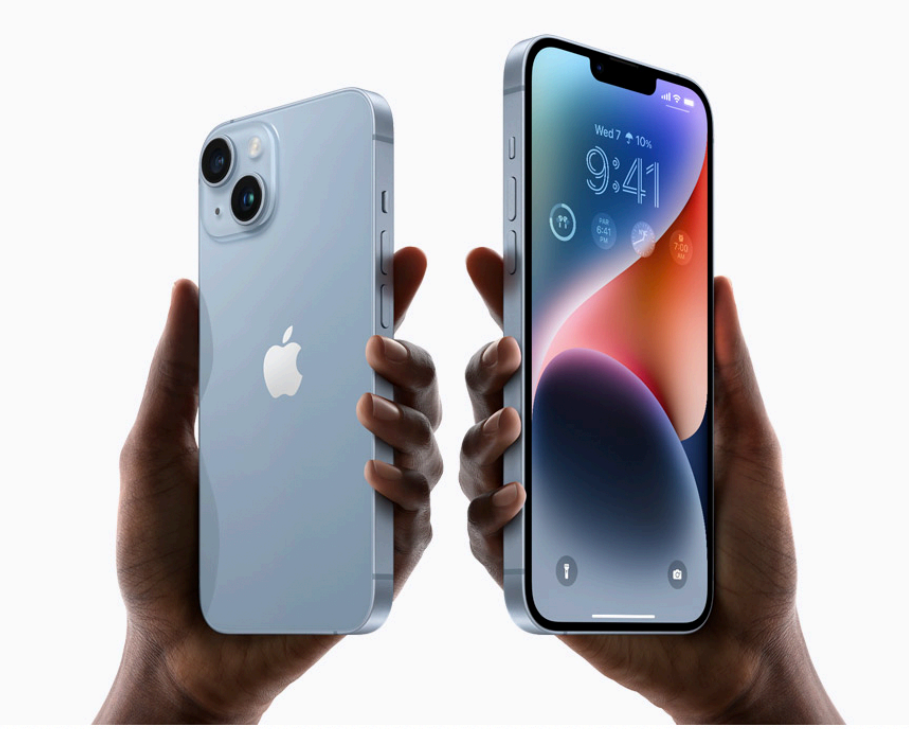
The iPhone has completely new features on the lockscreen.