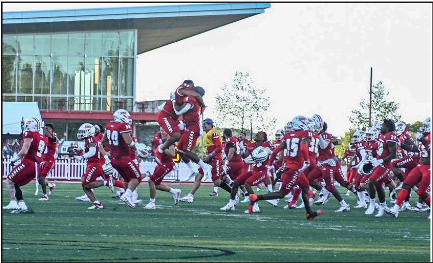
SHU football players celebrate after 38-31 OT win vs. Dartmouth College.