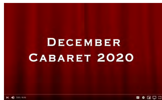
Recent Cabaret on Google Classroom

Most people who are a part of this newer experience have expressed that they are more interested in submitting a video than doing their first cabaret in person. It has helped students with stage fright feel