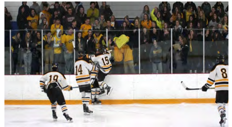
Student section at an Amity hockey game

Raver said, "The student section is much ap-