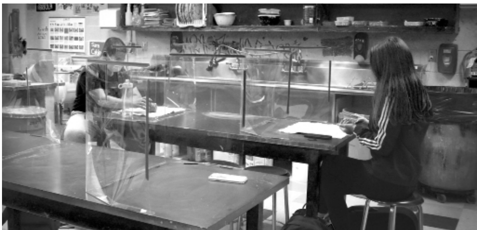
Students work in ceramics class during hybrid learning.

However, Florkiewicz remarked that having everyone in one place allows every student to "get the same treatment."