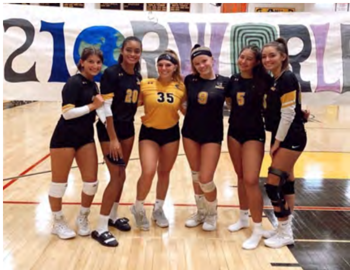
Amity Girls Volleyball Team Celebrates Win

to rest and mentally prepare for the games ahead. That extra time paid off as the SCCs continued and the team's success only grew.