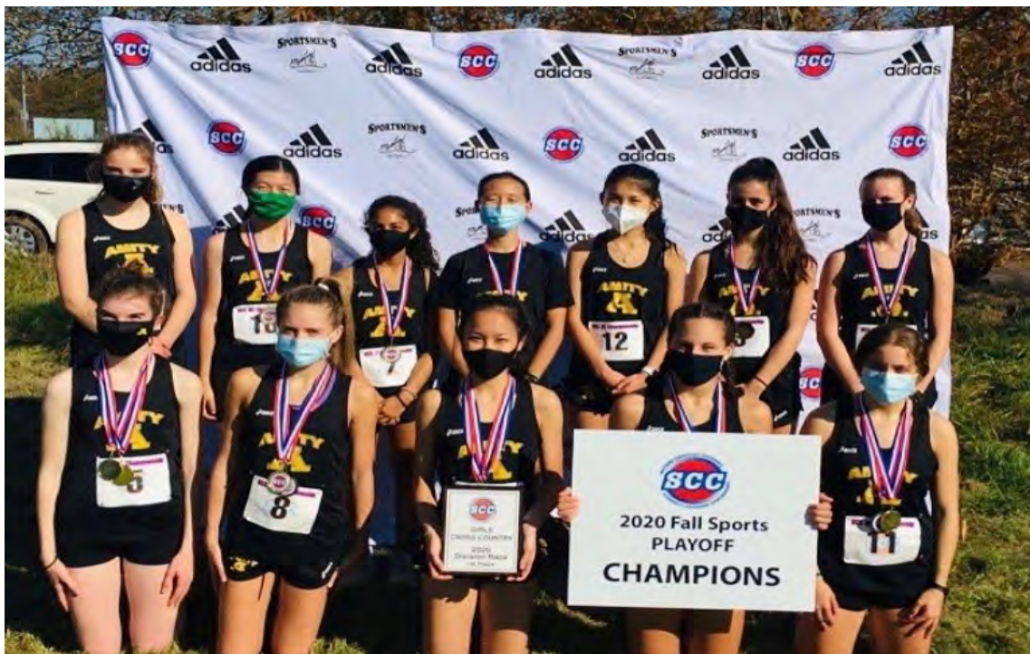
Girls Cross Country Team Celebrates the Win