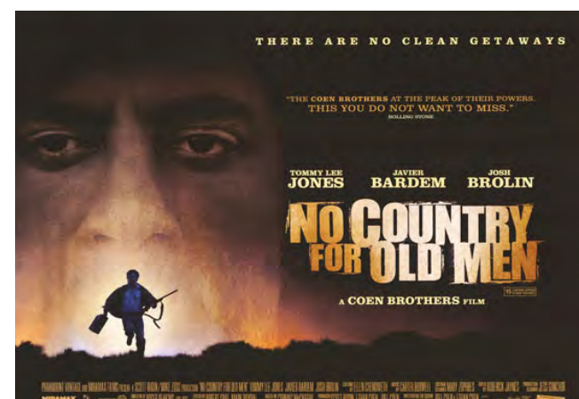
Poster of No Country for Old Men

The transition from stage to screen is targeted to be seamless, but the outcome should hopefully be dazzling. This is truly a feat in such a trying time for the arts.