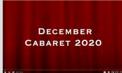
Cabaret Arts, 6