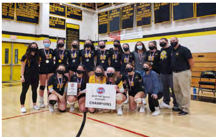
Team members are crowned SCC Champions

In their semifinal bout, the Amity girls faced off against Foran High