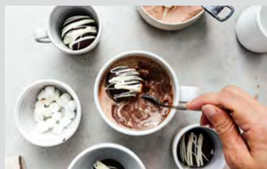
Holiday Desserts Features, 4