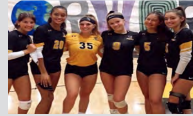
Volleyball Sports, 7