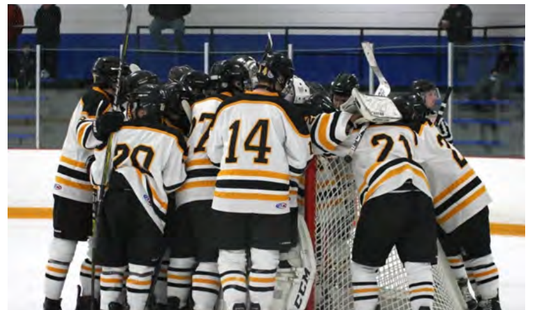
Boys Hockey During a Pre-COVID Season

The hockey team is fully prepared to take on this season no matter what complications are present. Players are keeping their goals clear and are willing to take precautions necessary to achieve them.