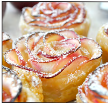
Photo from Pepperidge Farm Cinnamon Apple Roses

First, let puff pastry dough (if frozen) thaw out for 30 minutes. While thawing, wash, core and cut the apples in half. Once in halves, cut apples into extremely thin, paper-like slices. Immediately after sliced, submerge them in a bowl with a mixture of water and 2 tablespoons of lemon juice. The acidity of the lemon juice will help the apples from browning.