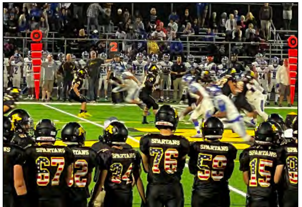
Amity football challenges Bunnell.