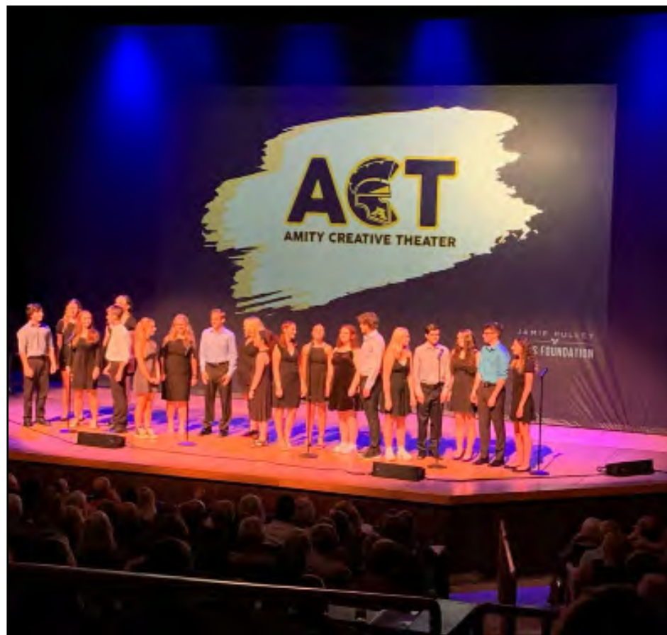
Jamie Hulley Arts Foundation Evening for the Arts

The gala event, in cooperation with ACT, brought together talented individuals for a charitable and heartwarming cause. The Amity Arts department is continuously grateful for the support that the Jamie Hulley Foundation shows towards the phenomenal productions and adept students.