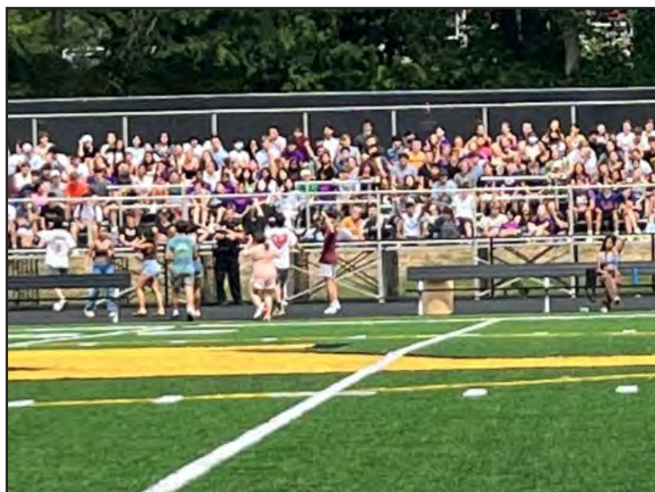
Students cheer during the pep rally.