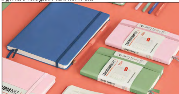
Examples of planners to help you organize

that you spread apart the time for the long term work so that you do not need to rush at the last minute. Organizing your time will make the work less stressful, it will give you more time for sleep, and it will make the workload seem more manageable.