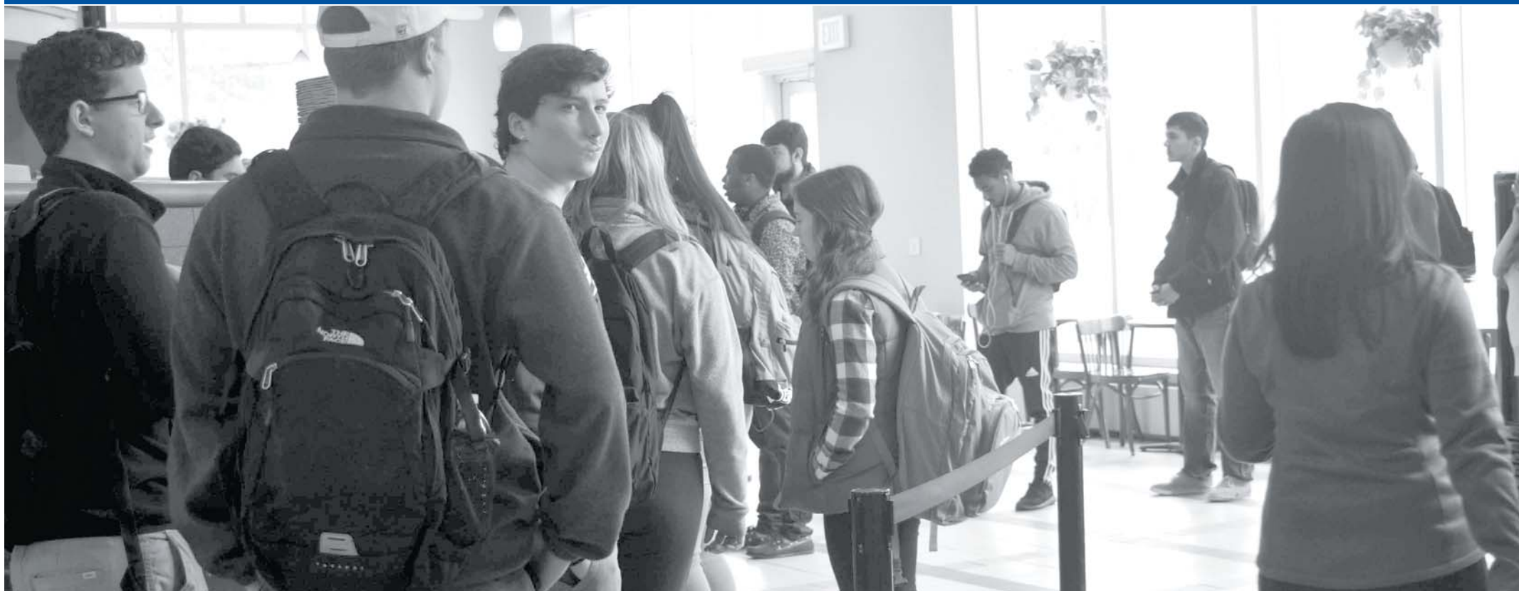
The line at Dunkin Donuts in the Adanti Student Center.