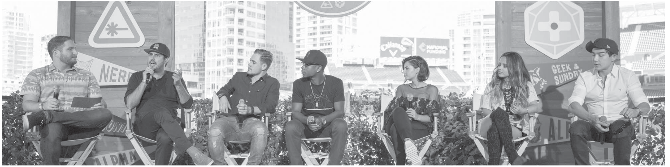
Photo of the cast of the new 2017 'Power Rangers' movies at the San Diego Comic-Con in 2016.