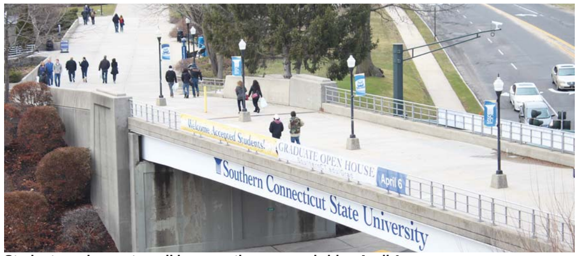
Students and parents walking over the campus bridge April 1.