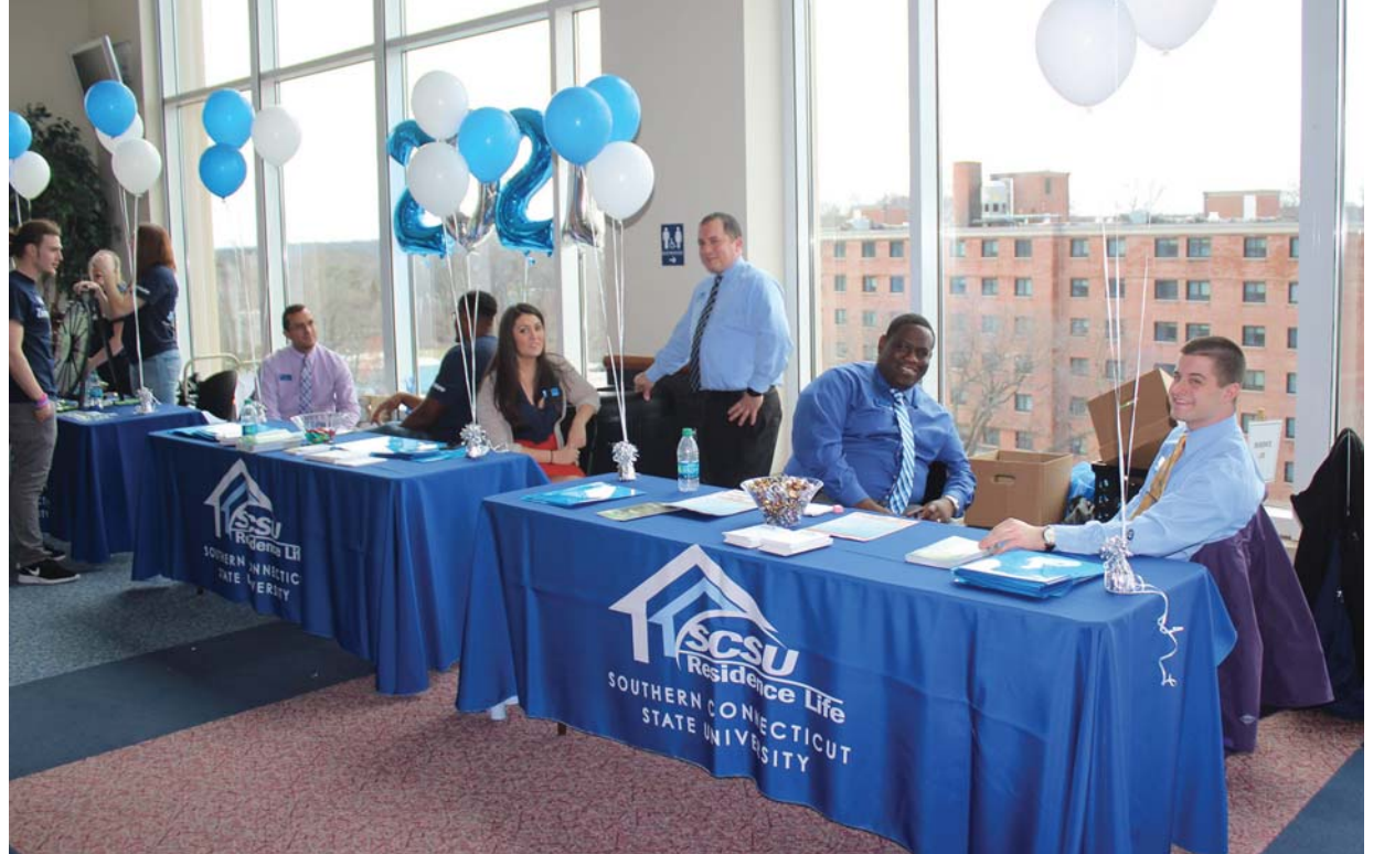
Residence Life booth set up on the third floor of the Student Center.