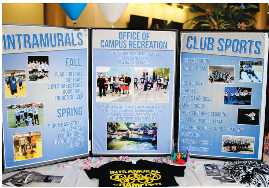
Poster on display showing various recreational activities students can be apart of on campus.