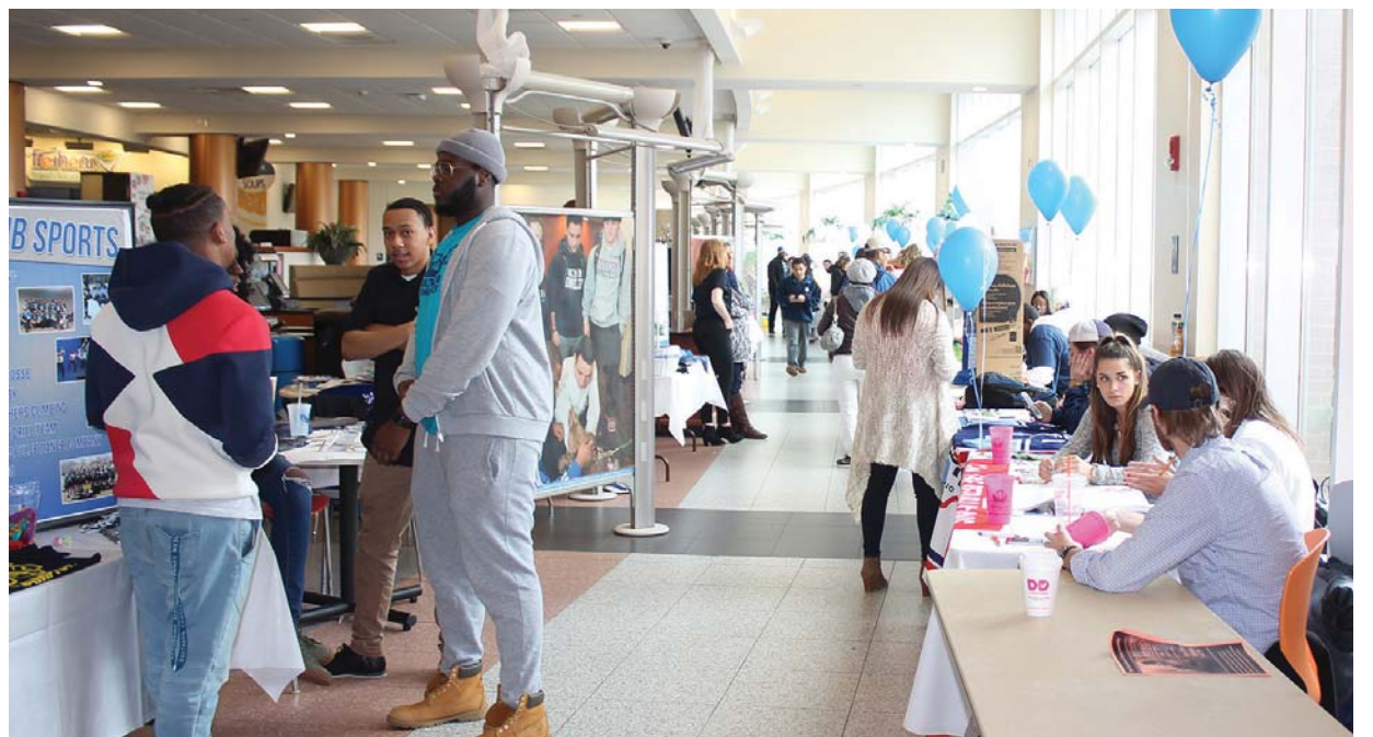
Clubs and organizations set up booths to introduce students to what extracurriculars there are on campus.