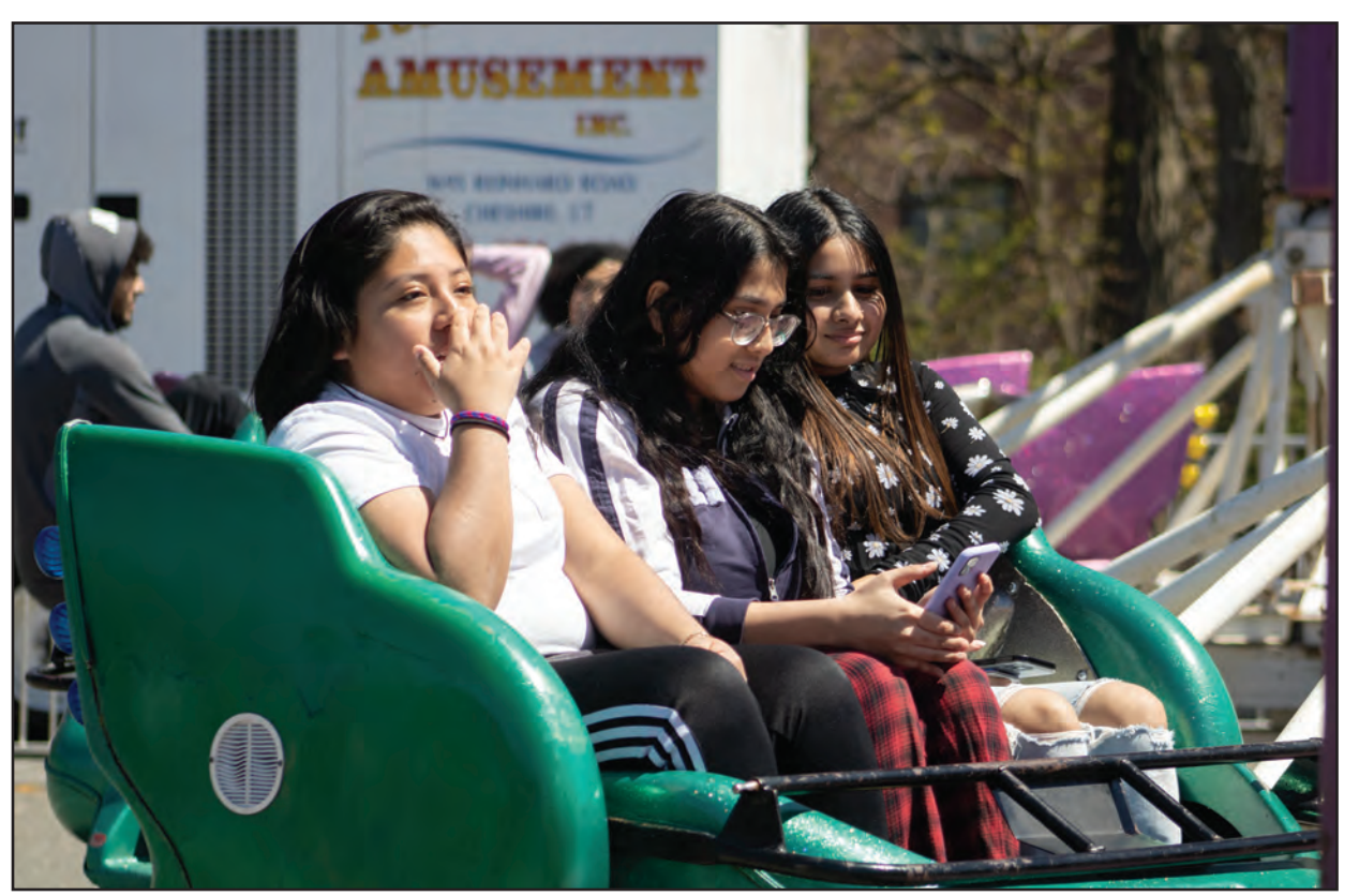
Group of friends waiting for carnival ride to start.

For more about the carnival go to page 3.