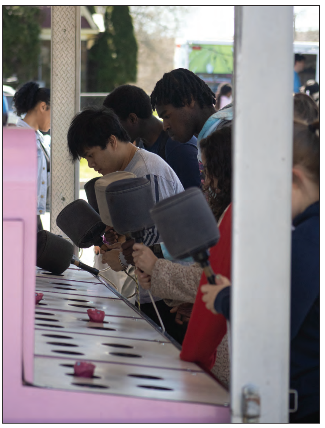
Students playing whack-a-mole to win prize.