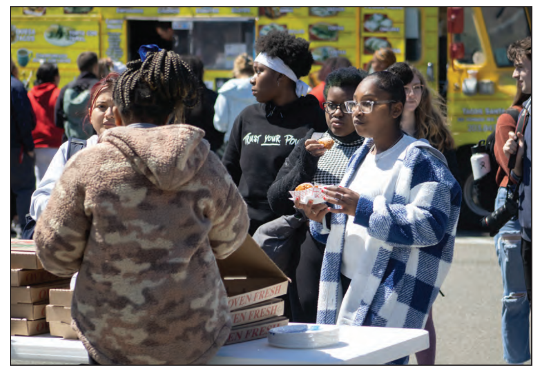
Students at work on warm day on the Buley patio.