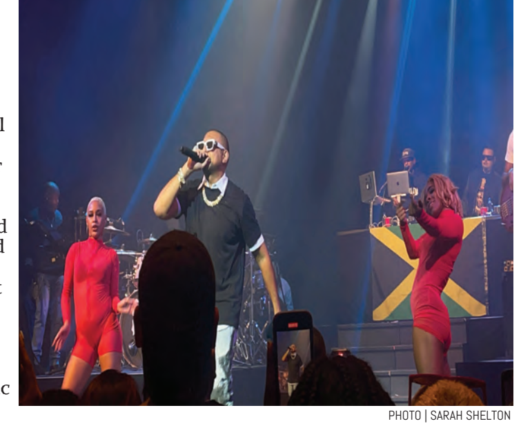
Sean Paul performing at College Street Music Hall.

"According to the website, tickets are still available,