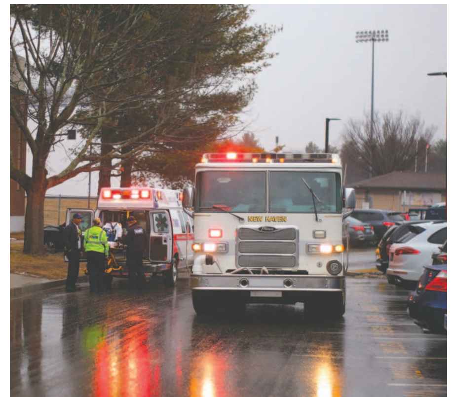
Stretcher being taken out of the ambulance.