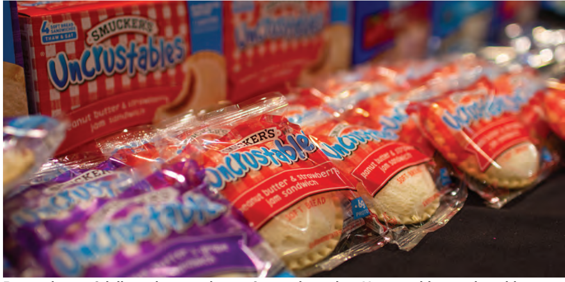
Peanut butter & jelly and peanut butter & strawberry jam Uncrustables on the table.

"PB&J" is held in Englemen every Thursday.