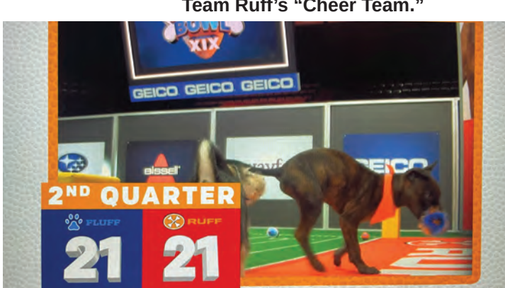
Second Quarter Touchdown made by Team Ruff.