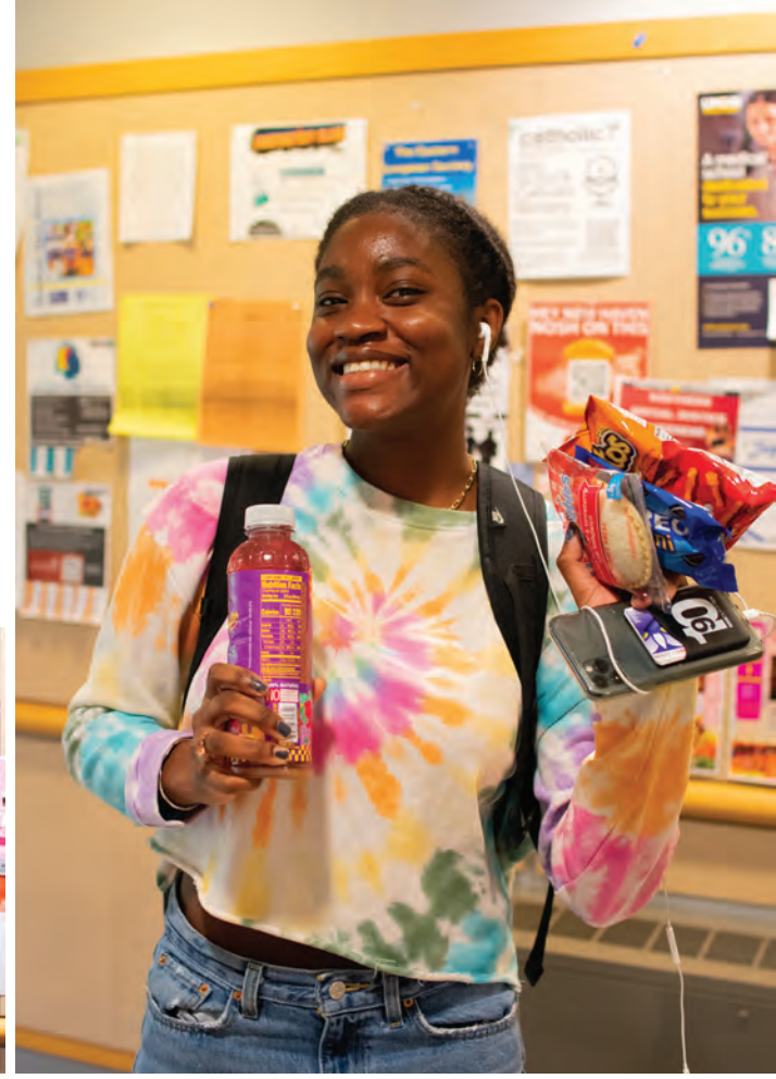
A student after grabbing some snacks and a drink.