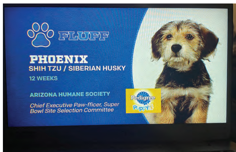
Pheonix's introduction sponsored by Pedigree.

All photos taken on an iPhone of a laptop screen.