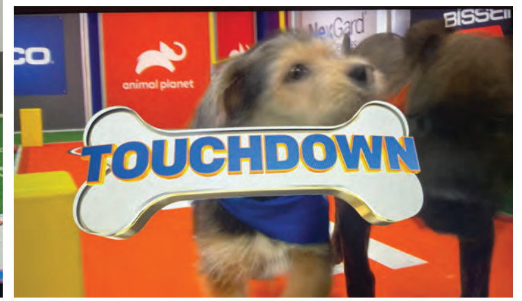
One of the Puppies who made it to the endzone.