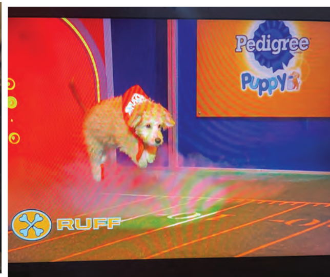
Fluff from Team Ruff jumping into the field.