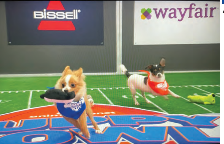
Team Fluff's Pickle running with a toy.