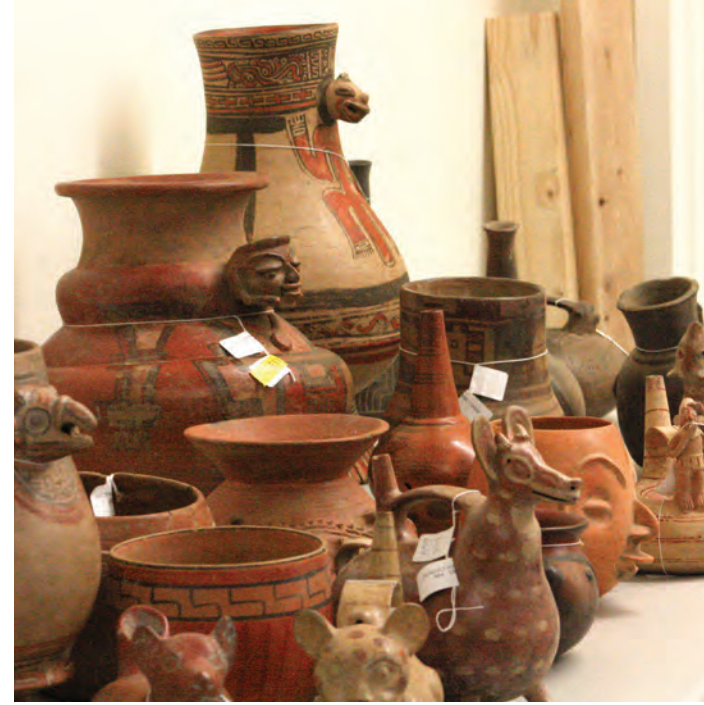
Pottery showcased within the art exhibit.

lege setting to go beyond and explore," said Palma.