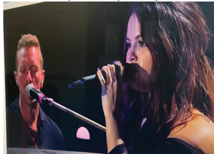
Selena and Coldplay performing months before video.

It was reported by Selena Gomez Charts, @ SGChartUpdate, on twitter that "Let Somebody Go" received 100,000 views on its first 5 minutes of release.