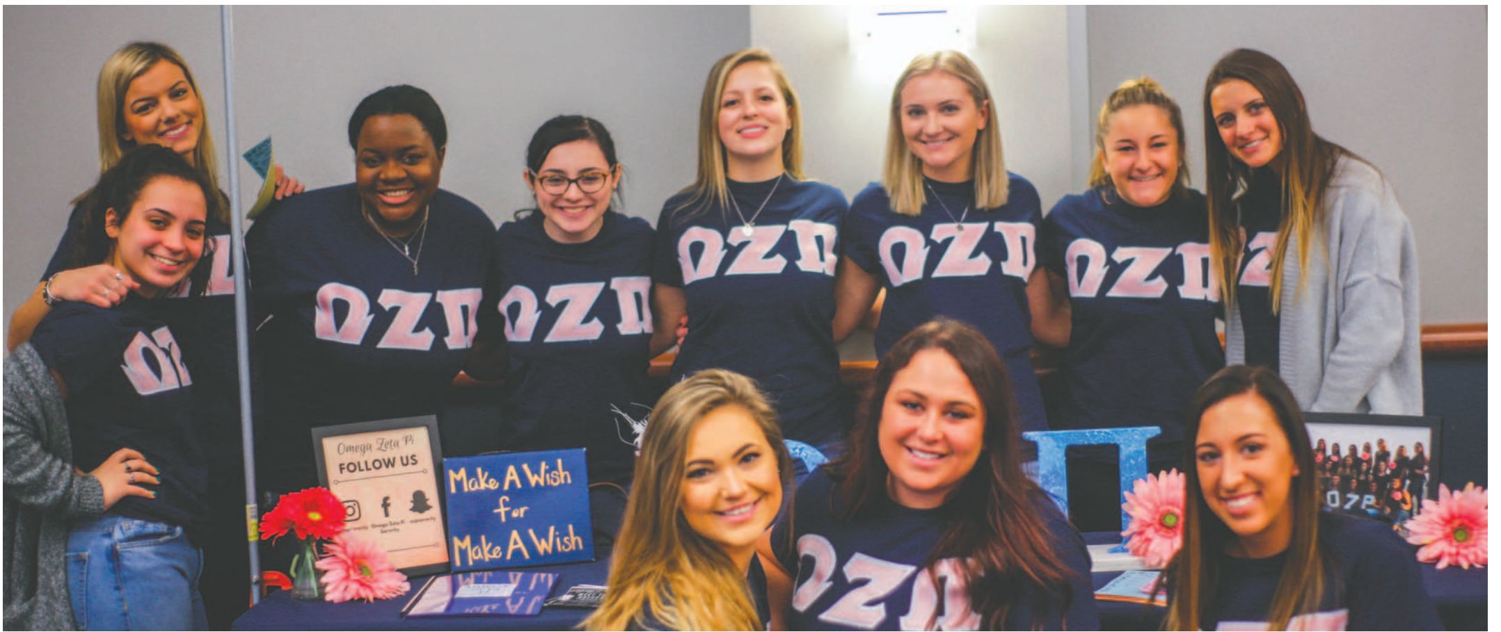
Omega Zeta Pi sorority posing for a photo at their booth.