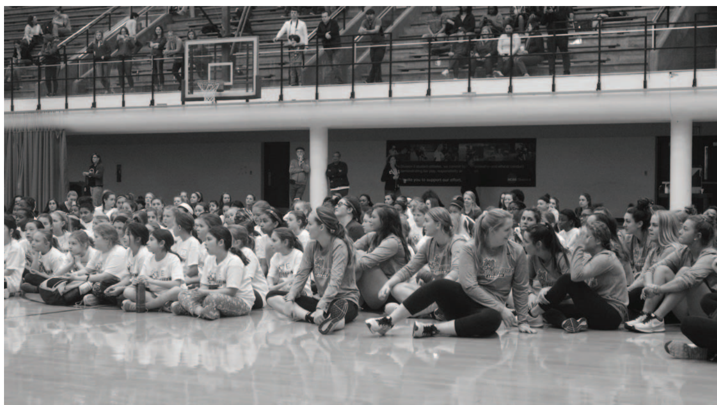
Participants and Southern athletes gathering before start of event.