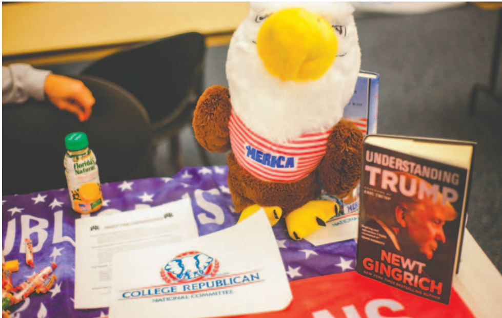
Props set up at the College Republican booth.