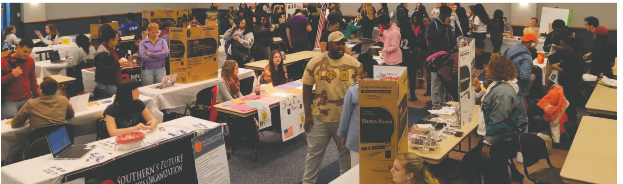
The crowd of students attending the club fair.