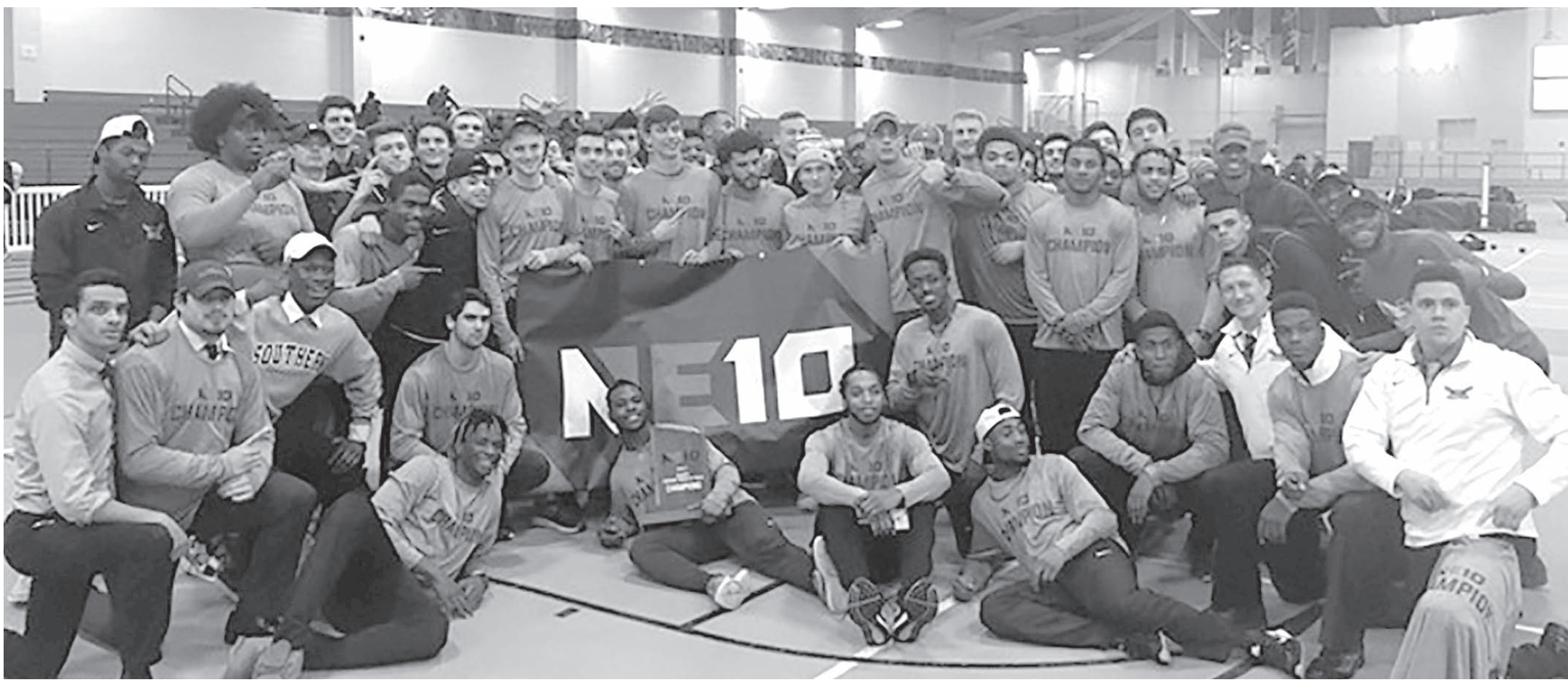
The men's indoor track team posing for a picture after winning their 12th title in school history.