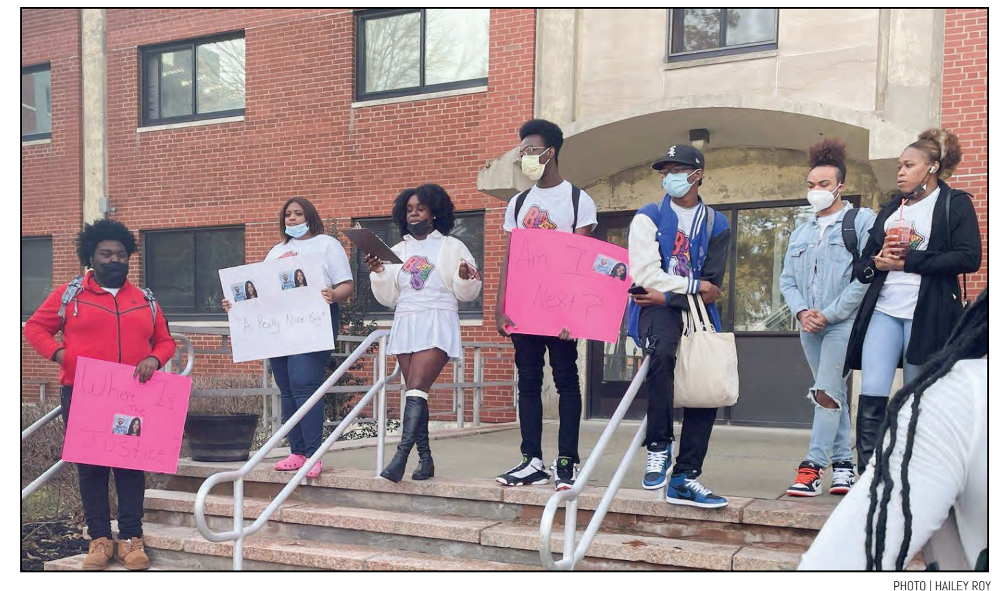
Students holding signs reading "am I next?", "where is justice?" and "a really nice guy."

The walk lasted about 10 minutes and got a lot of positive attention throughout the campus by spectators. Both staff and students attended the event.