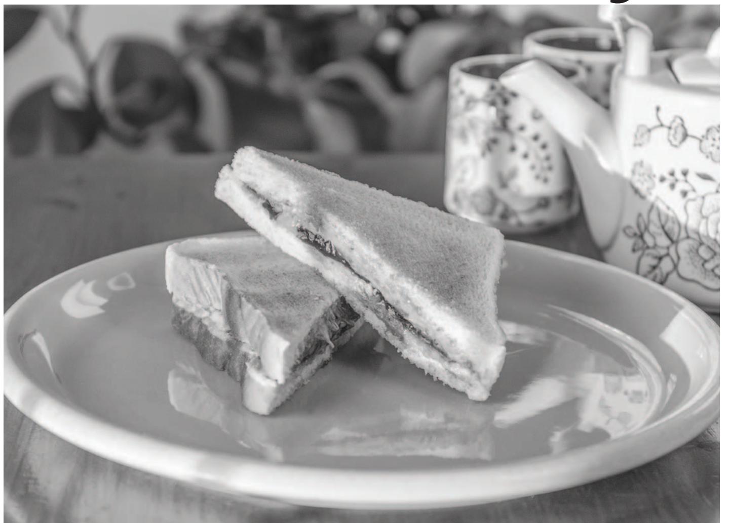
A peanut butter and jelly sandwich.