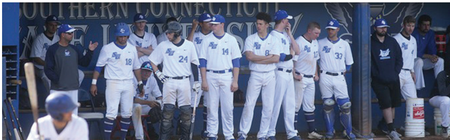
Southern baseball team in the dugout during a home game this season.