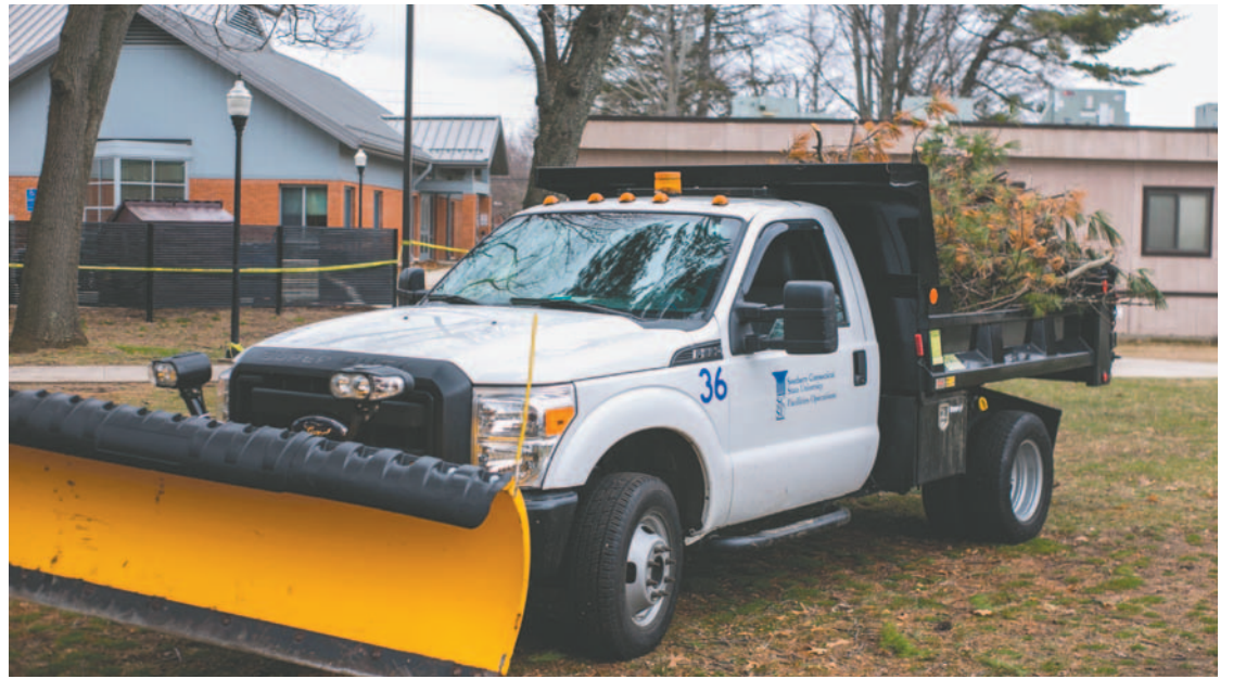
Southern Facilities Operations vehicle loaded up with tree debris Monday morning.