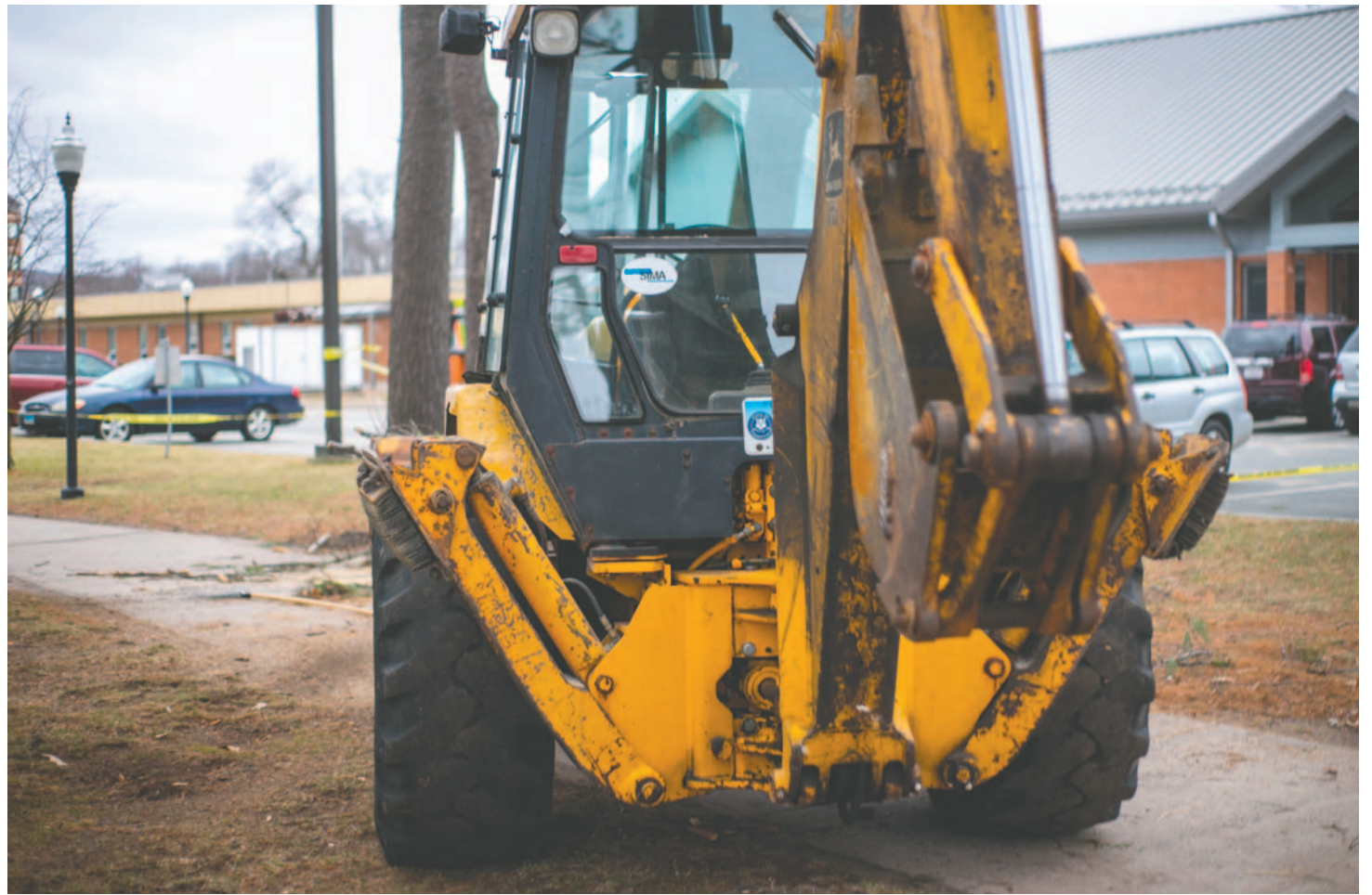
Tractor on the scene of the clean up.