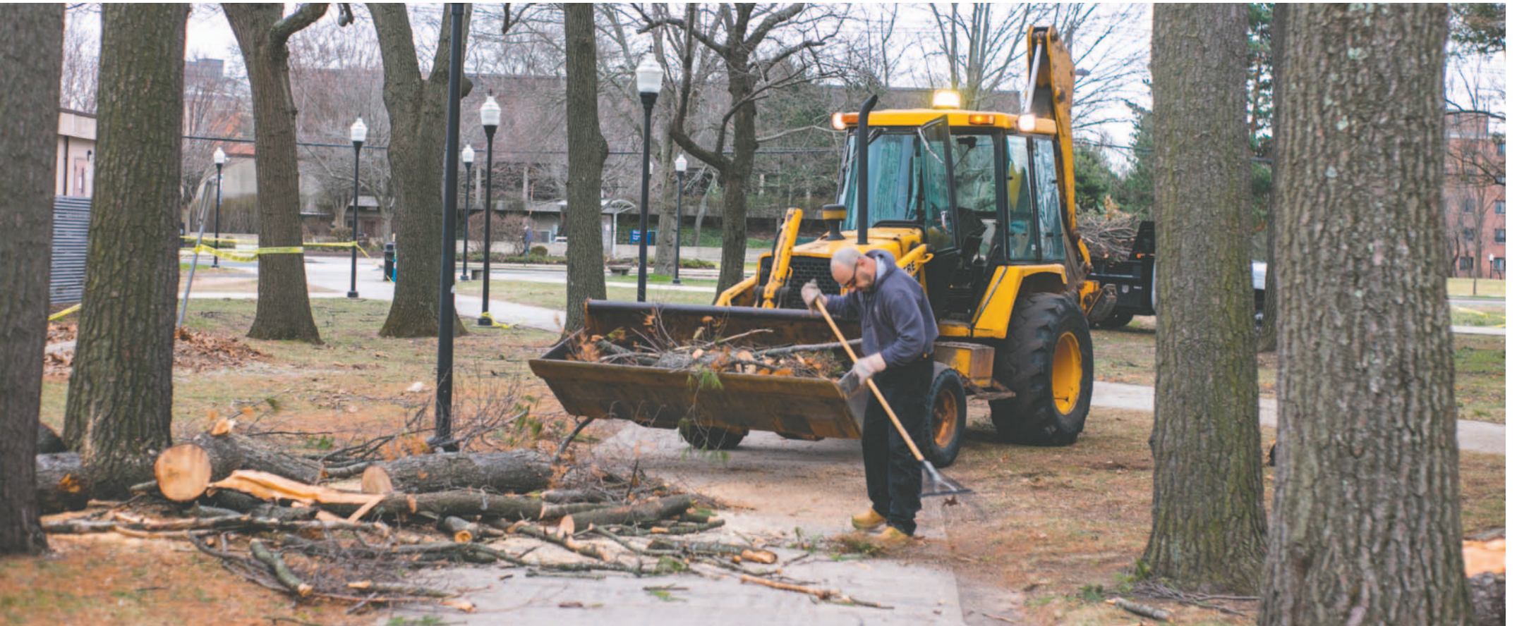
Southern Facilities Operations worker cleaning debris off of the sidewalk.