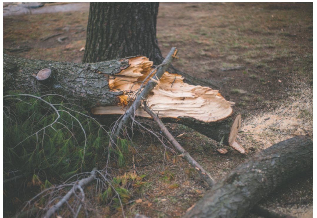
Tree trunk snapped by the wind.