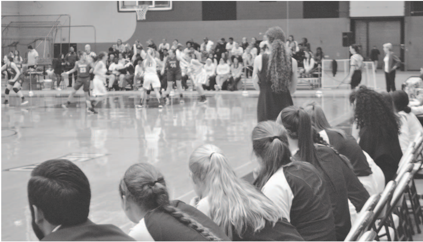
Southern bench watching the action during the semifinal game vs. Bentley.