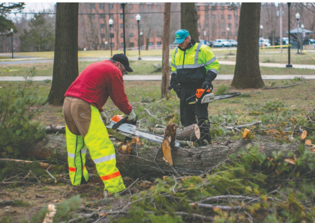
Workers cutting up the fallen tree to transport them away.