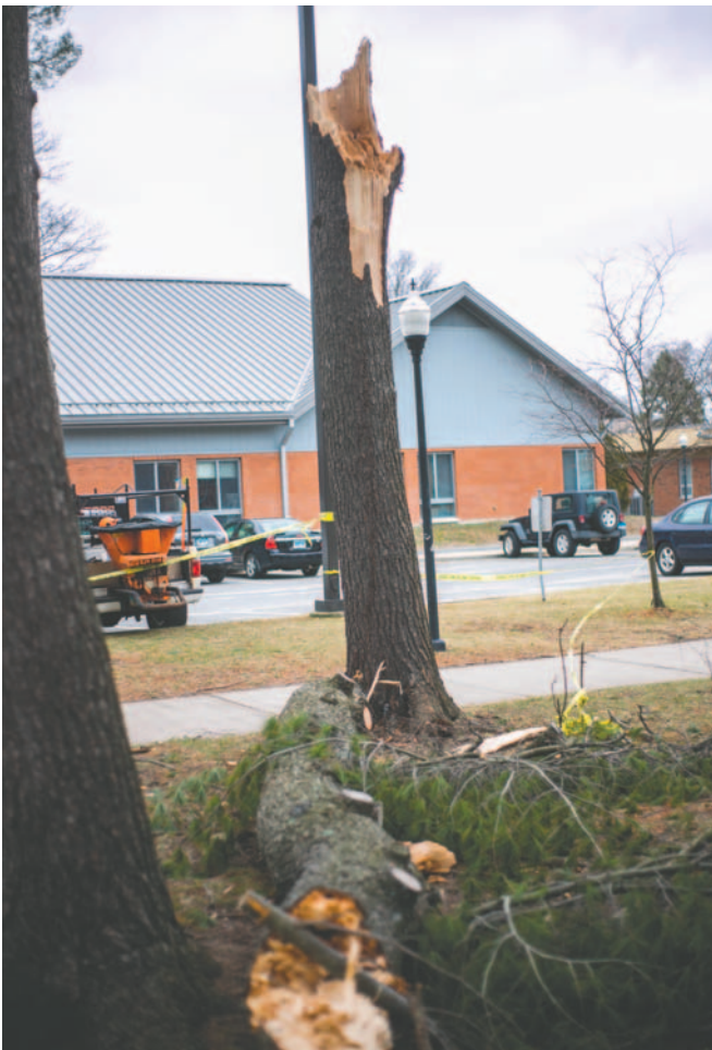
Broken tree in the ResLife quad after Friday's storm.