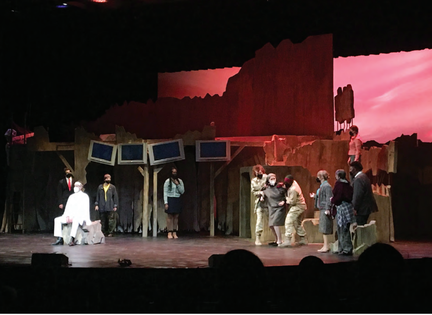
"I'd never seen or heard of Crescent Players performing a scene from the play "Antigone" in the Lyman Center on opening night.

Theatre's next offering on campus will be a student directed and designed festival of one act plays, which will run at the end of April.