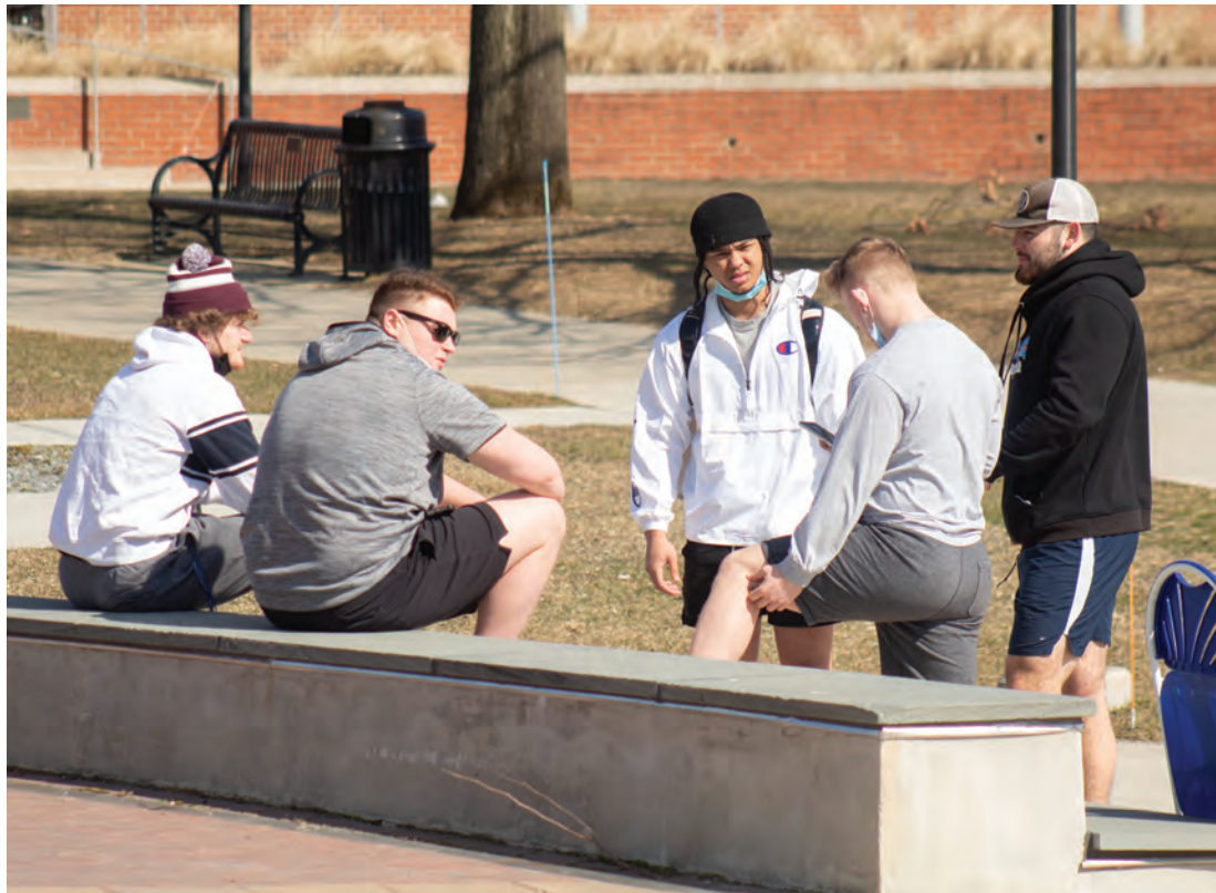
Group of students talking in front of Buley on a Wednesday afternoon.