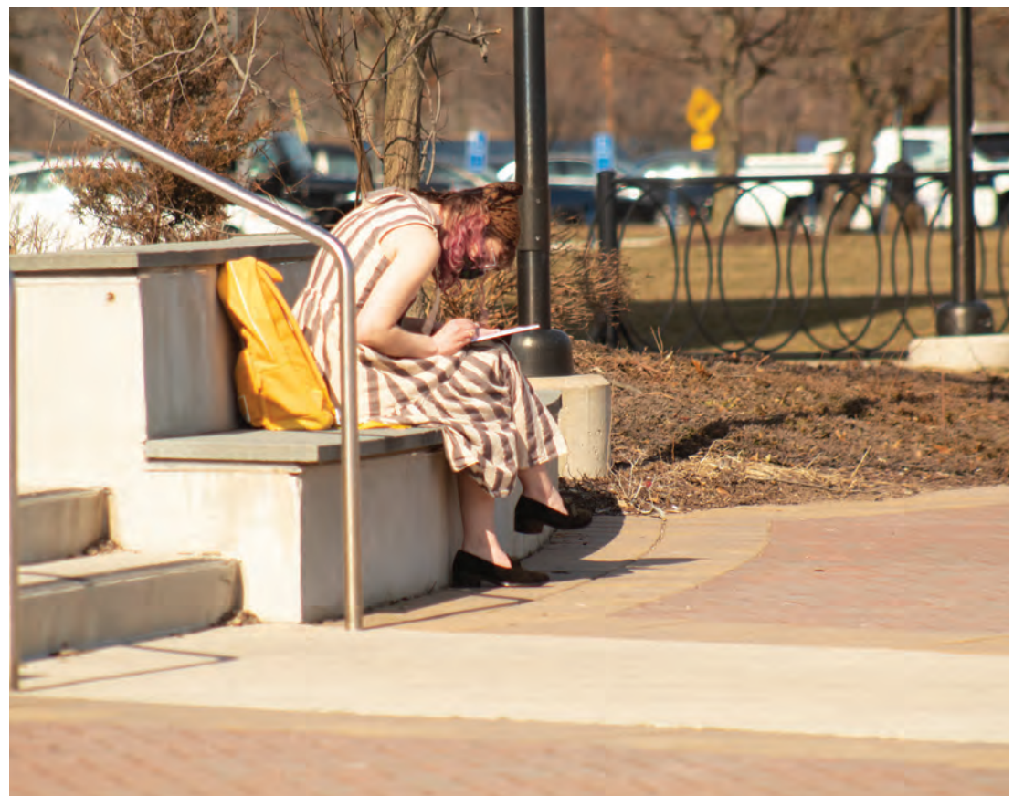
Student writing in front of Buley during a sunny day on campus.