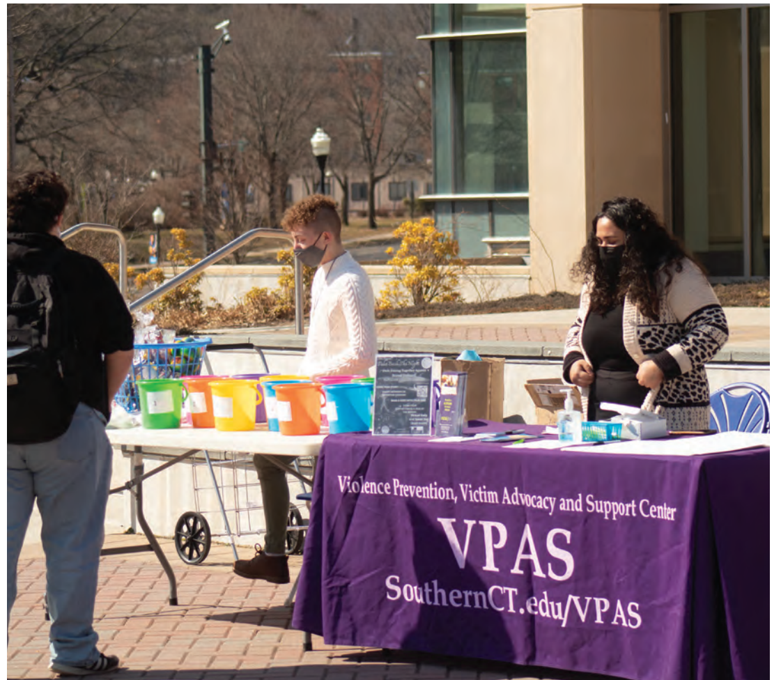
Violence Prevention, Victim Advocacy and Support Center event in front of the Library.

Students used the warm weather to their advantage before more cold weather hit Connecticut.