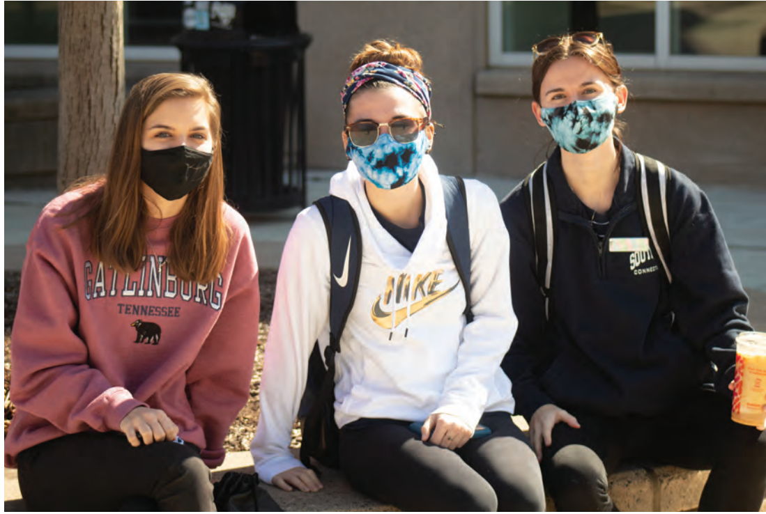
Students conversing in front of The Adanti Student Center.