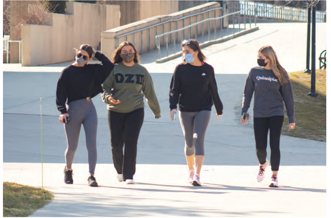
Group of students walking on campus with masks on.