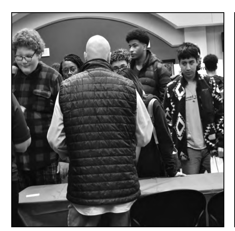
Wednesday and Thursday brought hundreds of students together.