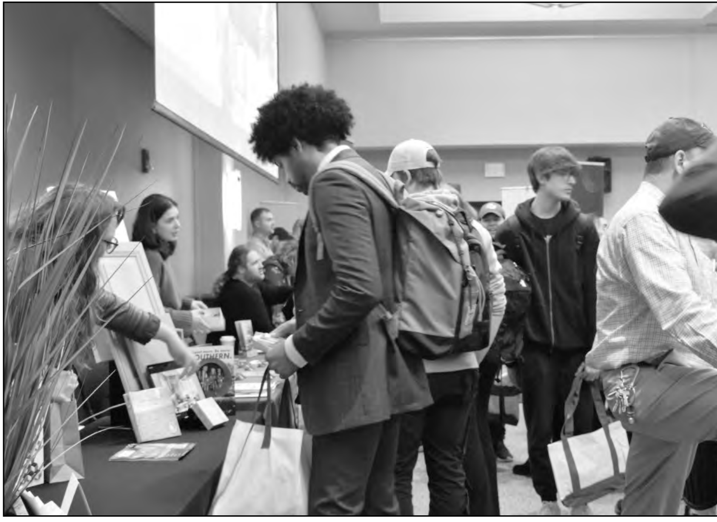
Many students attended and dressed professionally. Some handed out their resumes to the organizations.