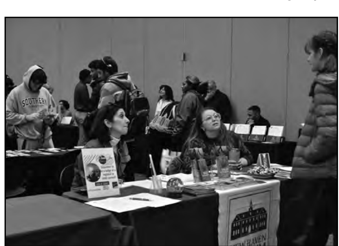
New Haven Museum's internship program had many students interested.