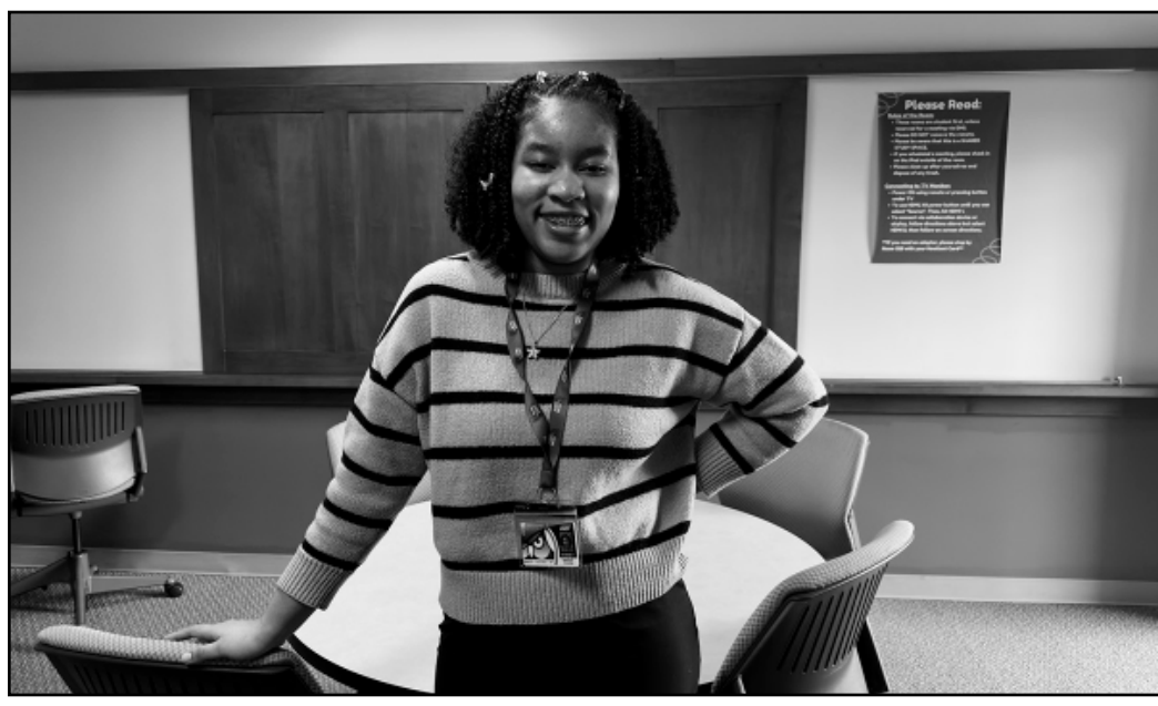
PHULU | SUI È SUUL

Anime Society hosts their meeting every Tuesday at 5 p.m. in ASC Room 309 and Thursdays at 2 p.m. in ASC Room 305.