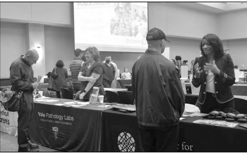
Healthcare and public health career fair goers, learning about Yale Pathology Labs.