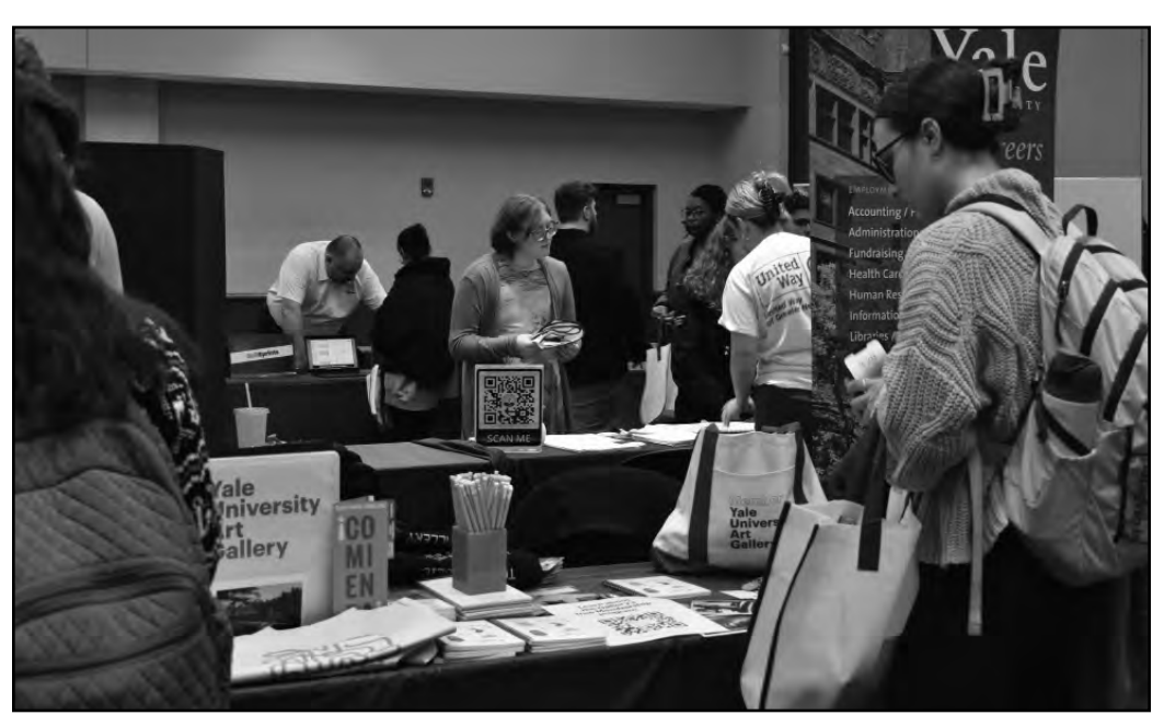
Students looking at what the Yale University Art Gallery has to offer.