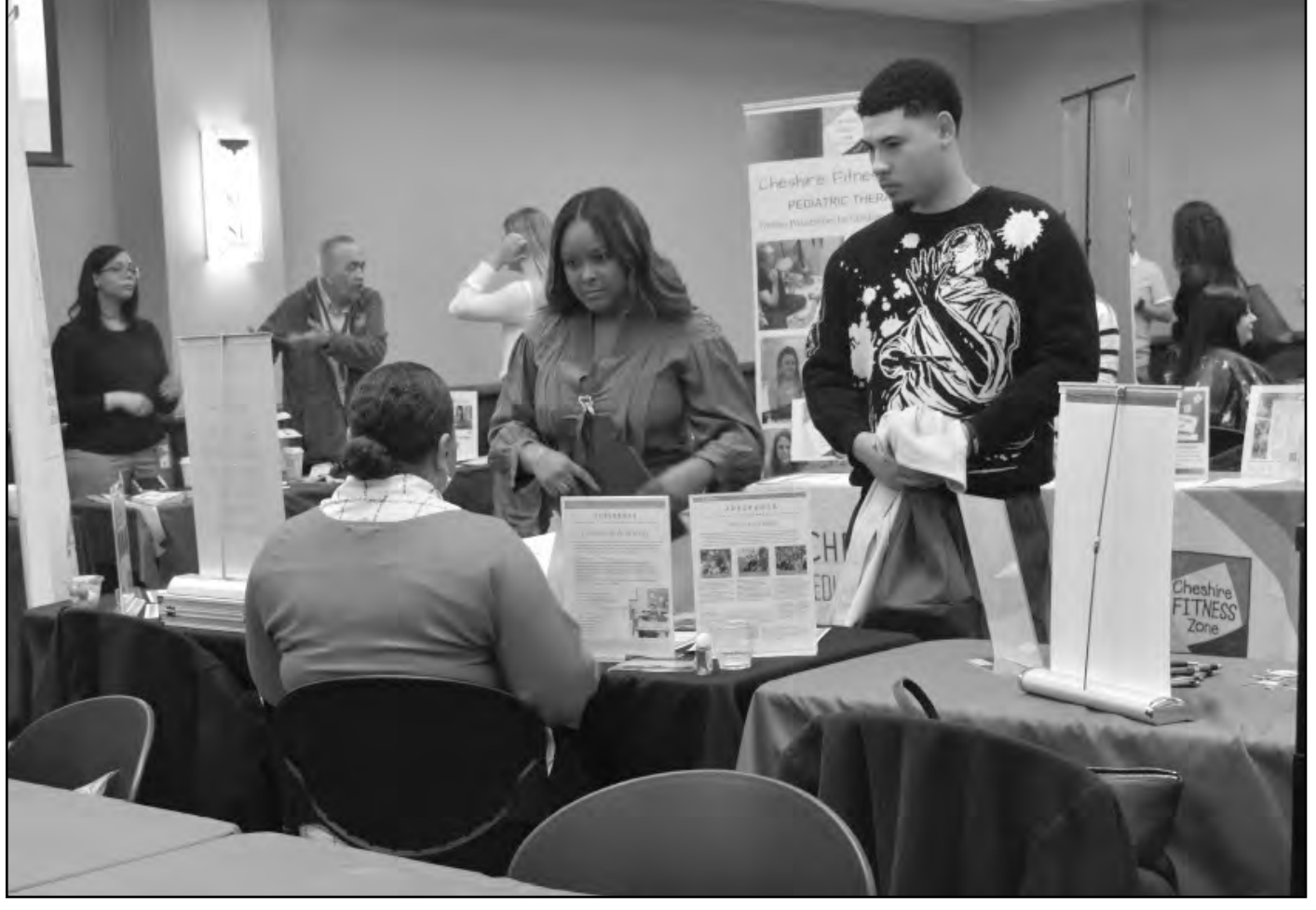
An Adelbrook Behavioral and Developmental Services worker informing students about the facility.