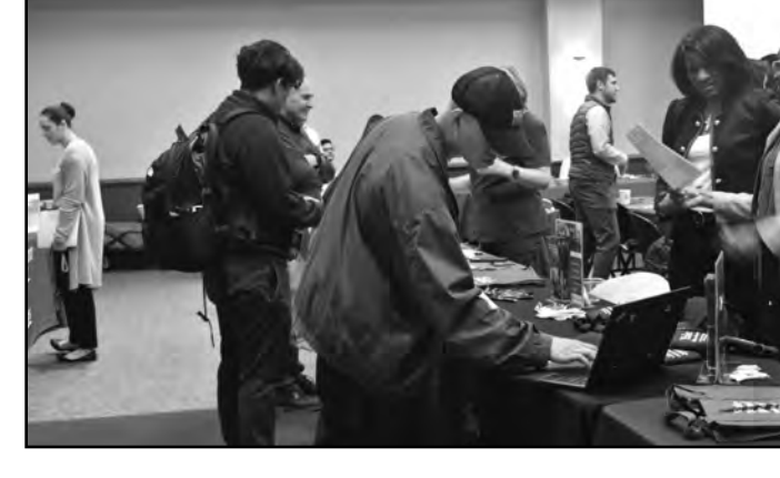
Some booths had websites and interactive sign ups.