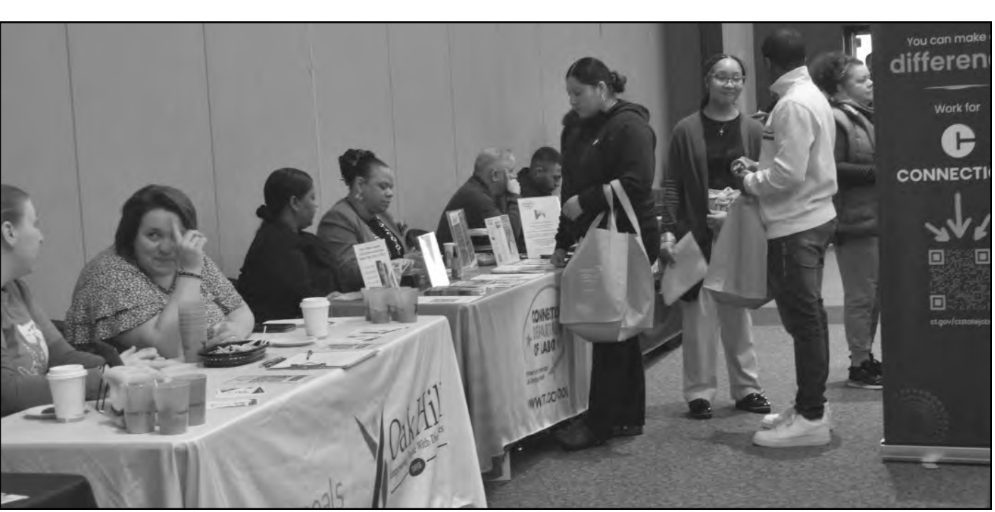
There were over 25 different organizations at each internship fair, offering jobs and advice to students.