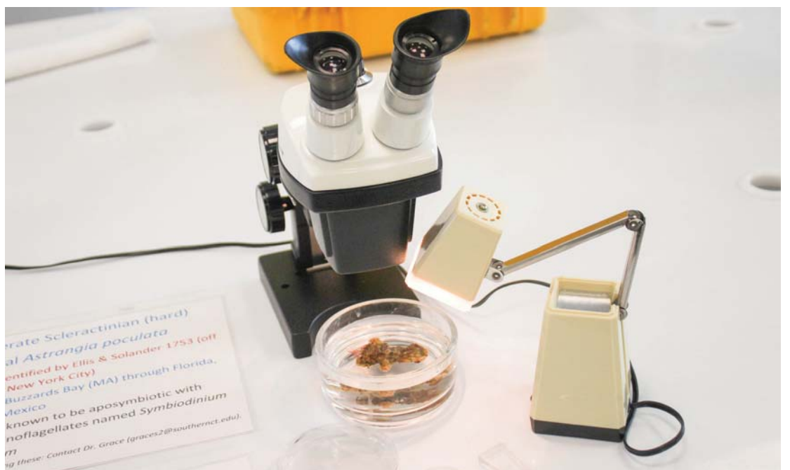
Microscope available for visitors to observe live coral.