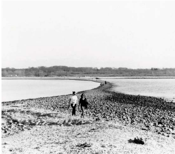
A Picture of Walnut Beach and Silver Sands from Charles Island in Milford, Conn.

"The meaning of art to me is that it is all about creation and I am creating something new and original."