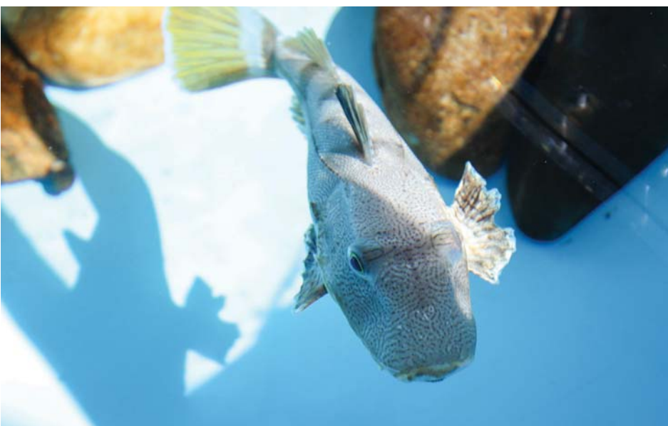
Sea robin being swimming in the saltwater tank.