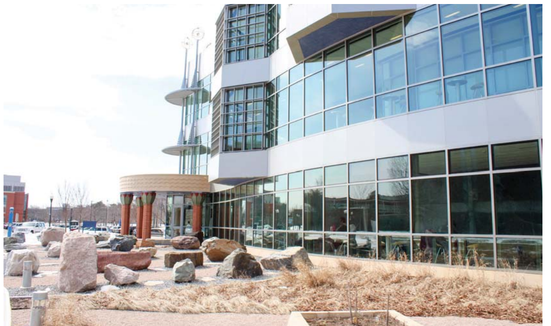
Exterior of the science building.