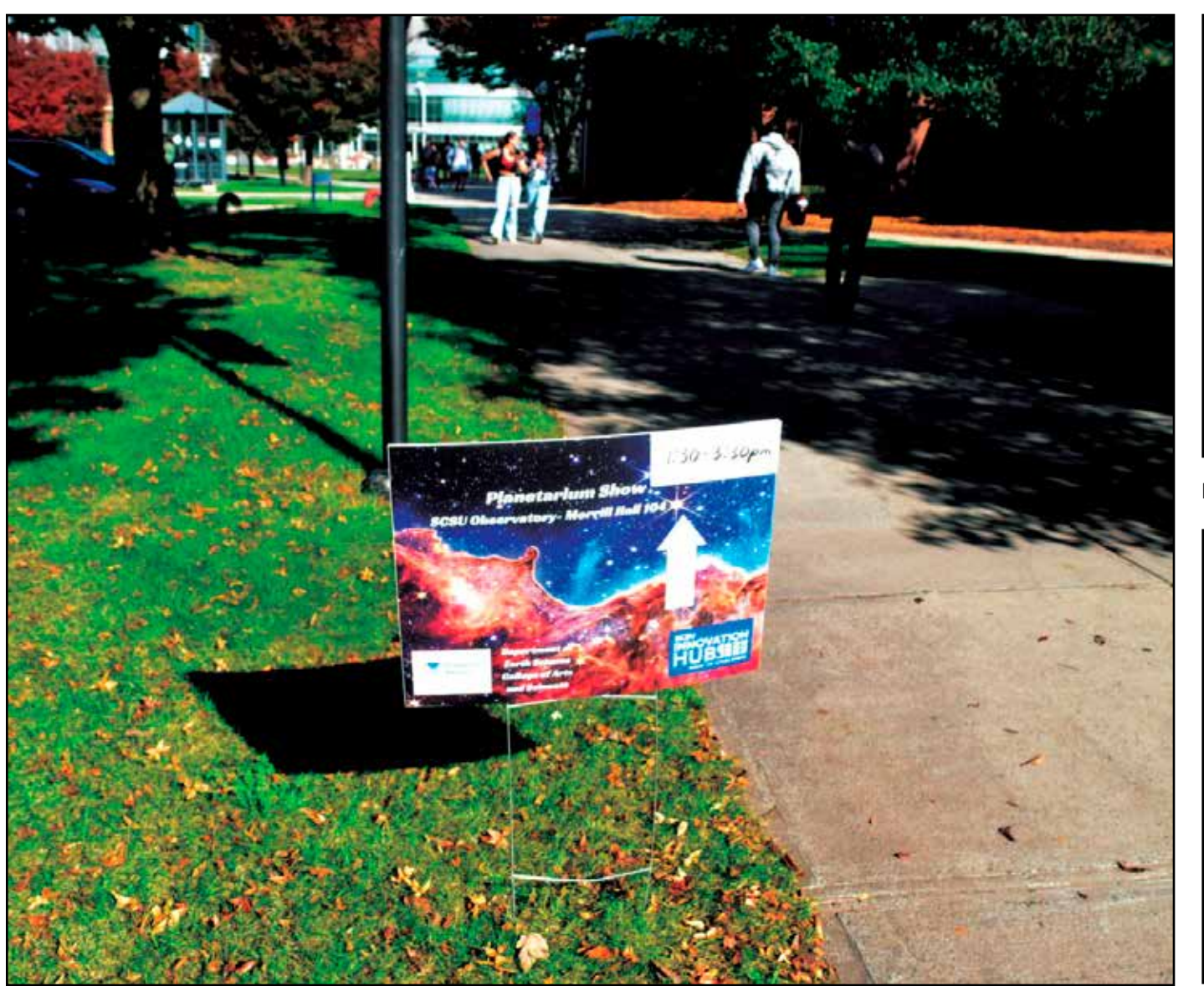
The sign advertising the show playing in the planetarium.