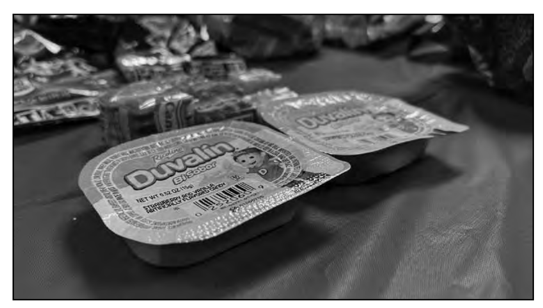
Candy flavored cream dessert ready to be eaten by guests.

As the upcoming semesters make their approach, the members of Hermandad de Sigma Iota Alpha sorority are hoping to get their name out there, and continue to plan events that will bring everyone together.