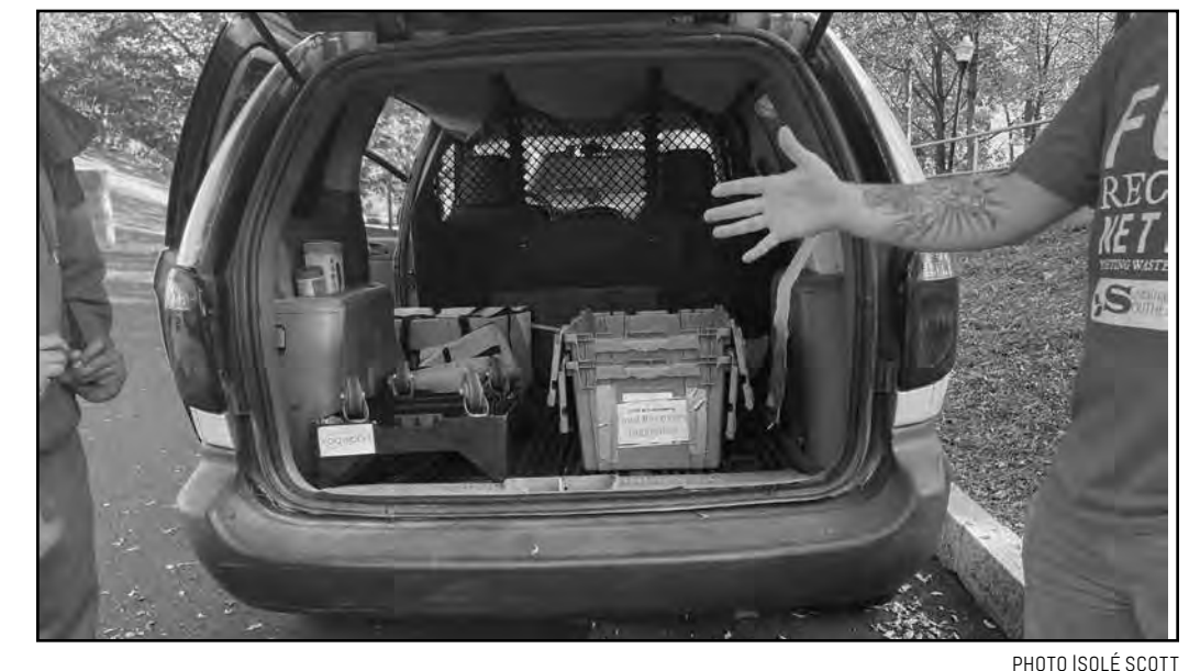
The university van that is used to transport food to places off campus.

The recovery will be happening throughout the week from 2 p.m.- 4 p.m.