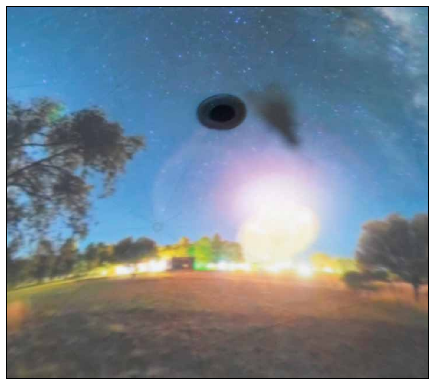
Part of the "Journey to the Center of the Milky Way," showing a view of the stars from Earth.

A sign showing the planetarium showtimes.