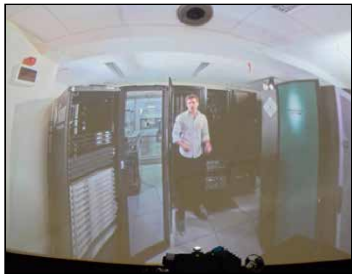
Part of "Journey to the Center of the Milky Way."