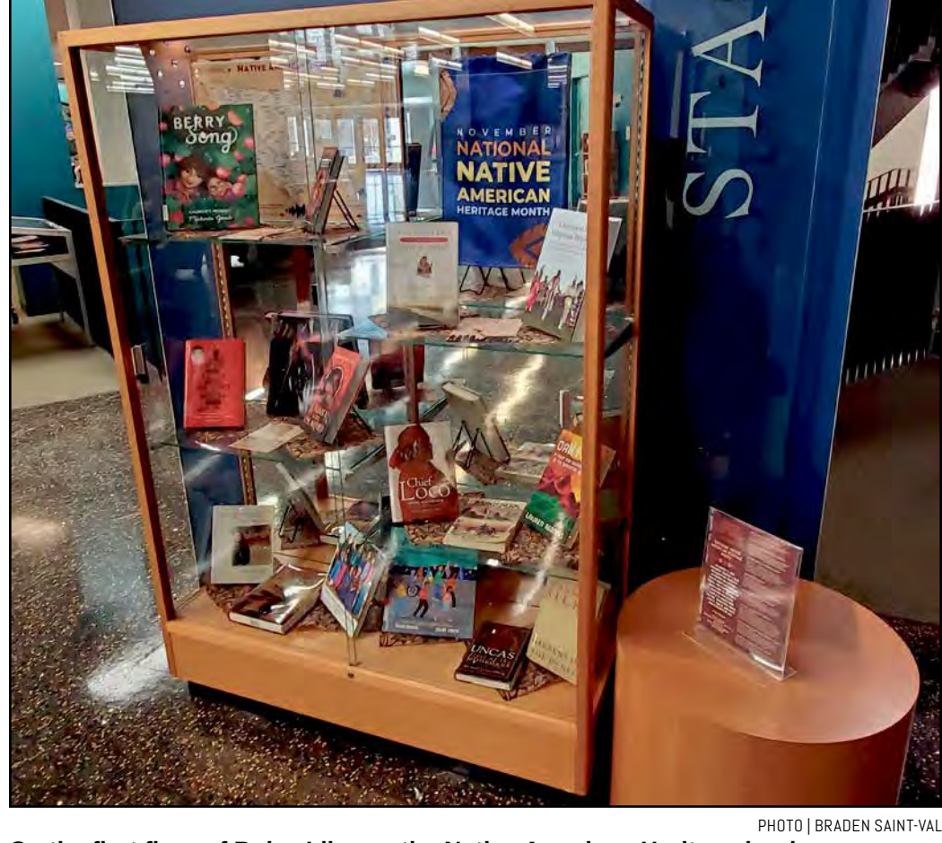
On the first floor of Buley Library, the Native American Heritage bookcase highlights books that honor Native American culture, such as "Chief Loco."

studies, the overall curriculum falls short in doing justice to Native histories.