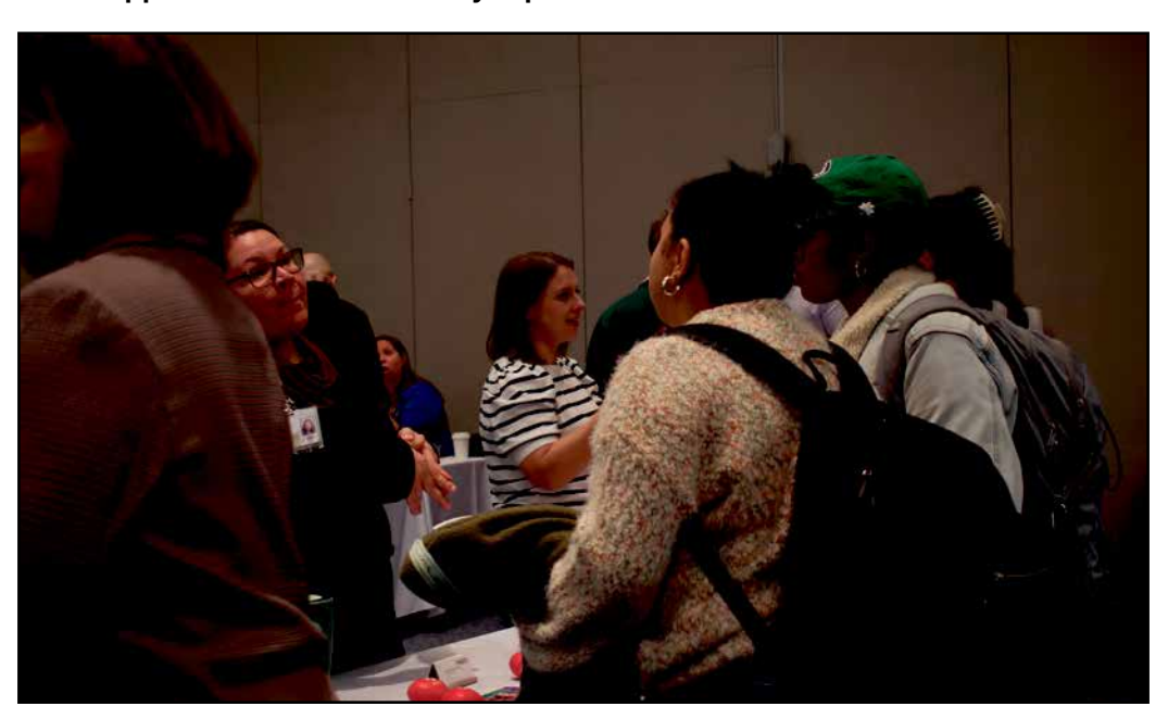
Representatives of medical organizations talking to students and answering their questions.