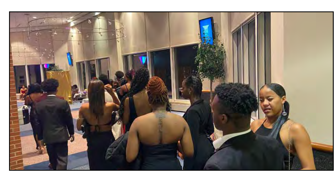
A line of guests waiting to sign in outside the Ballroom.