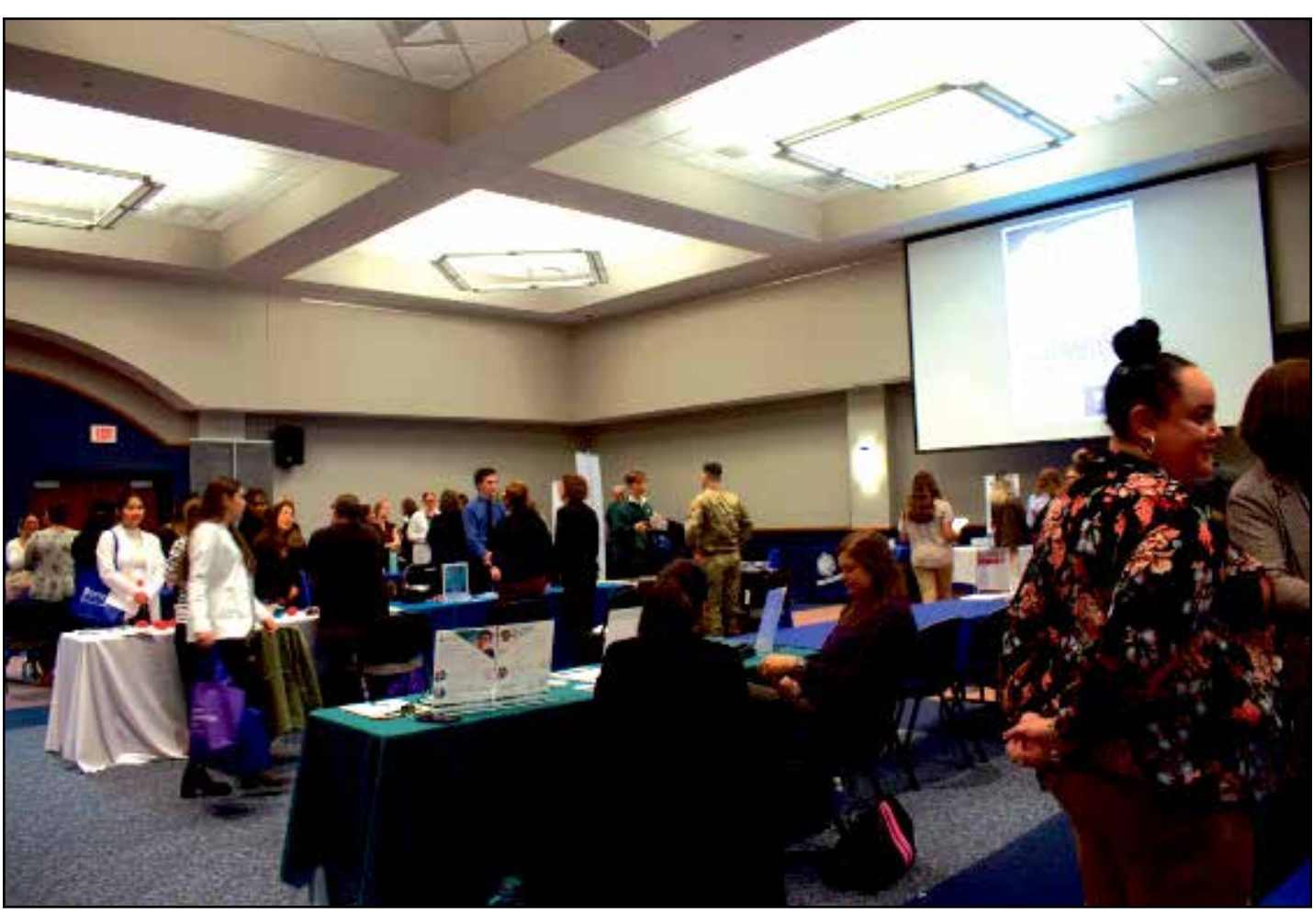
The Adanti Student Center Ballroom, full of tables and opportunities for prospective and current nursing students.