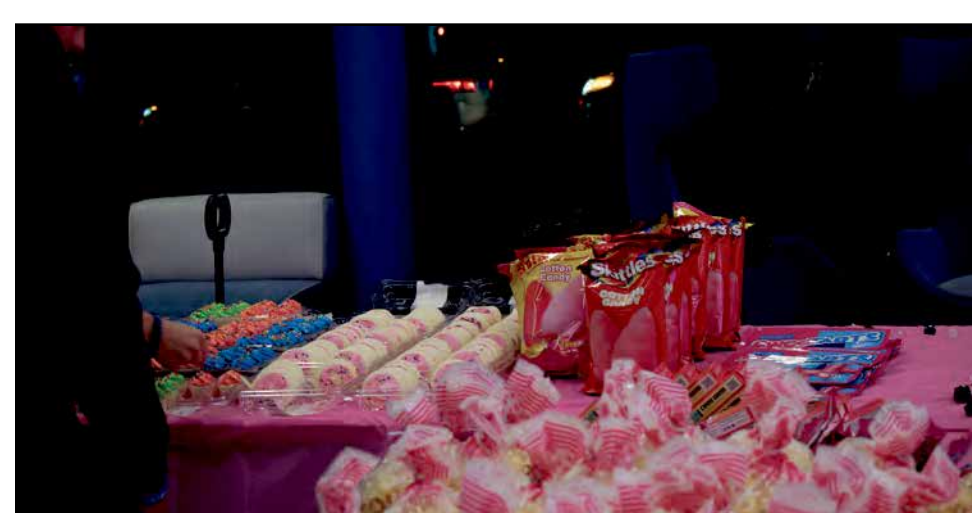
Pink colored snacks offered to students attending the "Barbie" viewing.

On Nov. 8, the School of Business, Women in Leadership Initiative and Pro-Con held "Barbie Movie Night" for students to connect, wear pink and watch 2023's "Barbie." This was a fun event to go to on a Wednesday night. There were a lot of snacks and a raffle at the end of the movie. Three students won $50. This empowering event brought students of all majors together in the School of Business' Auditorium. See full story Page 6