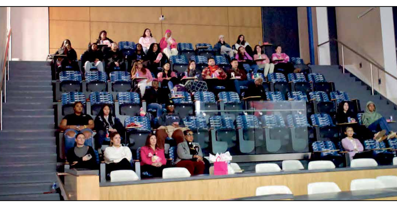
The School of Business' Auditorium full of students watching "Barbie" on Nov. 8.