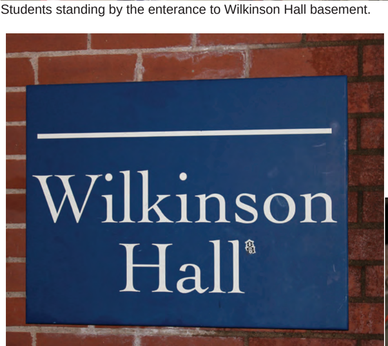
Wilkinson Hall sign before entering the building.