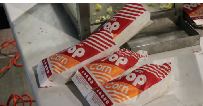
Popcorn bags for students to grab while heading into Wilk.