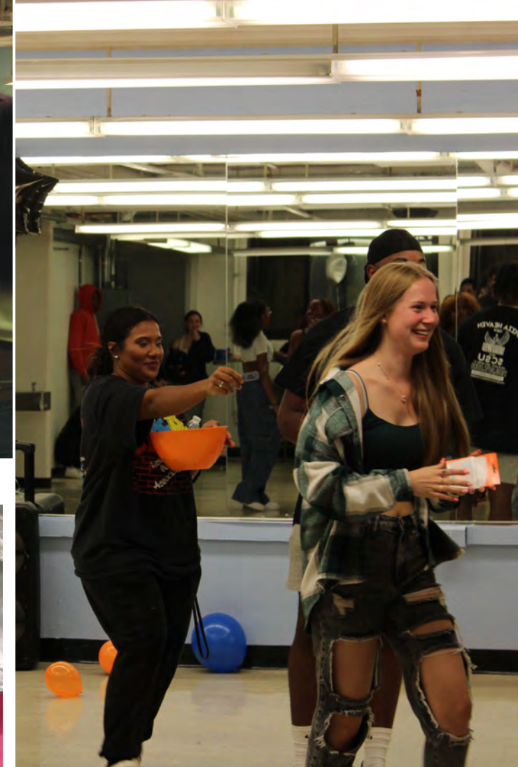
First raffle winner grabbing her gift card after name was called.