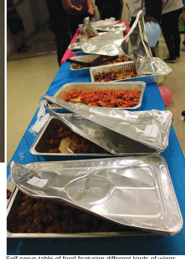
Self-serve table of food featuring different kinds of wings.