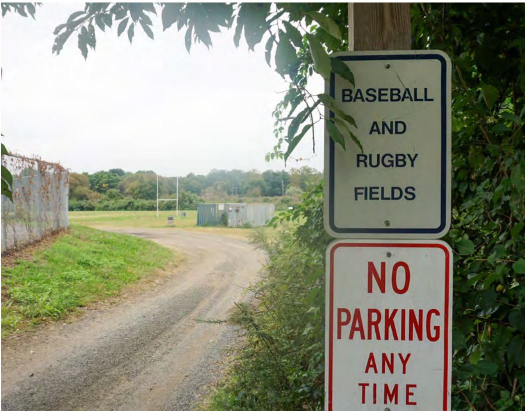
Entrance to the rugby and baseball field.