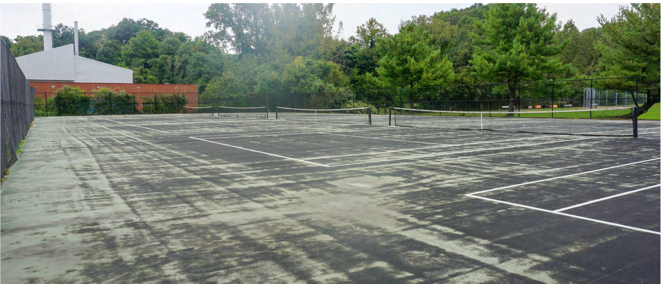
Sparsely used and aging tennis courts located behind the Wintergreen Parking Garage.