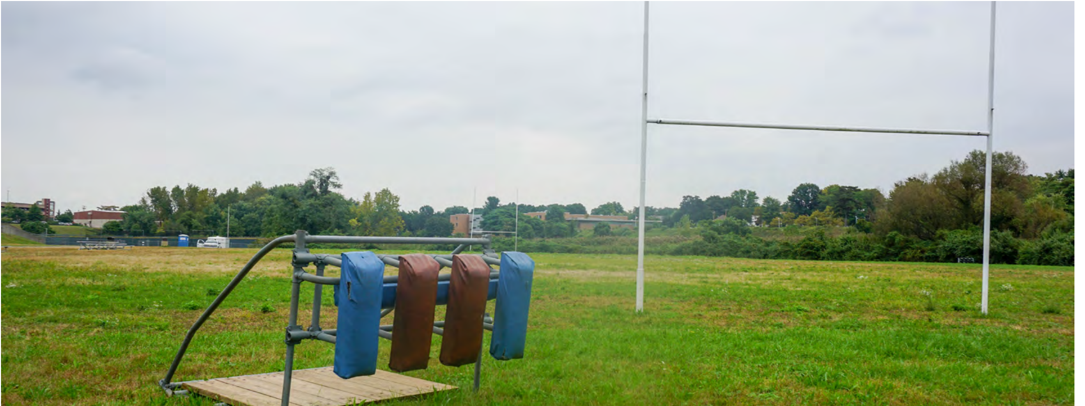
The rugby field which was banned from use due to it being deemed an unsafe playing surface.