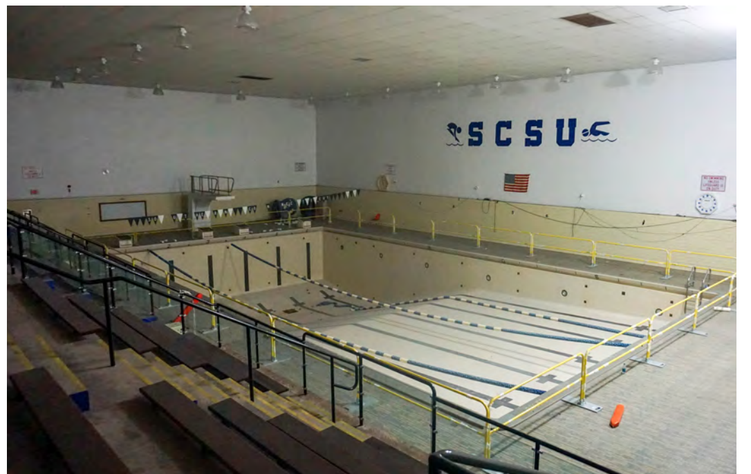
Natorium in Pelz which is not being used due to lack of funding.