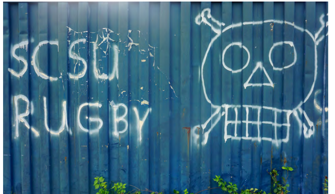
Shipping container spray painted on the rugby field.