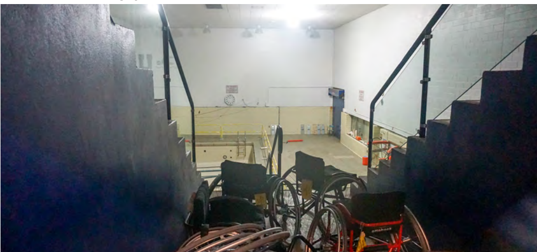
Adapted sports wheelchairs being stored in the entrance of the natatorium.