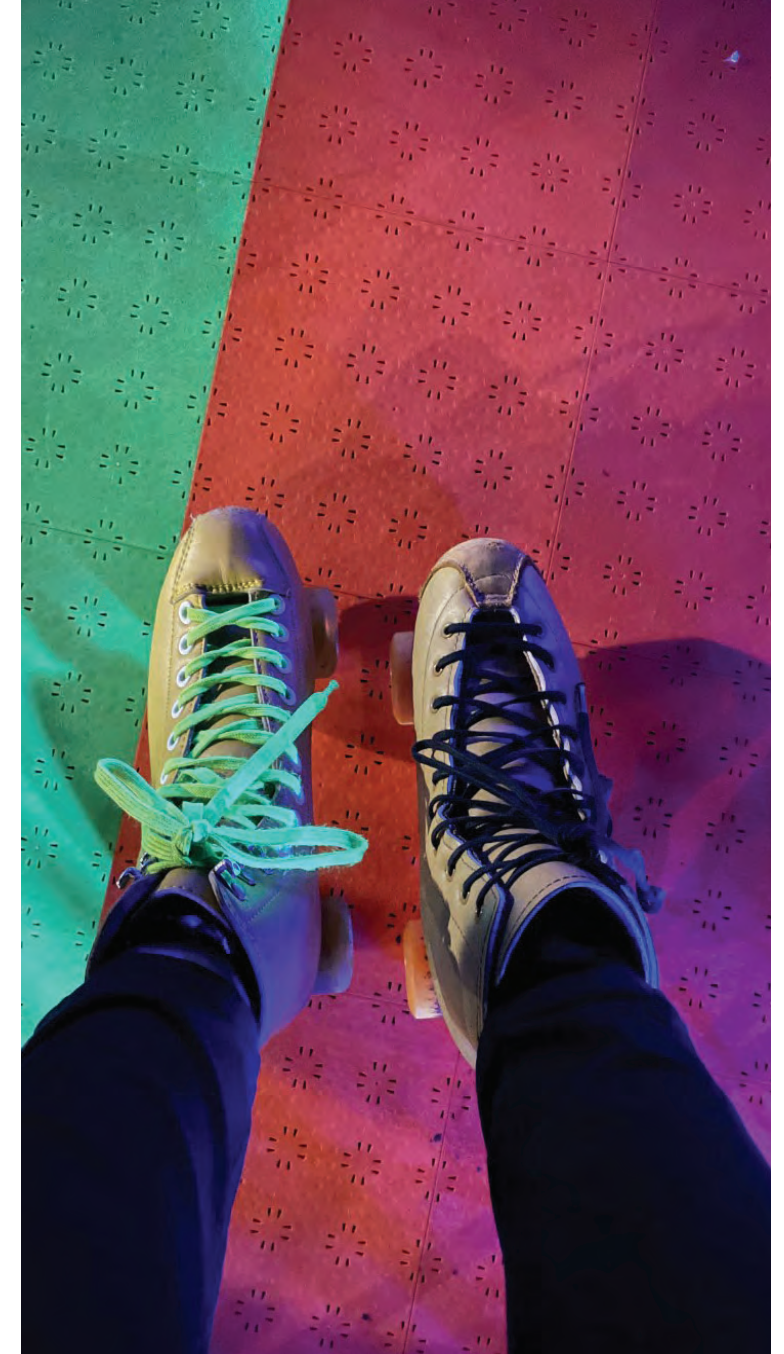
A pair of skates laced up ready to be skated on.