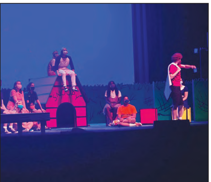
Cast of "You're a good man Charlie Brown" on stage

Snoopy in particular got the loudest ovation, serving as much needed comic relief in a story centered around Charlie Brown who is upset and depressed with his ineptitude and inability.