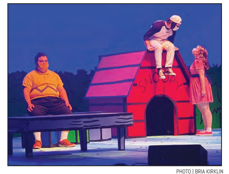
A scene from "You're a good man Charlie Brown."

"This is my first real musical I've been to here