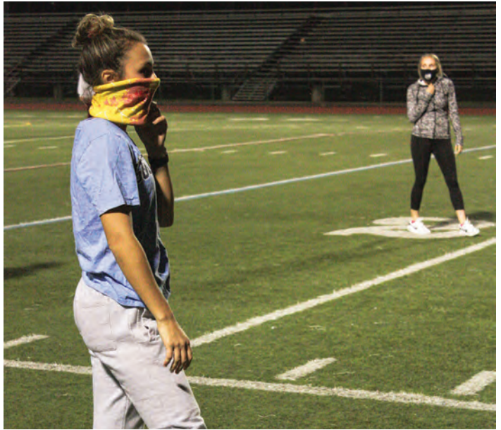
A team member waits for her chance to run to home base.