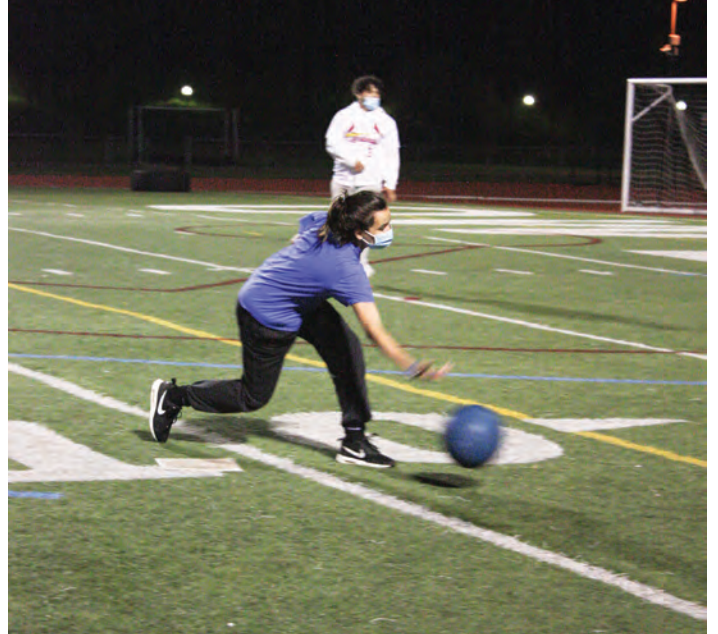
A student pitches the ball to the other team during the Kickball Tournament.