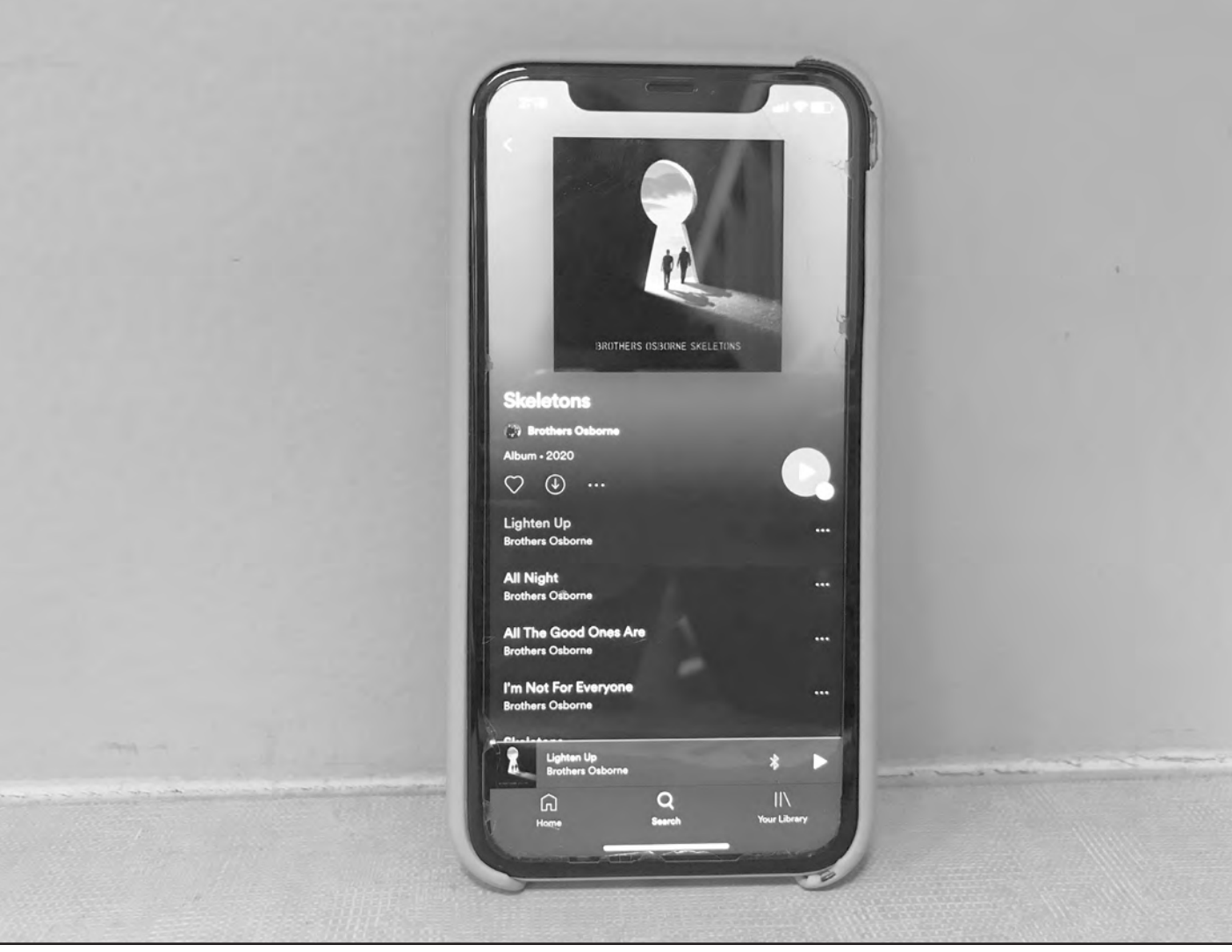
Brothers Osborne single "Lighten Up" from their album Skeletons on the Spotify app.

This segues into "Dead Man's Curve," which is an out of nowhere country rap barn burner that is unapologetically nothing more than a get off your feet and lose your mind anthem. A vibe of a salty breeze on a beach washes