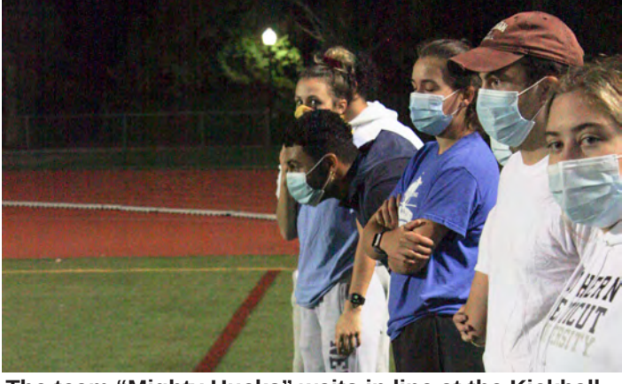
The team "Mighty Hucks" waits in line at the Kickball Tournament.

While most events have moved to a virtual format because of social distancing guidelines and capacity limits set by COVID-19, some events have still been able to be held on ground in a safe way that allows students to take a break from the stress of school.