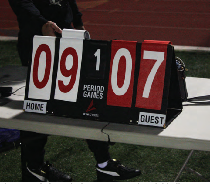
The score is kept during a game at the Kickball Tournament.