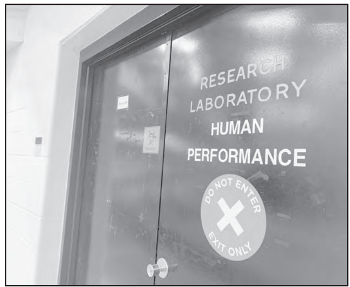
Human Performance Lab located in Moore Field House.

"We basically look at all aspects of human performance across the lifespan in different populations," said Gregory. I always tell my students on the first day of class, human performance isn't just about running fast, jumping higher, or throwing faster."