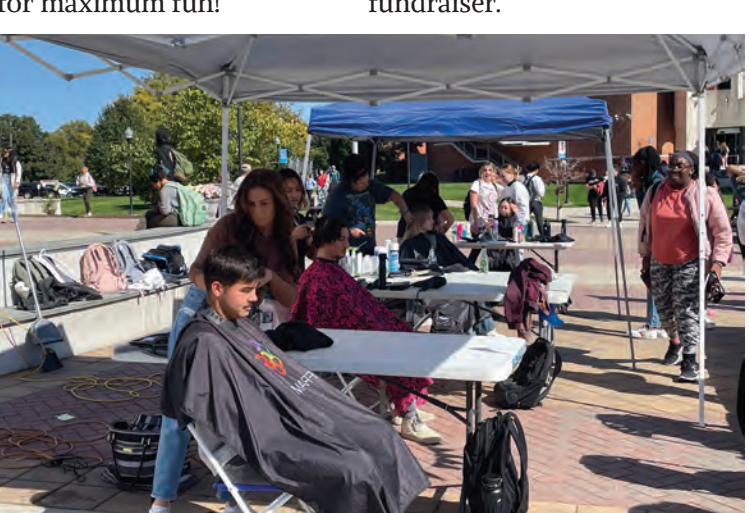
Students getting their hair done under the set-up tents.