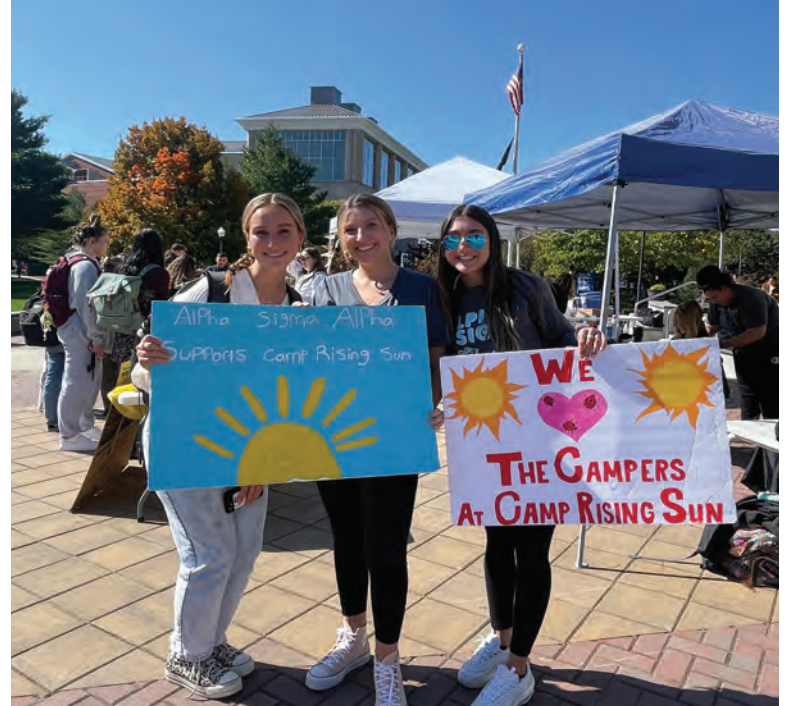
Alpha Sigma Alpha sisters holding signs to attract students to the haircutting tents.