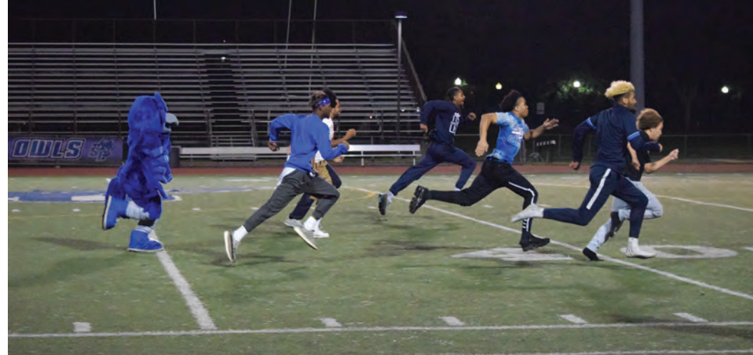
Students running on the field with Otus the Owl.