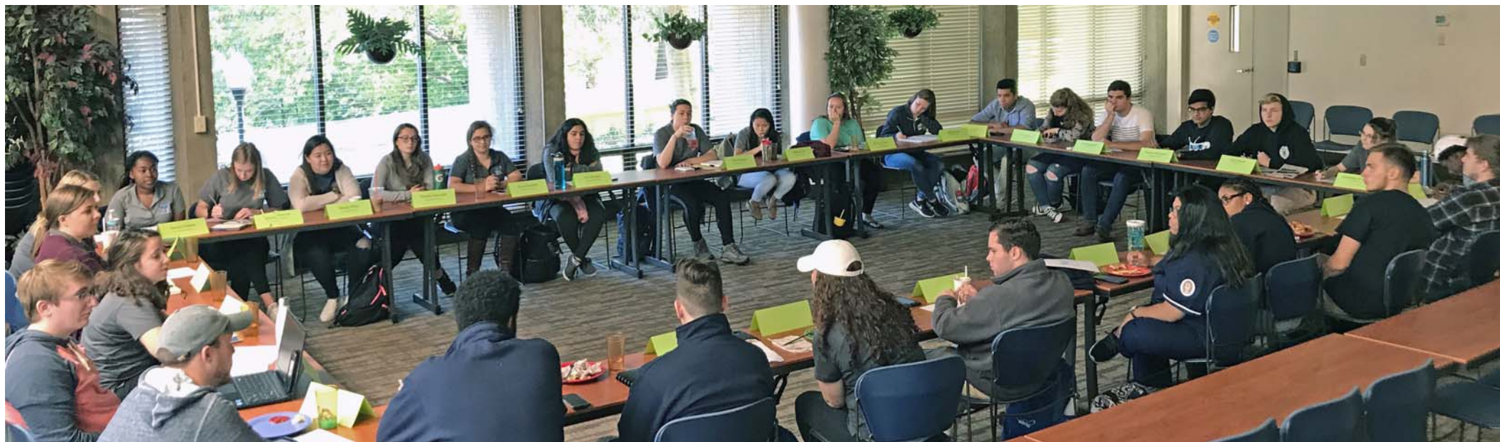
Students participating in SGA meeting to make several changes and resolutions.