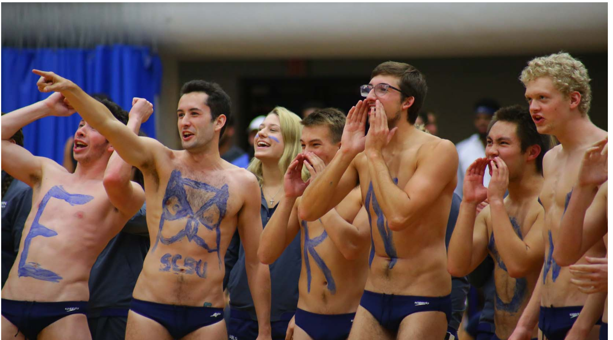
Swim team taking center stage at the rally.