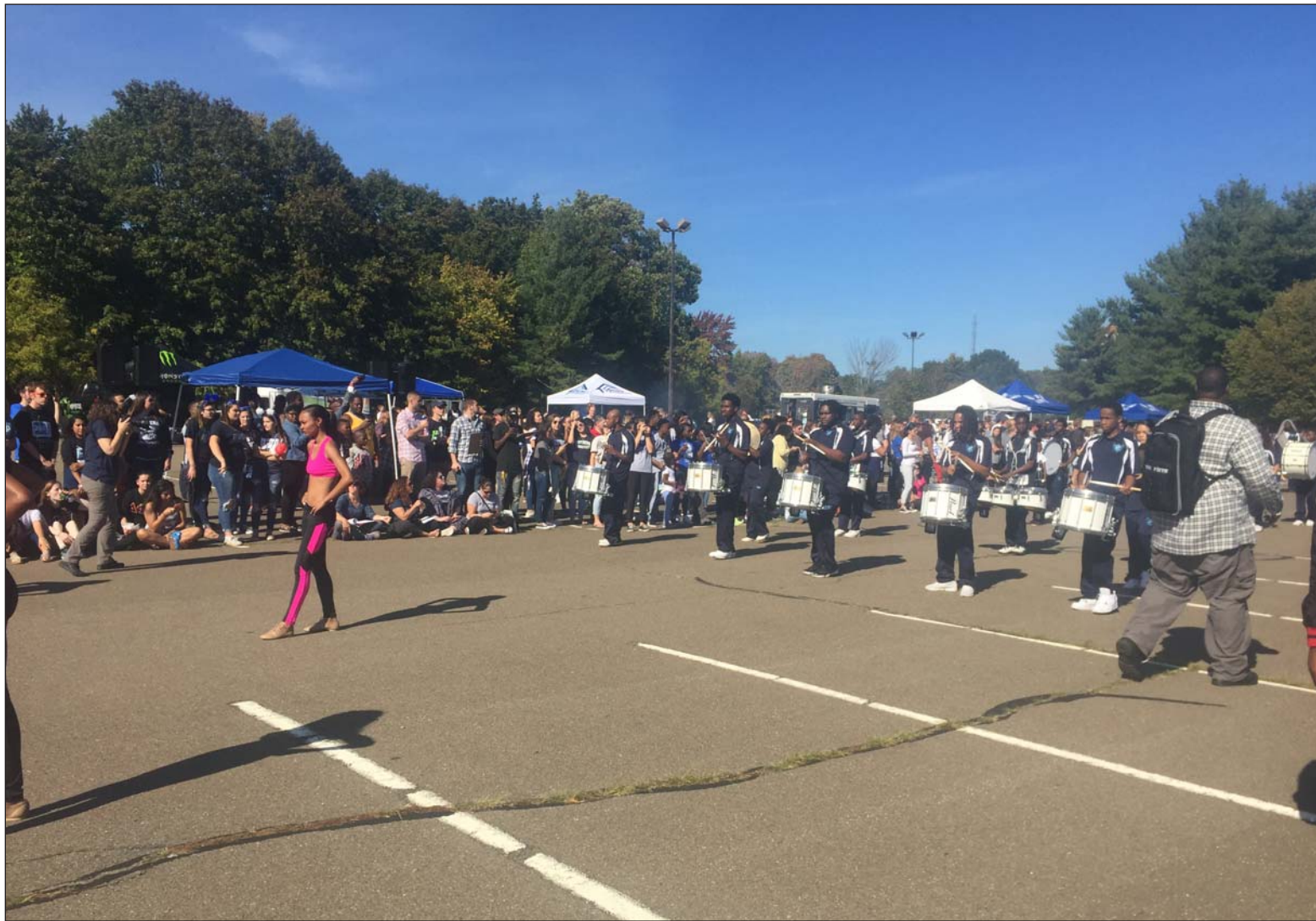
Students gather at Southern with spirit to celebrate Homecoming Day