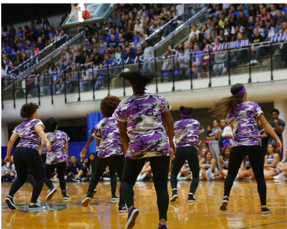
Step team performing in front of crowd.