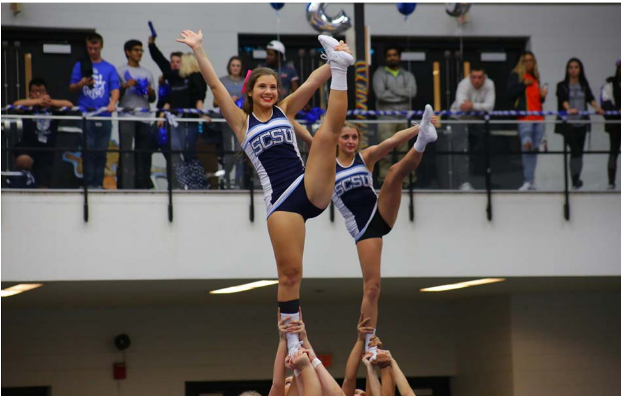
Cheer team performing at the opening of the pep rally.