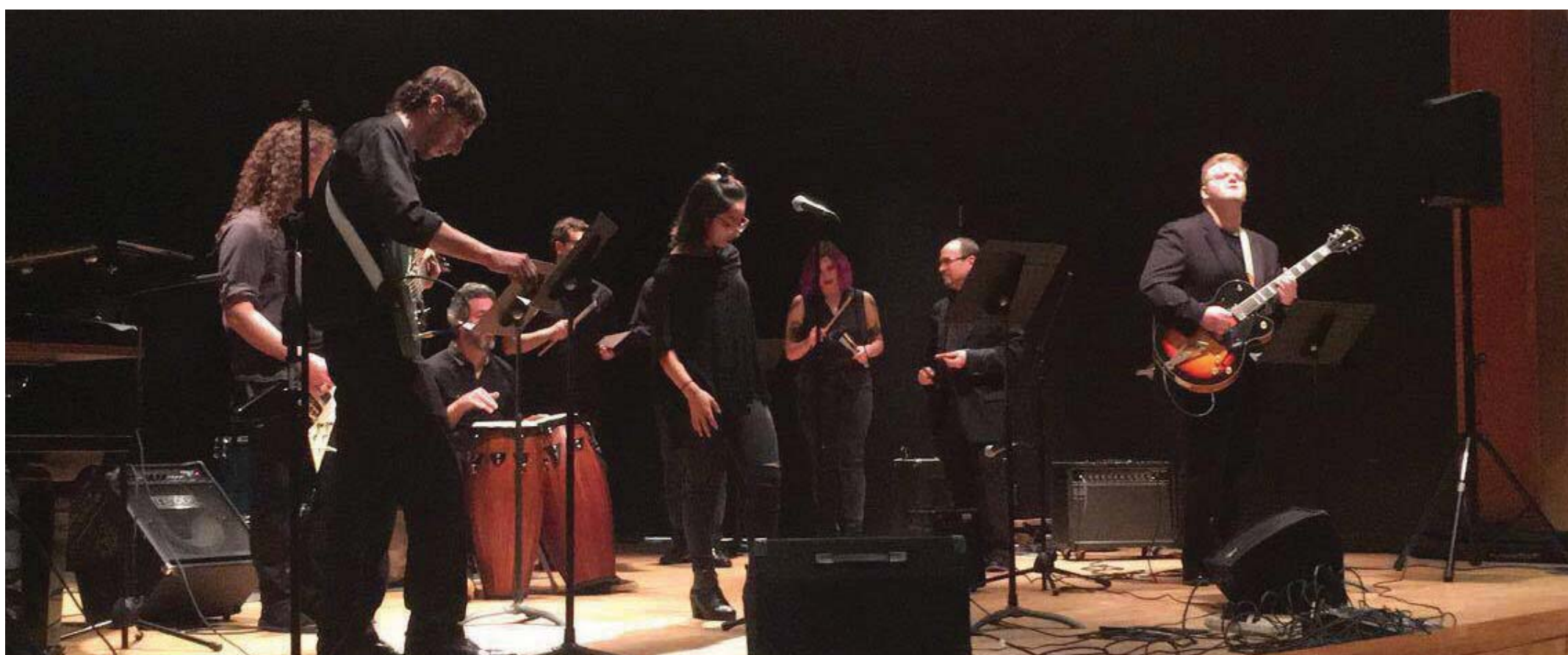
A jazz ensemble performing at the Small Ensembles Concert in Engleman.