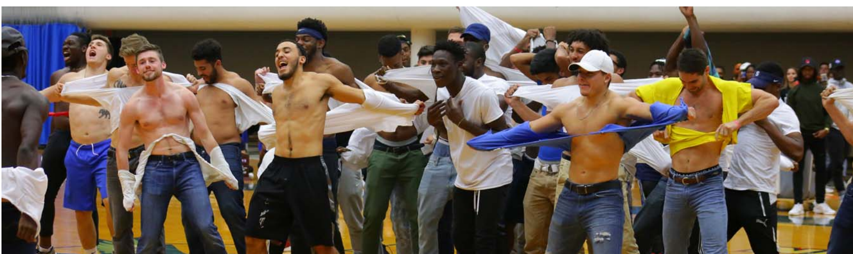
Men's track team ripping off their shirts during their spotlight time.