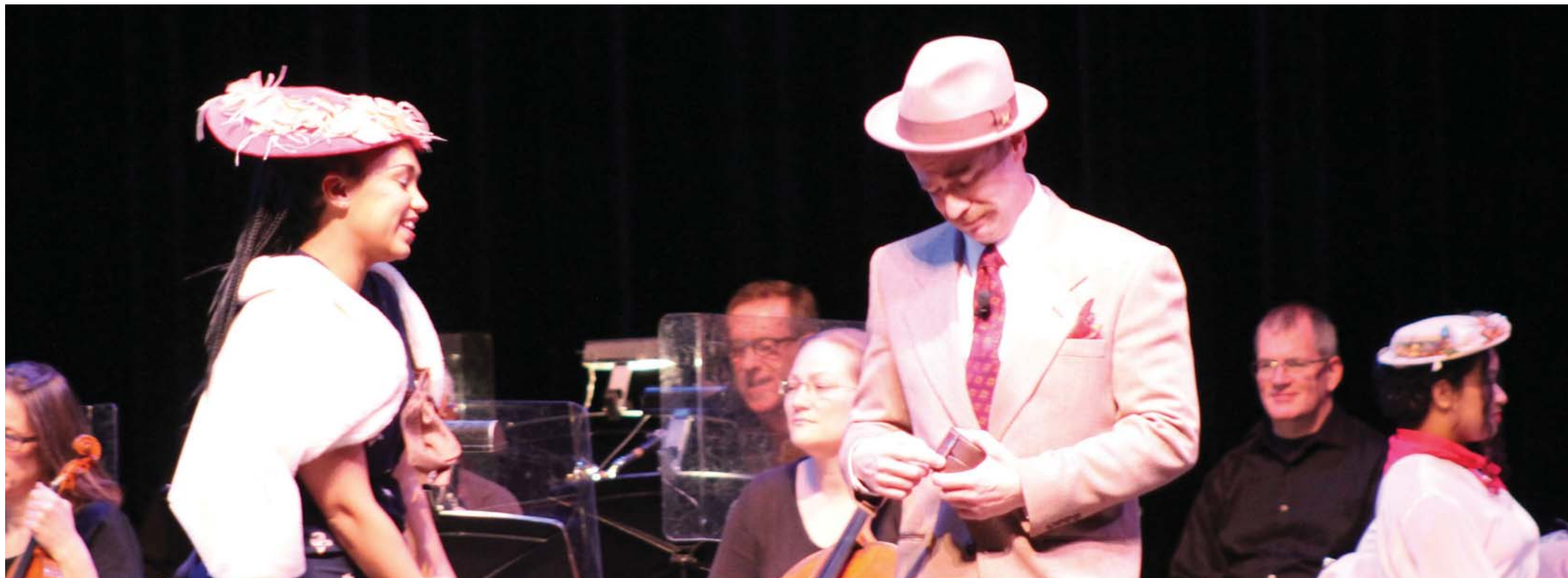
Two performers on stage during the New Haven Symphony Orchestra's production of "Guys and Dolls."