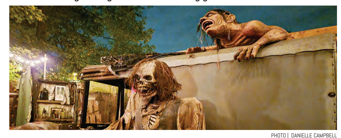
Scary props set up at the Trail of Terror event in Wallingford, Connecticut.