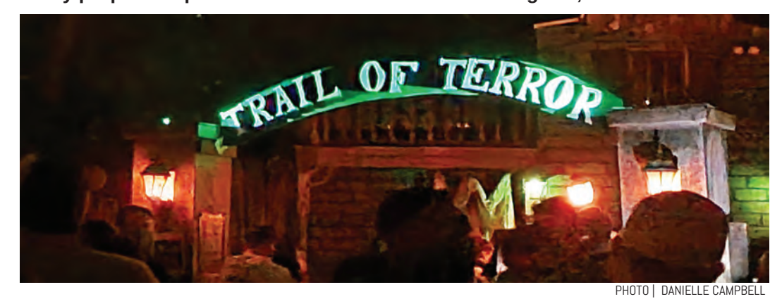
Green lit up Trail of Terror sign above students right before they walk in.