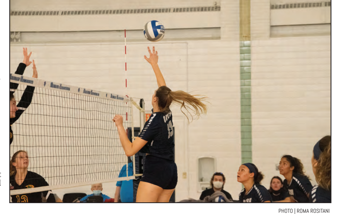
Tuesday's home win marked the Owls 12th in Pelz Gym this year and 17th overall.

Both teams are 3–3 in NE10 Conference play, so the Adelphi matchup could prove vital later on.