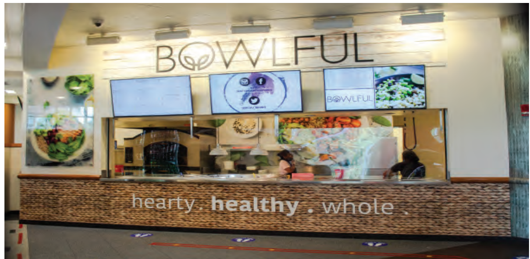
Bowlful, a new and healthy alternative to the other new options in the cafeteria.