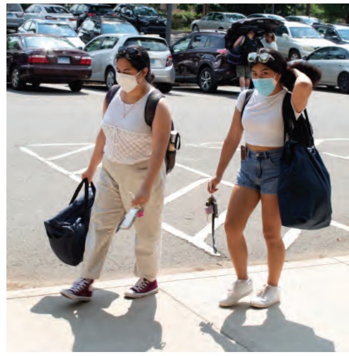
Taking the proper precautions as they move in.

Residents move their belongings into North Campus.