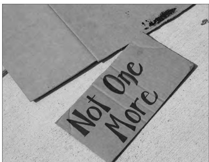
An activist's sign on the ground at the protest.