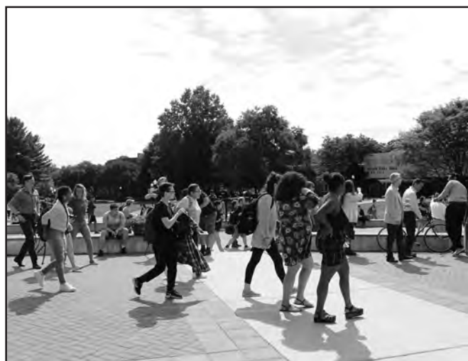
Activists walk to the bottom of the pedestrian bridge to continue the rally.