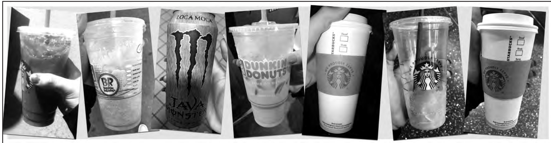
A collection of caffeinated drinks, over the course one week.

Caffeine does not make me feel good, personally, it makes me feel horrible. I have a roommate who drinks coffee and gets tired from the caffeine. Caffeine has vastly different effects on different people, so maybe it works for some, but not others. I have heard of some health benefits of drinking a small amount of caffeine, but drinking it just for the energy boost is not for me.