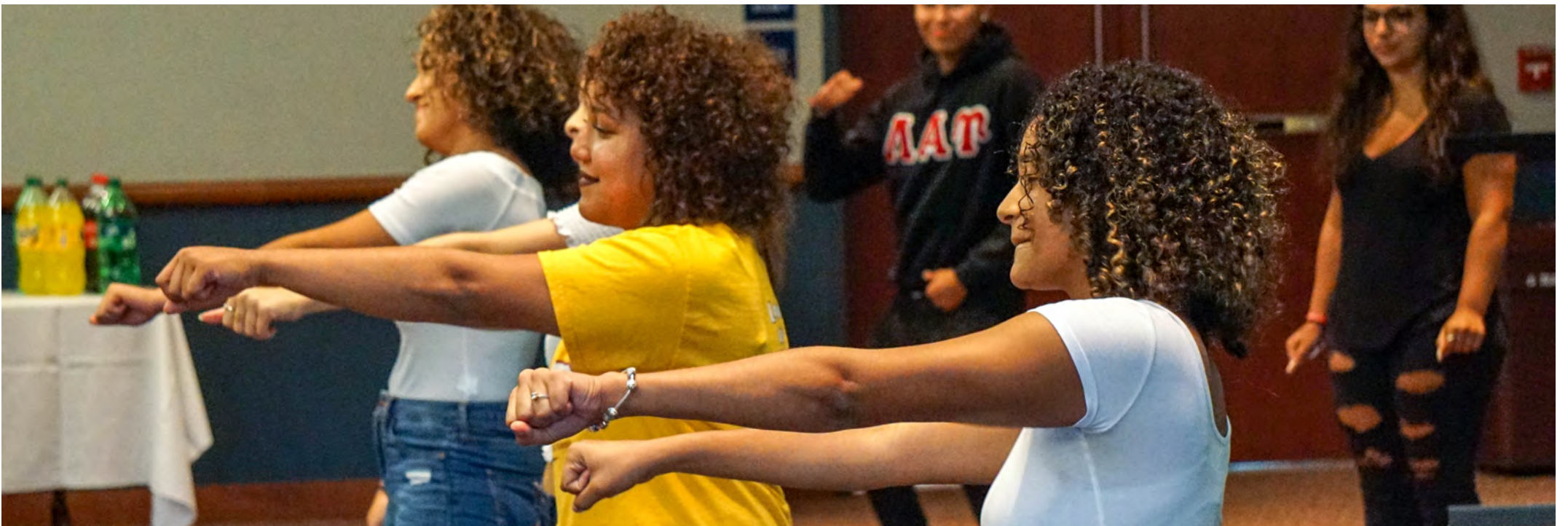
The Organization of Latin American Students' dancers performing at the event.