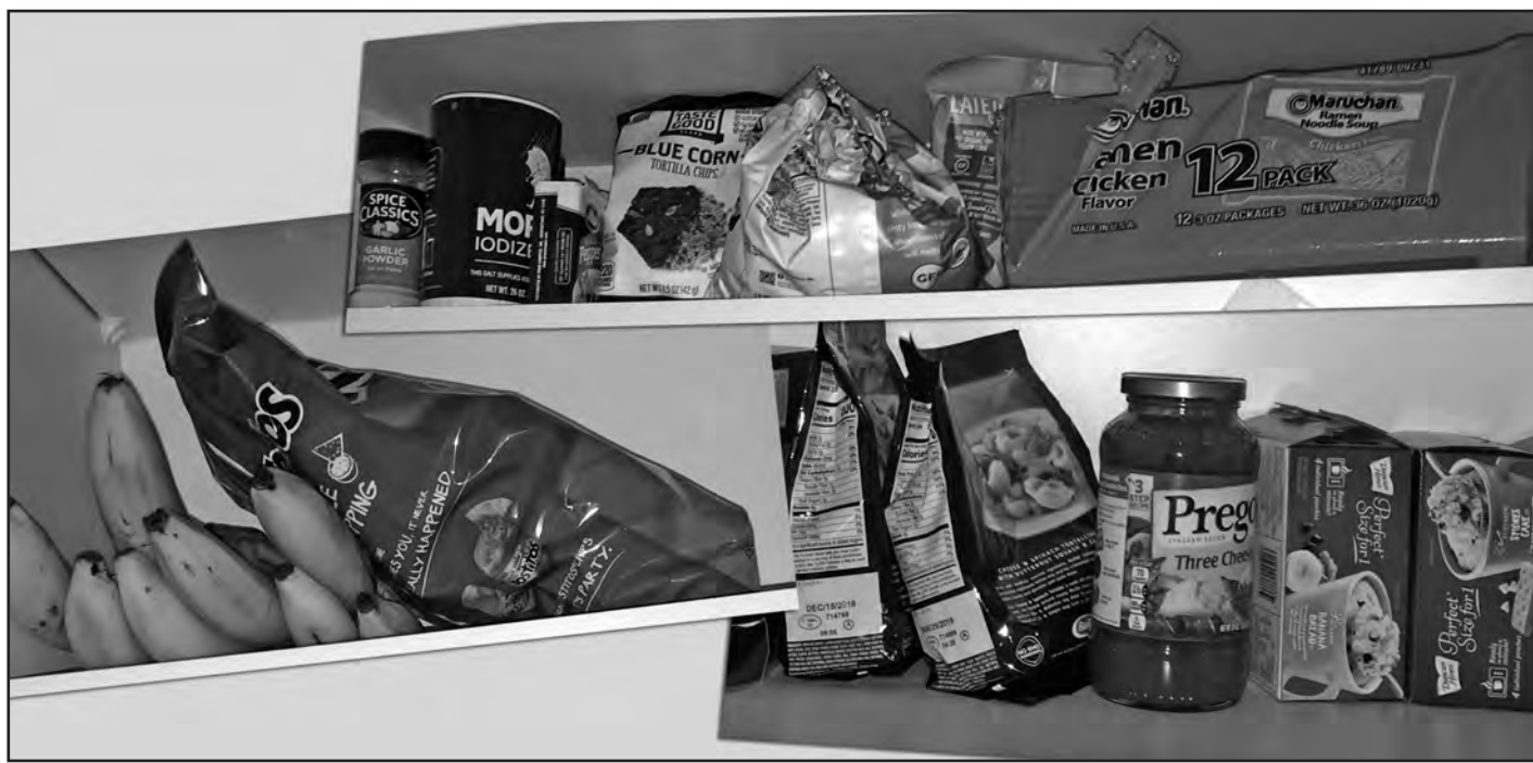
Groceries, stored in a dorm room pantry, ready for use in future meals.

pleasant relationship with people you live with. I believe cooking can bring people together; eating is social activity, and should be enjoyed with your friends and family.